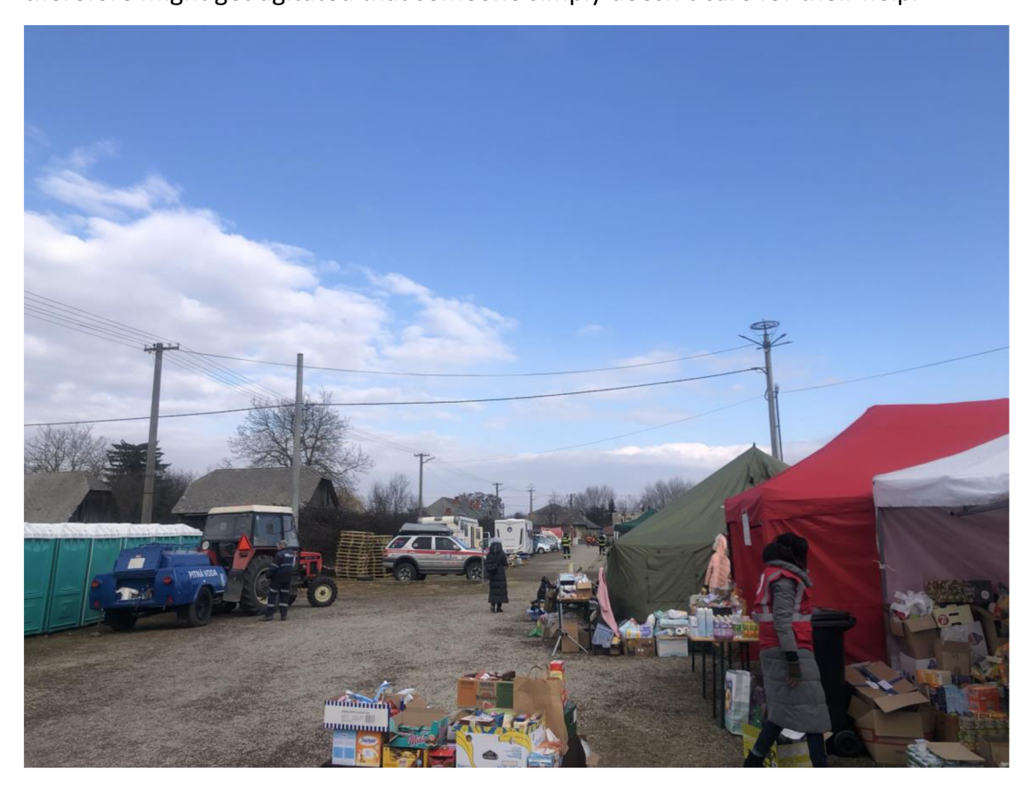
Picture 1 – Refugee camp - Veľké Slemence February 2022

experiencing horrible events. A privilege people from outside will never fully understand and therefore might get agitated that someone simply doesn't care for their help.