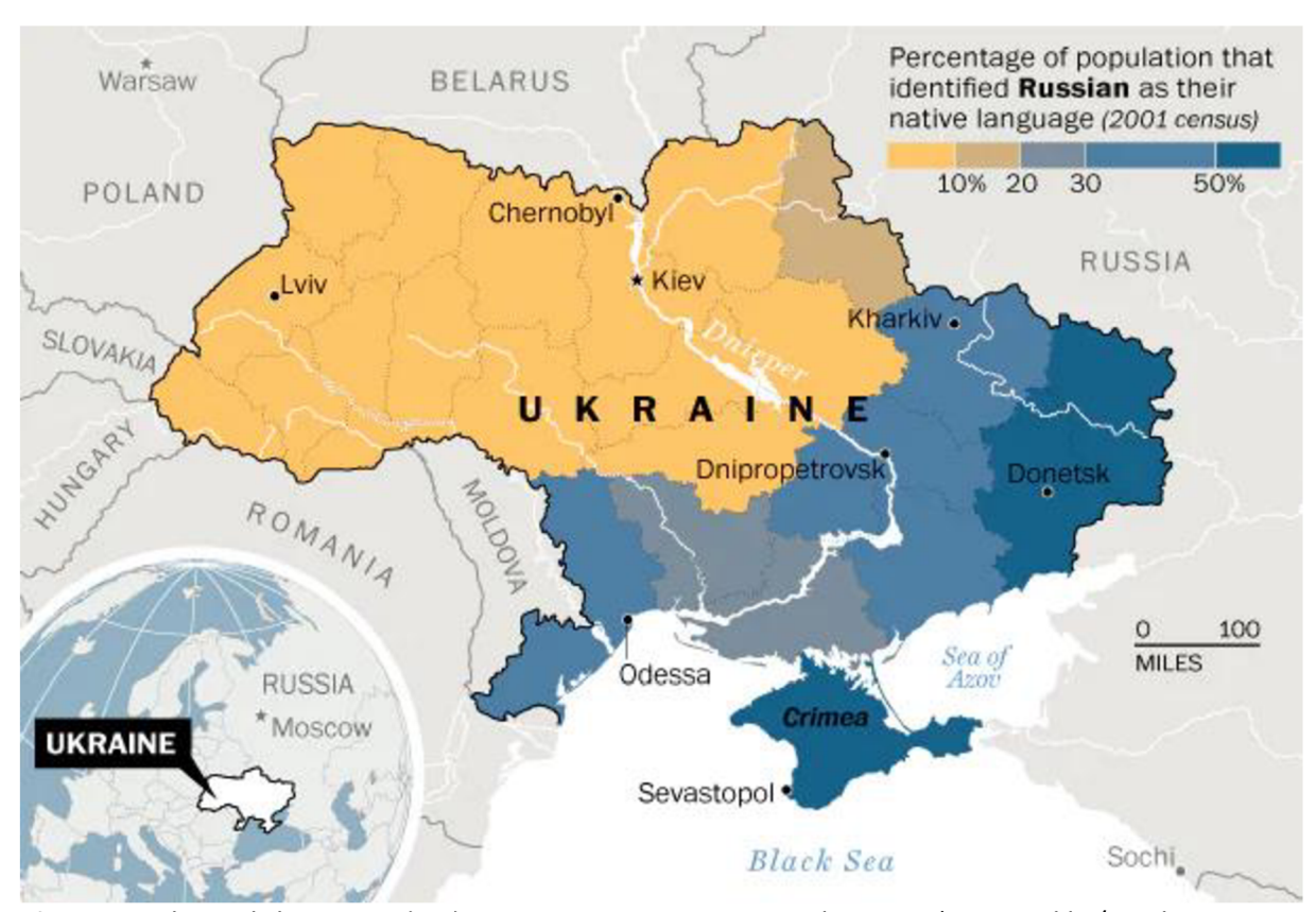
Picture 4 - Ukraine's language divide. Data source: 2001 national census. (Laris Karklis/Washington Post)

The map shows the clear division between Ukrainian and Russian speakers as the division between East and West. A division that is later used as a tool to start a war. This is the third attempt to define Ukrainian politics as pro-EU. The first spark of EU-directed politics was the independency in 1991 followed up by the Orange Revolution (2005) and Maidan Revolution was the third wave of Ukrainians voicing their opinion. January 17<sup>th</sup> during the Euromaidan protests was marked by the call of public organizations for a last resistance, a last stand. The idea was simple. People would gather at the square of Independency in Kyiv. Two days later police riots would break up with the intent to stop the protestors from using police brutality. The conflict escalated to the point where protestors started making Molotov cocktails and throwing stones at the police. January 22<sup>nd</sup> was the day that will live in the mind of Ukrainians forever. A police sniper shot dead two protestors Serhiy Nigoyan and Mykhailo Zhyznevskyi. This was a point of no turning back for the Ukrainians fighting for their freedom. There was no more talking or negotiating. There was only demanding and taking what they believed to be theirs. A month of chaos took hold of Ukraine after the sniper