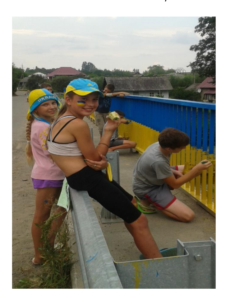
Picture 5 – Nizhny Stanivtsi 2014 – bridge being painted by local children to the colors of the Ukrainian flag

incident and the end was near. Trapped at the Maidan square the protestors formed a line and marched towards the parliament. The Ukrainian law enforcement started shooting resulting in almost a hundred dead. Keep in mind that the protestors were unarmed. On February 20<sup>th</sup> the parliament under Yanukovych took a vote on reducing the brutality of the police with a positive result for the people of Ukraine and shortly after that Yanukovych fled the country. All of this was witnessed by hundreds of thousands of Ukrainians living abroad. Watching and holding their breath as people were dying for a life that the immigrants had often already had. The summer of 2014 was especially emotional for all of the participants as that is the time they would often return to their families. The same way I and my family did. I remember the summer feeling so hopeful. My grandma said a sentence that was stuck in my head for years after that: "The fight isn't over, but we sure showed them what Ukrainians are made of.". I did not fully understand what she meant by that at that time.