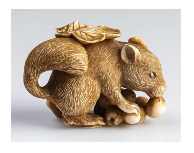
41/ Object 32.305, from the left side