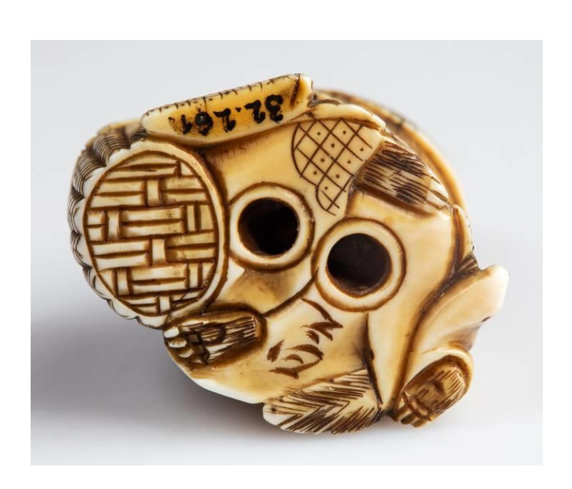
23/ Object 32.261, from the bottom