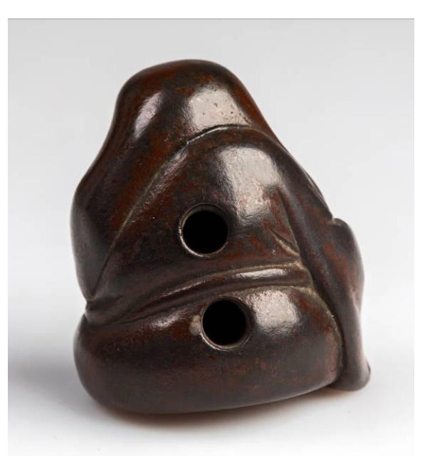
4/ Object 11.556, from the back