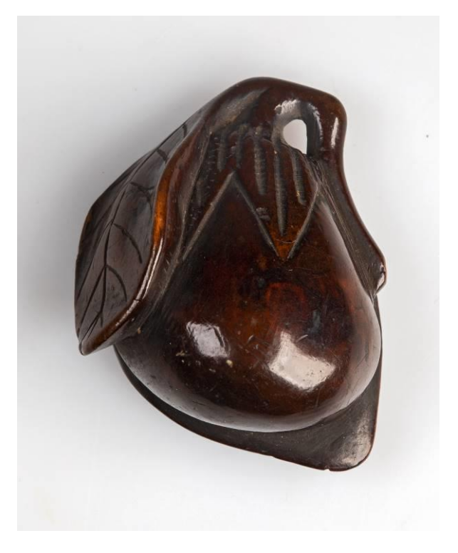
1/ Object 11.553, from the front