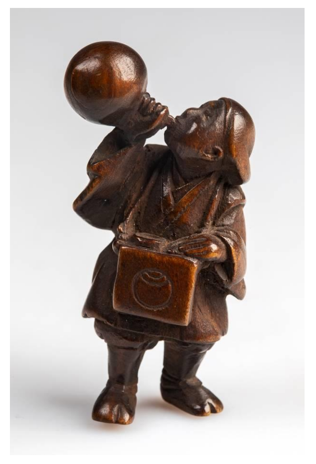
9/ Object 32.260, from the front