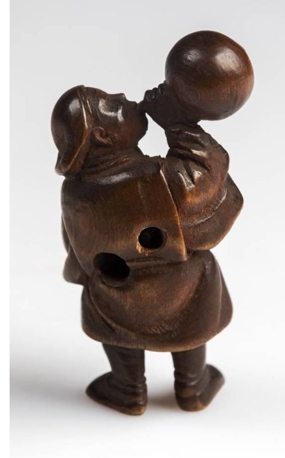
10/ Object 32.260, from the back