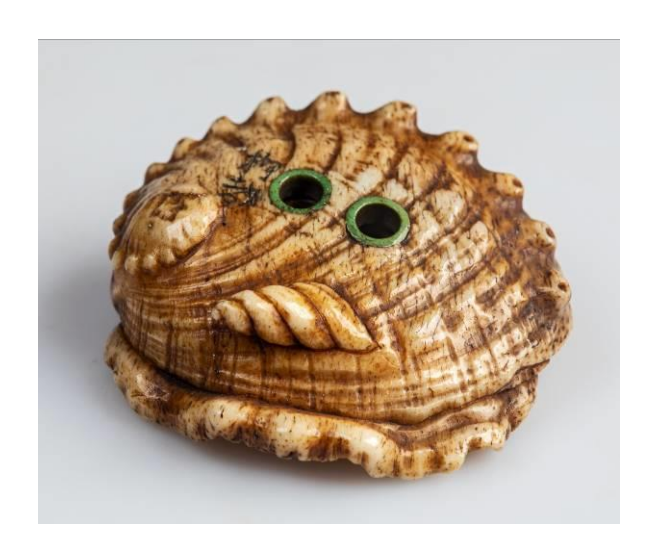
11/ Object 32.252, from the front