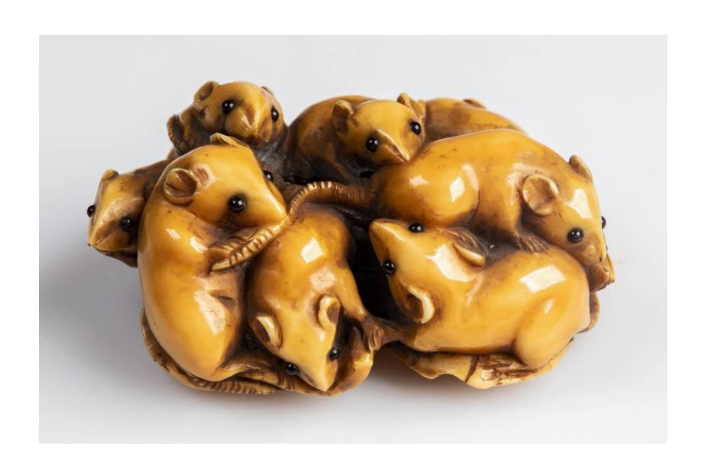
49/ Object 32.321, from the top