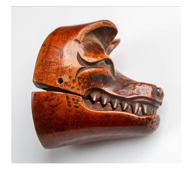
35/ Object 32.285, from the side