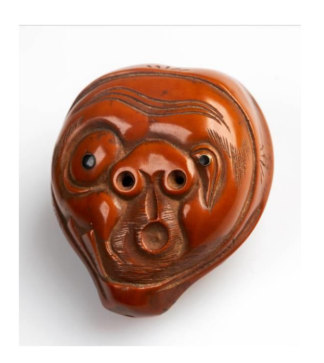
30/ Object 32.280, from the front