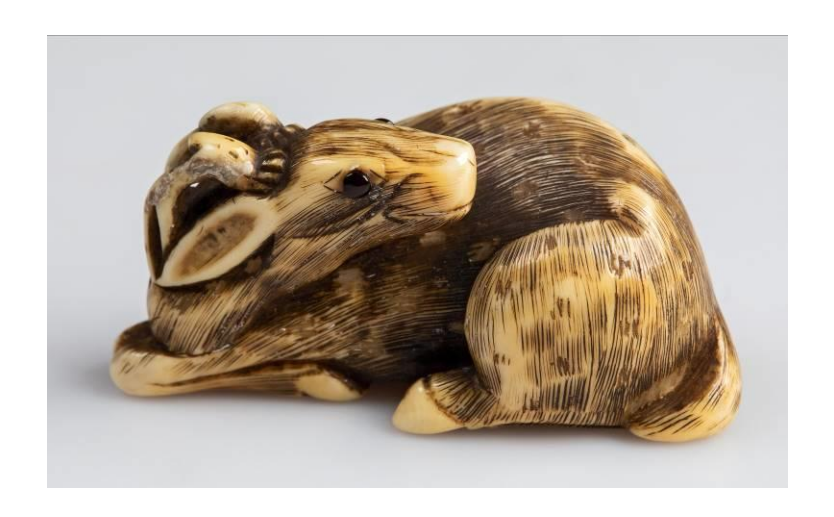
17/ Object 32.257, from the front