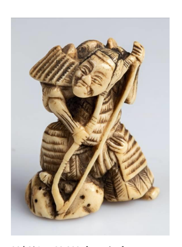
39/ Object 32.292, from the front