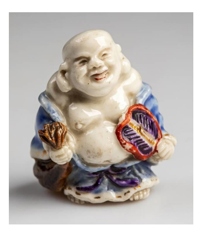
43/ Object 32.307, from the front