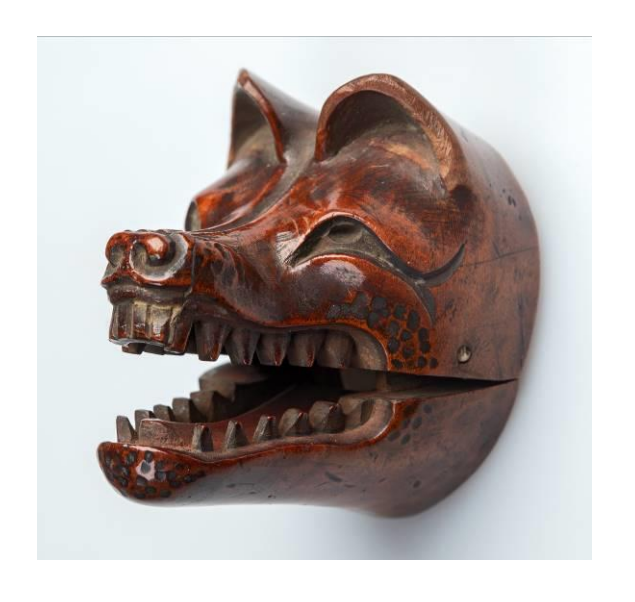
34/ Object 32.285, from the front