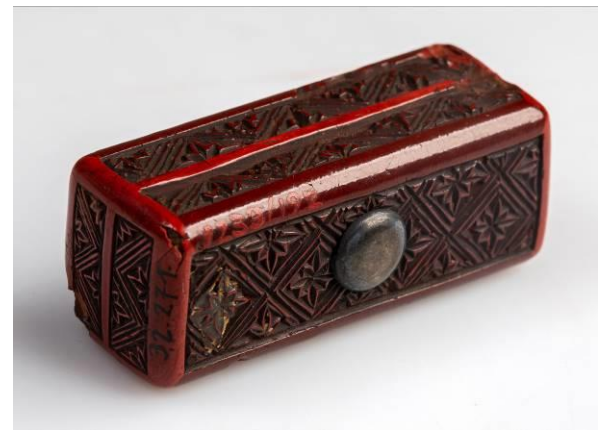
25/ Object 32.271, from the bottom