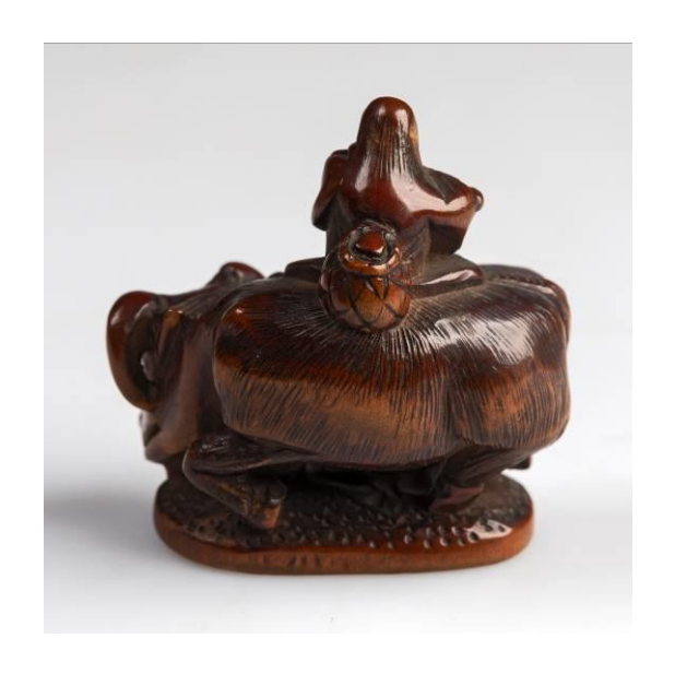
38/ Object 32.288, from the back