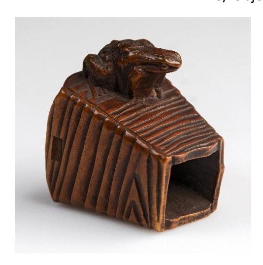
19/ Object 32.259, from the front