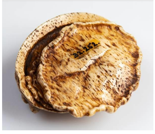
12/ Object 32.252, from the back