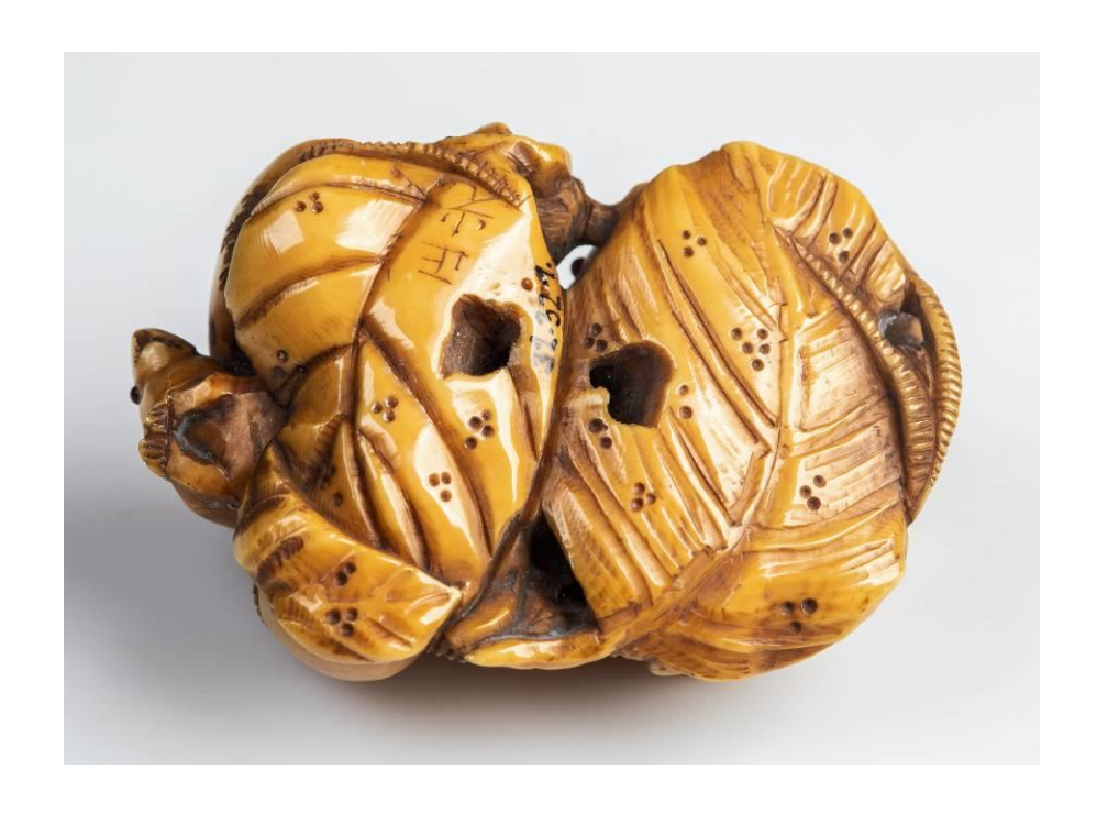
50/ Object 32.321, from the bottom