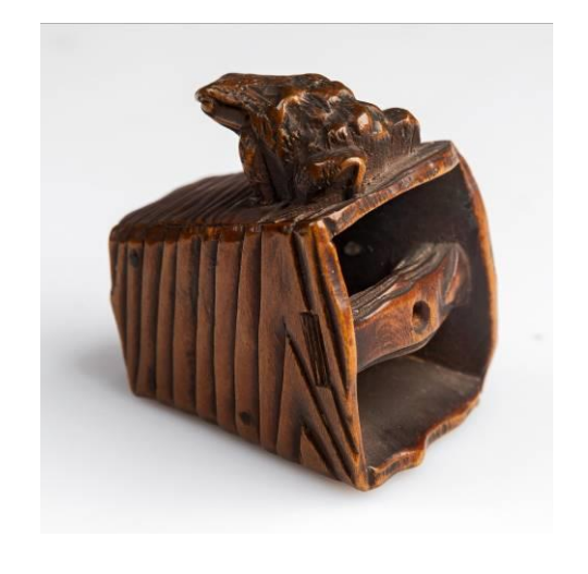
20/ Object 32.259, from the back