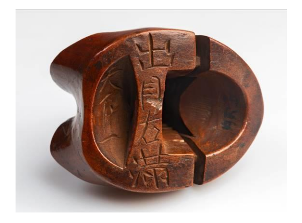
36/ Object 32.285, from the back