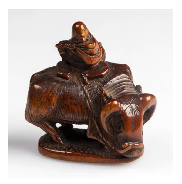
37/ Object 32.288, from the front