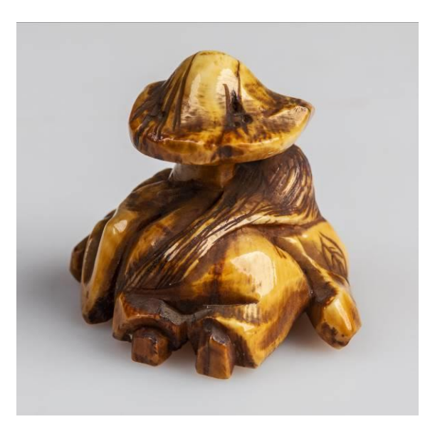
27/ Object 32.275, from the back