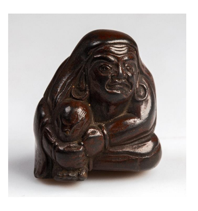
3/ Object 11.556, from the front