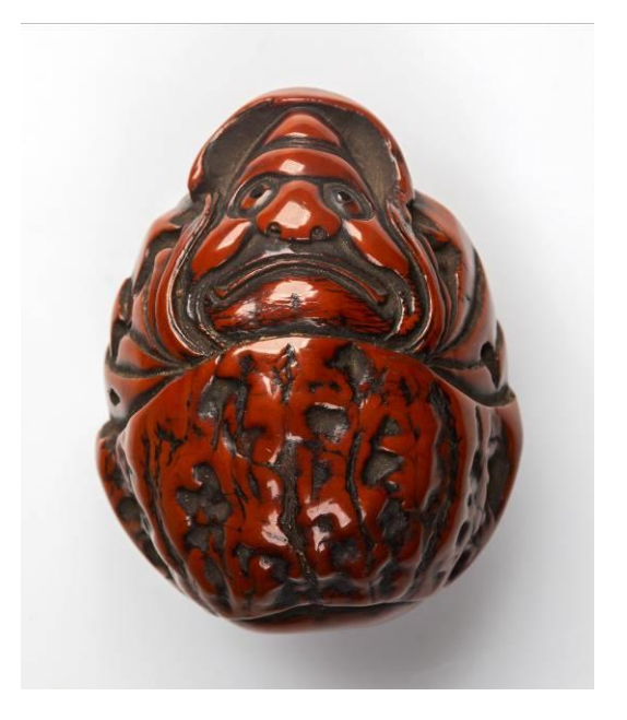
32/ Object 32.284, from the front