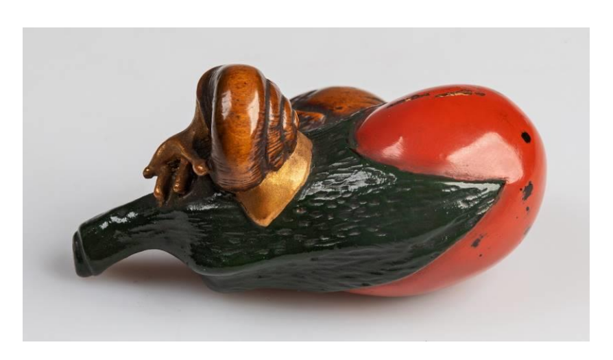
14/ Object 32.255, from the back