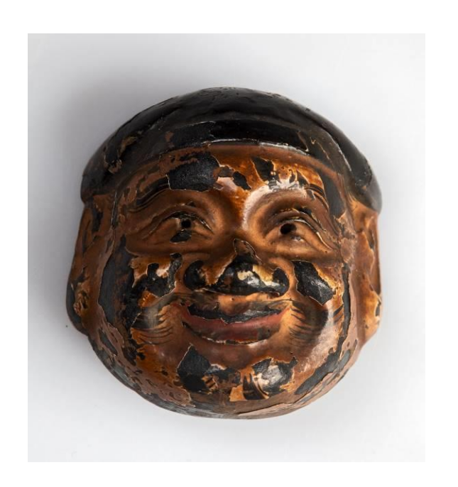
47/ Object 32.320, from the front