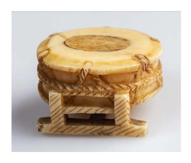
29/ Object 32.276, from the side