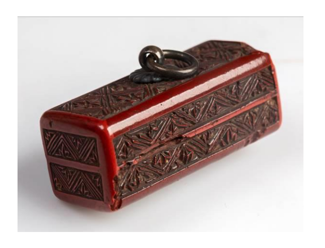
24/ Object 32.271, from the top