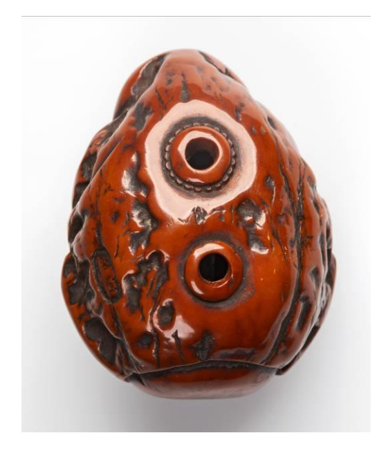
33/ Object 32.284, from the back