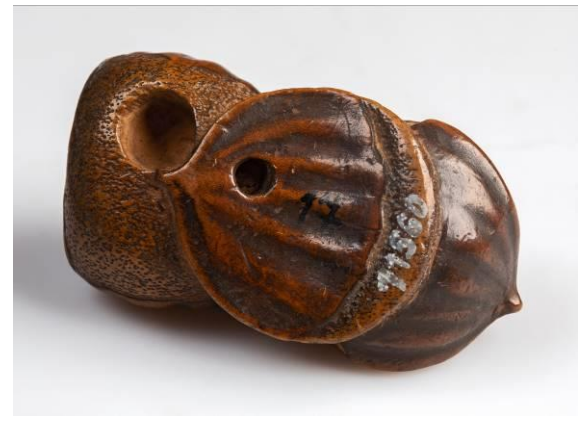
8/ Object 11.560, from the back