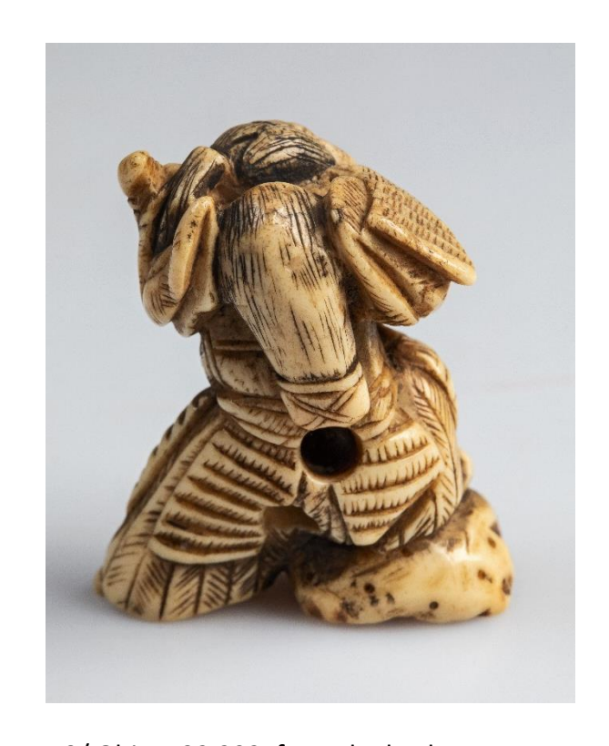
40/ Object 32.292, from the back