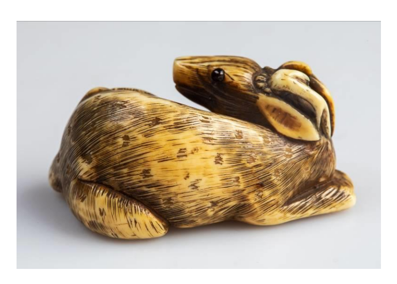
18/ Object 32.257, from the back