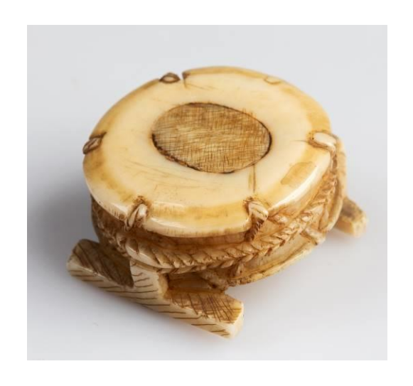
28/ Object 32.276, from the top