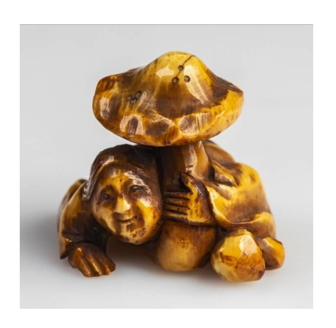
26/ Object 32.275, from the front