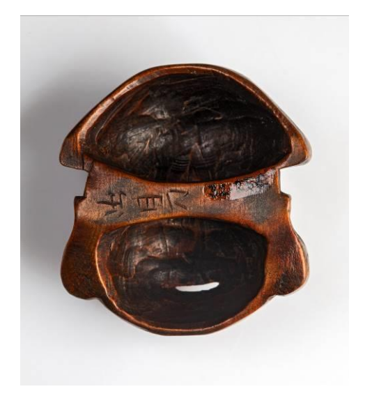
16/ Object 32.256, from the back