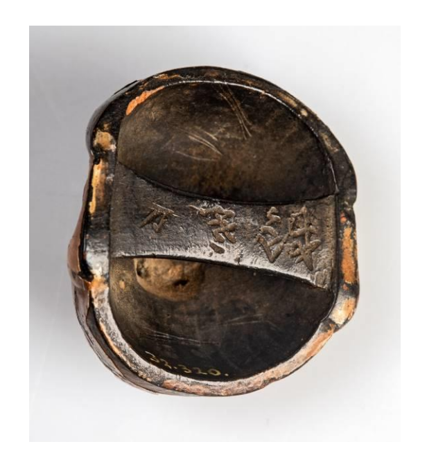
48/ Object 32.320 from the back