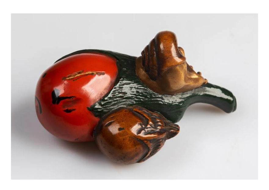
13/ Object 32.255, from the front