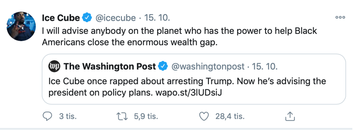
Screenshot 8: Ice Cube's post on Twitter about consulting the Trump administration<sup>340</sup>

Ice Cube, who wanted to "Arrest the President" in 2018, became criticized for meeting with the Trump administration to discuss the Platinum Plan, which is a short document, which includes "efforts to bolster Black economic prosperity."<sup>339</sup> In response to the vast criticism, Ice Cube tweeted: