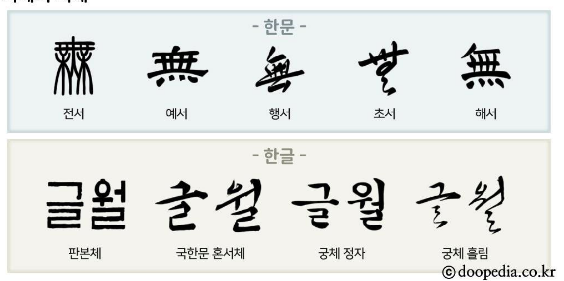
Figure 1: An example of calligraphy styles