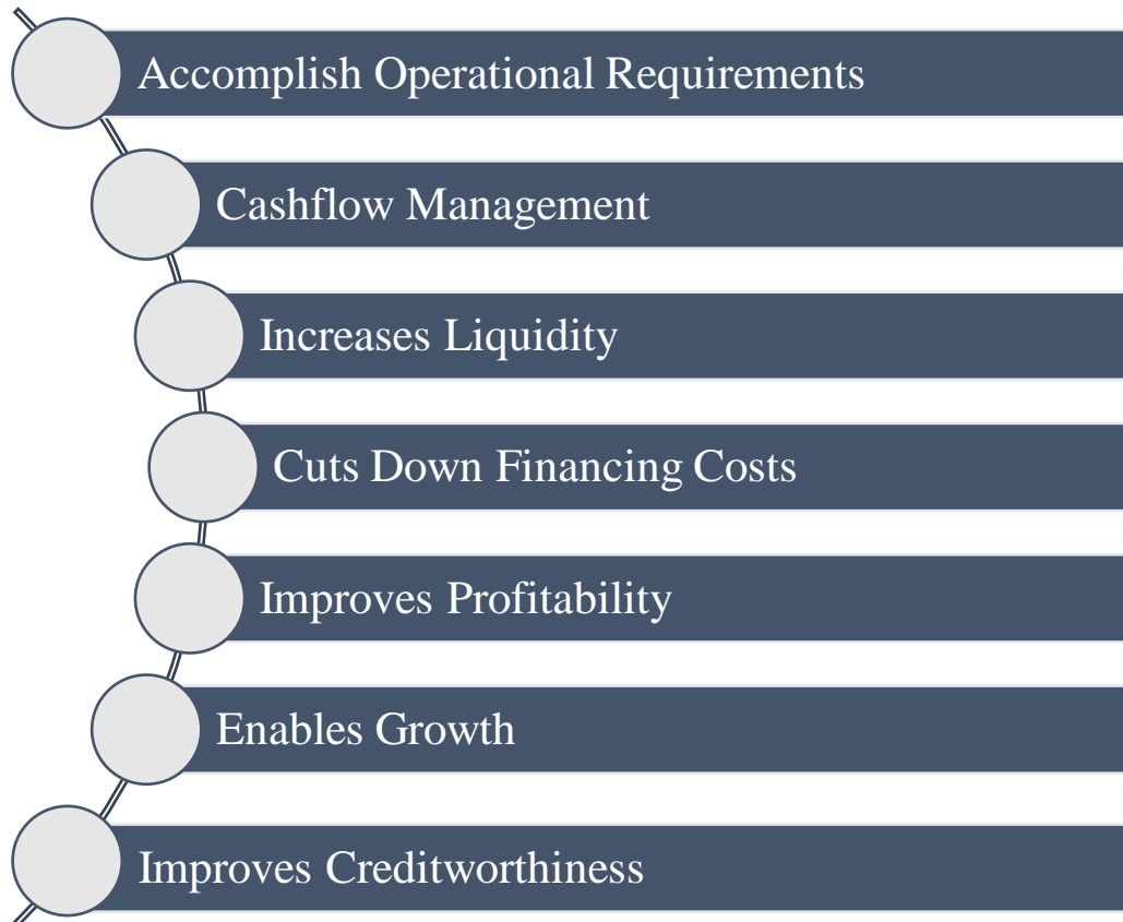
Figure 3-1 Importance of Working Capital Management

efficient handling of working capital is essential. The following points out the importance of working capital management in the organisation: