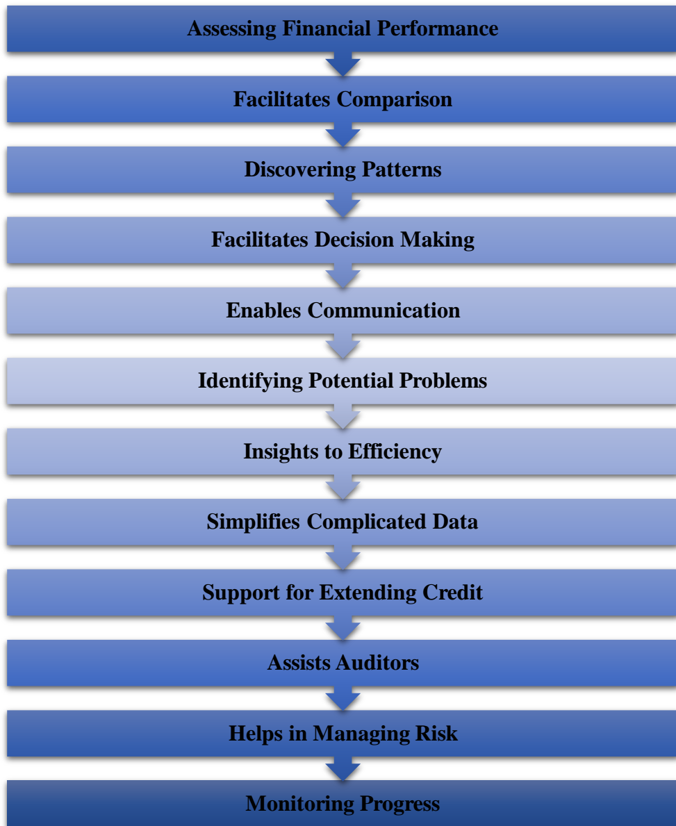
Figure 3-3 Advanatages of Ratio Analysis