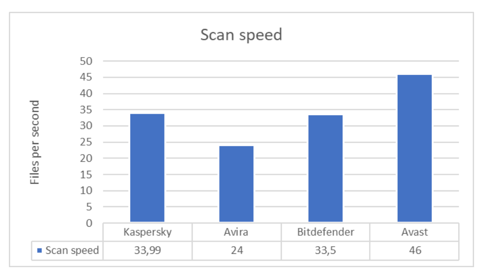
pic. 6 - Scan speed

results of 24 files scanned in one second. The results of all antiviruses can be seen in the picture under the number 6.