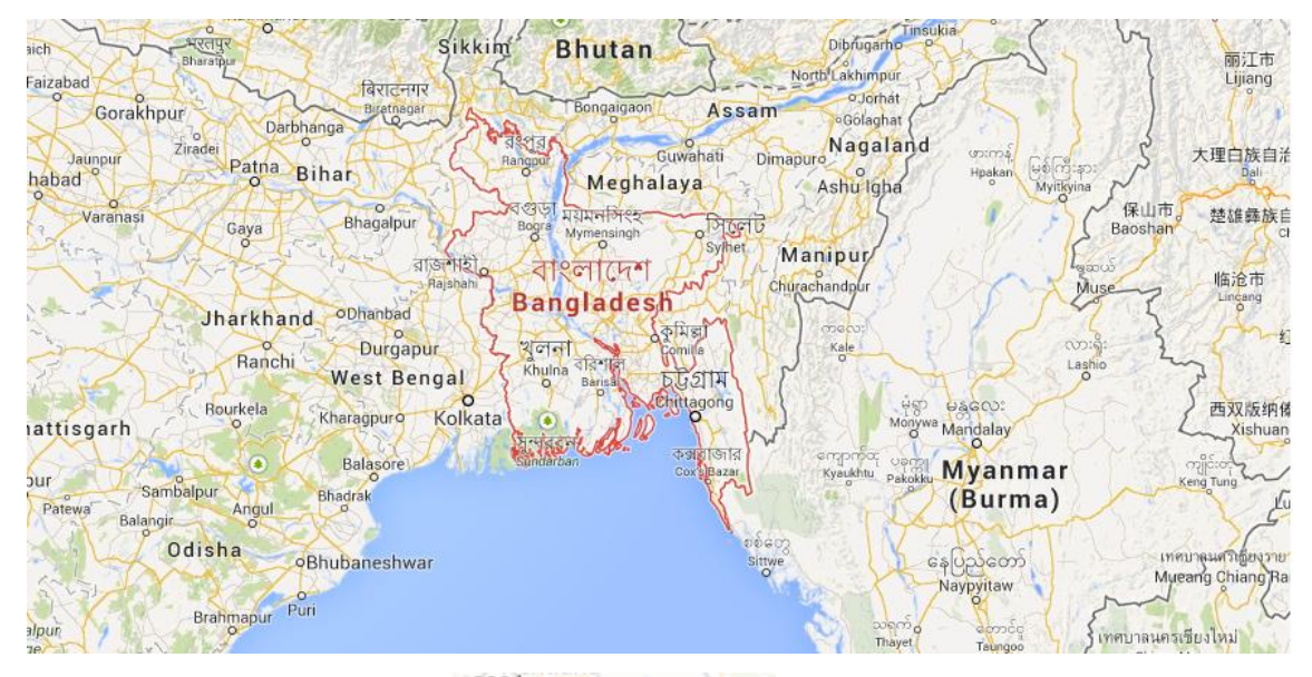
Figure 3 - Map of Bangladesh 200 km

According to latest survey report in 2013 Bangladeshi's total adult literacy rate is 59,82 %. According to National News Agency of Bangladesh literacy rate is improving under present government. Yet such high illiteracy of 40,18 % is still incomparable with the rest of the developed world. Primary and Mass Education Minister Dr. Md. Afsarul Amin is trying to follow his aim to build an illiteracy-free country by implementing new educational projects in the time period 2013-2018 (Www1.bssnews.net, 2013).