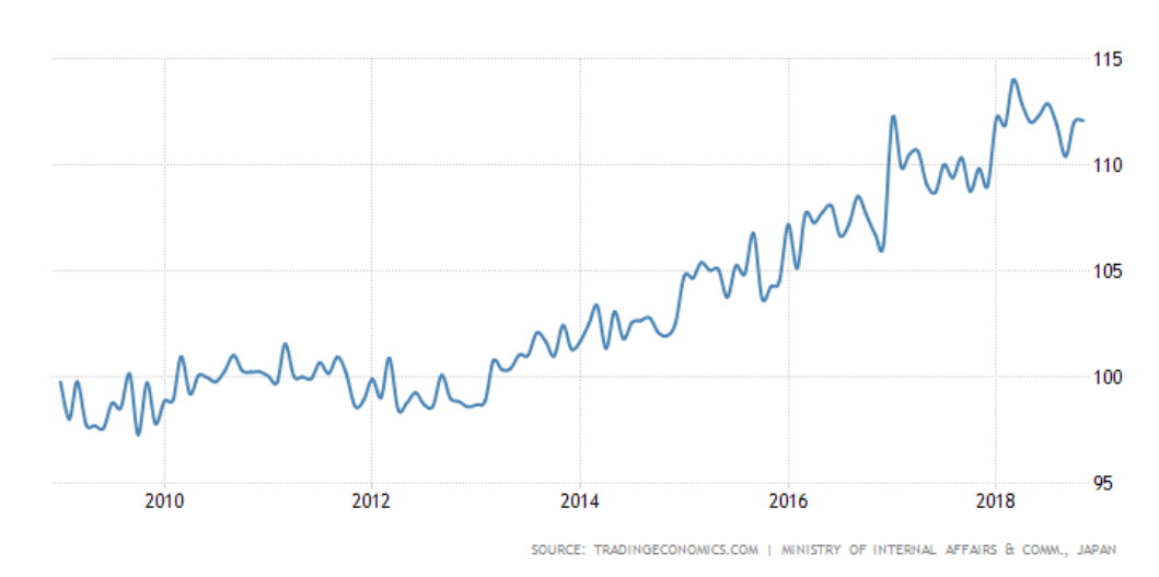
Figure 6 - Japan housing index

As seen on the graph below, one of the biggest issues with increased demand for Japan's accommodation is increase in housing prices. More and more buildings are serving as short-term accommodation for visitors and for normal people it is more and more difficult to be able to afford a reasonable living inside the cities. As Airbnb and other shared economy models continue to rise the prices the government intervention will soon become a necessity.