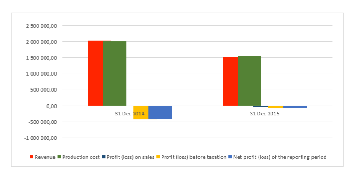
Figure 4 - Financial Results of Company

Changes in income statement during reporting period, compared to the baseline, are shown in Table 6. Changes in financial and economic activities during reporting period, compared to the baseline, are shown in Table 7.