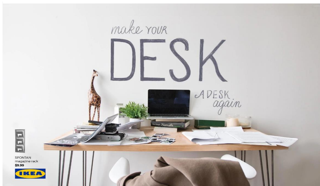
Figure 1 Ikea advertisement

The changes in sub modality should occur depending on the expected effect. Take the example of an advertisement for an IKEA storage system. If you read only these words, you will not pay attention to the advertising text, and only what is underlined will remain in your memory.