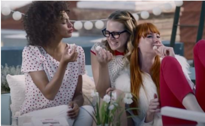
Figure 2 Raffaello advertisement

you show the girls happily eating candy and then you show a close-up of the product being advertised (Raffaello candy).