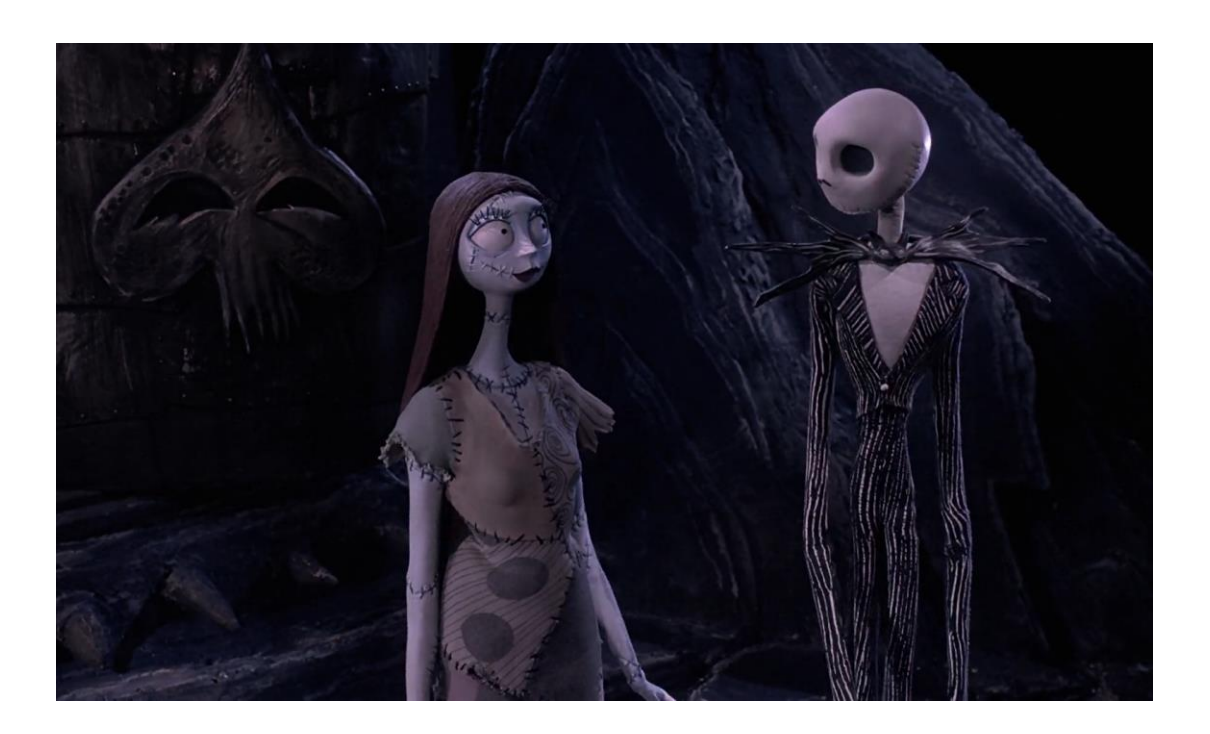
Figure 3. Sally and Jack smiling at each other