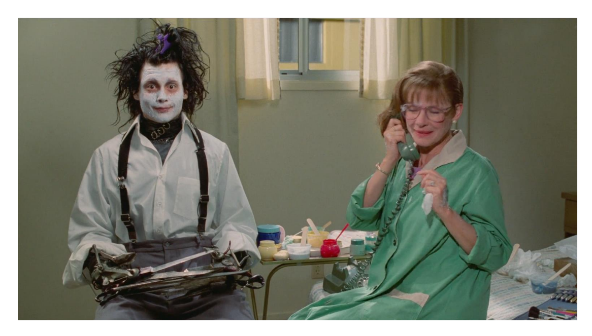
Figure 2. Edwards's grotesque smile with a face mask

Edward Scissorhands, directed by Tim Burton (Twentieth Century Fox, 2015), 00:52:00, Screenshot.