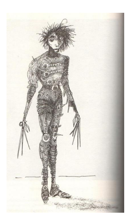
Figure 1. Burton's teenage drawing of a boy with scissors for hands

The first analysed film, Edward Scissorhands , presents the monster as an unfinished humanoid named Edward. He is created by an older man, the nameless creator, who lives alone in his gothic castle up the hill. Therefore, the monster here becomes a protagonist of supernatural origin. The creation starts with a heart-shaped cookie, indicating Edwards's naturally sweet character and the creator's desire for a friend. The creator teaches Edward the basics of decent behaviour, and the entertainment of poetry and encourages him to smile. Nonetheless, he dies before he can finish him, and Edward stays alone with scissors instead of hands. Burton (2006) explains that the idea of a boy with scissor hands came from his teenage drawing (Image 1), which expresses the feeling of wanting to touch but being unable to, to be both creative and destructive, and the inability to communicate (87).