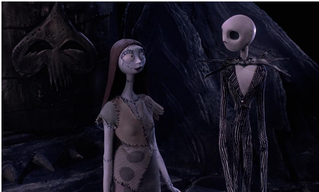
Figure 3. Sally and Jack smiling at each other

Even though Sally is often sorrowful and worried, almost always when she sees, hears or thinks about Jack, she smiles with love (Figure 3). The only time Jack does not make her smile is when she is worried about him. Apart from her in-love smile, Sally shows mischievous happiness when she is about to or already does fool someone with her intelligence, for example, when she manages to poison Dr Finklestein so that she can escape after Jack (Selick 1993, 00:18:25). The mouth scars make it look like a smile from ear to ear. Sometimes, she even shows her teeth when smiling, but they are straight and white, so the smile does not look monstrous but human-like and friendly.