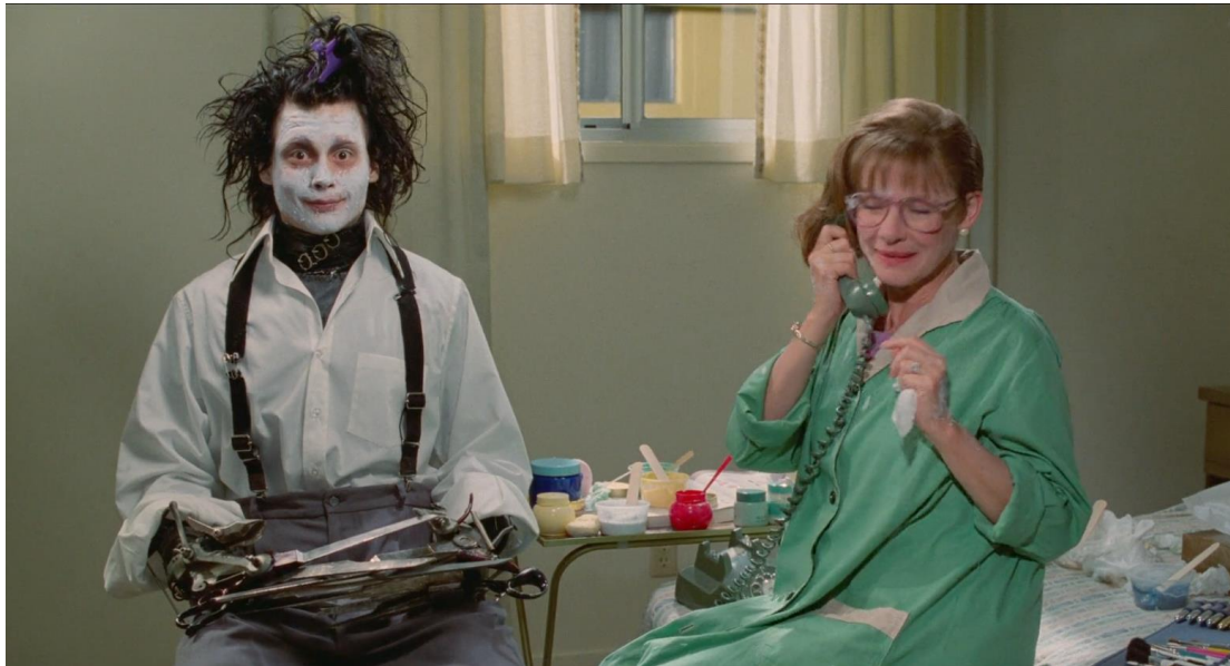
Figure 2. Edwards's grotesque smile with a face mask

Edward Scissorhands , directed by Tim Burton (Twentieth Century Fox, 2015), 00:52:00, Screenshot.