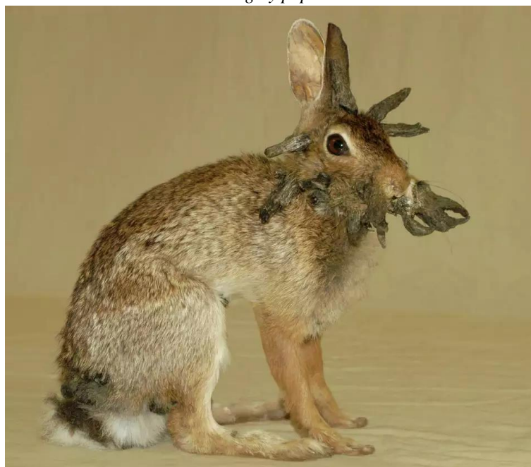
Picture 1 Warts causing by papillomavirus on rabbit

Available from https://www.sfchronicle.com/opinion/openforum/article/What-HPV-ridden-rabbits-can-teach-us-about-16833717.php