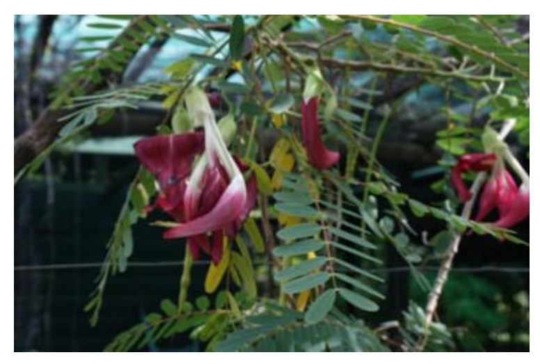
Figure 3. Close view of flower and leaf of S. grandiflora

It is an important source of firewood, feed, pulp, paper, food, medicine, green fertilizers, shade tree. S. grandiflora can be used for the restoration of eroded grassland and forest lands throughout the tropical region (Lim 2014a; Limon et al. 2016). The tree is often used as a light shade tree for companion plants, such as turmeric and ginger, and as a living support tree for climbing plants. As a Fabaceae family member, it also contributes to soil fertility with its nitrogen-fixing bacteria (Withington et al. 1988; Islam et al. 2008).