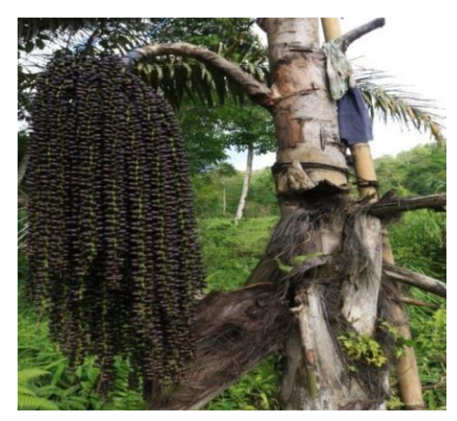
Figure 1. Male flower of A. pinnata

According to the Plant Resources of South East Asia (2022), sugar palm is a moderate to tall unbranched solitary palm. Trunk 10-20 m long and 30-65 cm in diameter. Inflorescence usually unisexual, pendulous, often more than 2 m long, peduncle breaking up into several flower-bearing spikes (as in Figure 1). Roots black, strong, extending far (up to 10 m and more) from the stem and going as deep as 3 m.