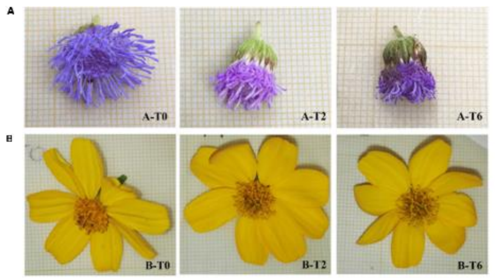
Figure 8. Visual appearance of EF in cold temperature storage

Visual changes in flower storage at low temperatures cause weight reduction (Marchioni et al. 2020). According to the findings of Marchioni et al. (2020), the weight reduction after 6 days (T6) at 4 °C was 15.7 % for Ageratum houstonianum (A), which also showed negative results with a clear browning. For Tagetes lemmonii (B), the weight reduction after 6 days is 9.5 % (illustrated in Figure 8). In T. lemoni loss of some petals can be observed, but differences in storage time of 2 (T2) and 6 (T6) days in this species are not very noticeable. In summary, different temperatures can improve the quality and appearance of different types of EF, and by reducing storage temperature, increase the shelf life of some types.