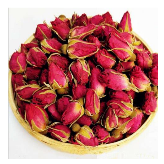
Figure 6. Visual appearance of rose after microwave drying

A different study conducted by Safeena & Patil (2014) investigated the application of silica gel on the flower prior to the drying procedure. The study compared sensory values of Rose flowers with and without the embedding of silica gel. The results have shown that superior quality parameters such as colour, texture and appearance were obtained when the flowers were dried and embedded into the silica gel for 2.5 minutes. Although the application of the silica gel had positive effects on all flower samples examined, its effects also varied depending on the variety of the rose in the test (Safeena & Patil 2014).