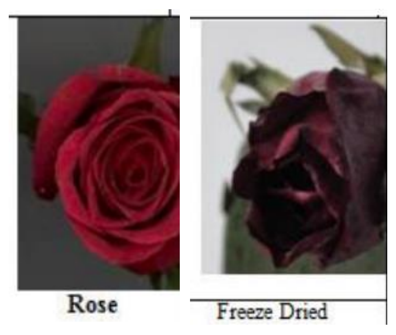
Figure 7. Visual appearance of rose after freeze drying

Although the initial investment and operational costs are high, many advantages can be repaid by the high costs of freeze drying, such as quality, storage costs, transportation, and shelf life of flowers (Zhao et al. 2019).