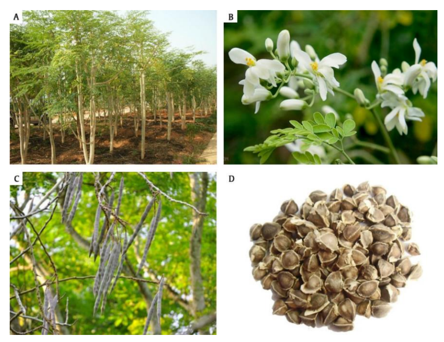
Figure 2. Whole plant, flowers, pods, and dried fruits of M. oleifera

The flowers have a variety of nutrients like proteins, potassium, calcium antioxidants, and polyunsaturated fatty acids (Liu et al. 2018). Therefore, the consumption of the flowers contributes to a well-balanced diet (Kumar et al. 2017). The flowers are mostly consumed raw as a vegetable or are cooked to be incorporated in various recipes (Islam et al. 2021). The powder made from the dried flowers is also frequently added to porridges to enhance their nutritive values. Powder derived from flowers is also more suitable than the powder from leaves, as the flower powder maintains the original colour and appearance of the dish (Liu et al. 2018).