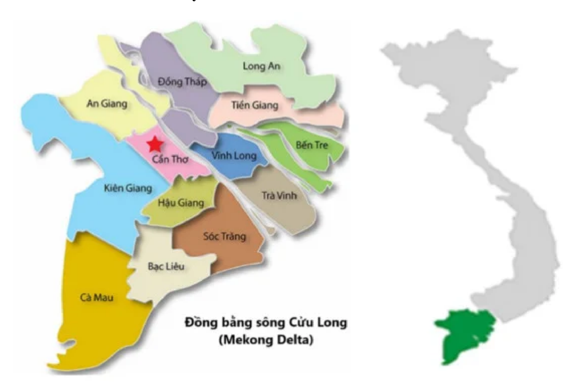
Fig 4. Can Tho's Map. Source (129)