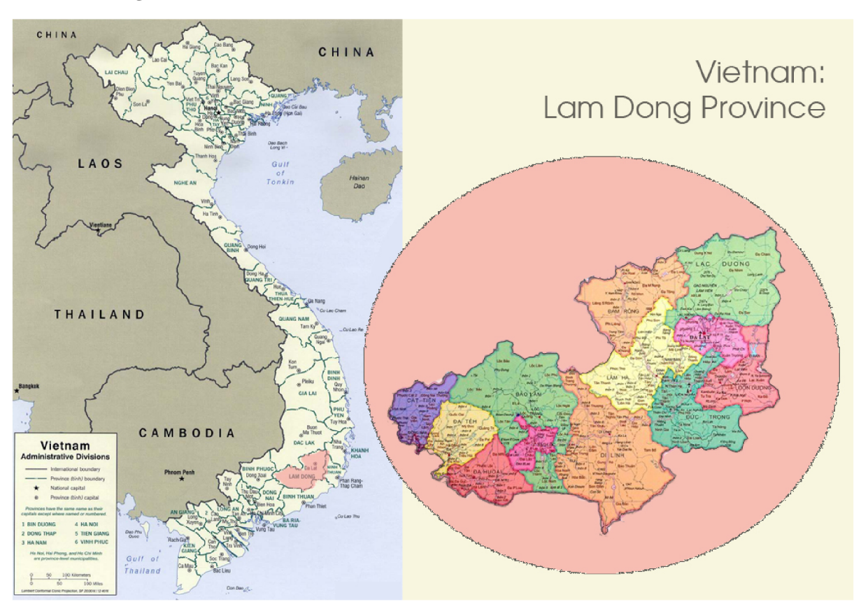
Fig 3. Lam Dong's Map.

Lam Dong is a mountainous province in the South Central Highland of Vietnam. Its altitude ranges from 800 m to 1,500 m above sea level with the geographical area of 9,773.54km², as the nation's 7th biggest province (116). The province has pleasant weather that remains cool throughout the year, combined with natural scenic landscapes; which makes it a perfect destination for holidays and vacations. Lang Biang, the 9th World Biosphere Reserve in Viet Nam which is located in the north of the province, is an example of biodiversity and natural resources (117) that the area holds. In addition, Lam Dong is rich in culture with 43 ethnicities and a diverse range of customs, practices and celebrations (116).