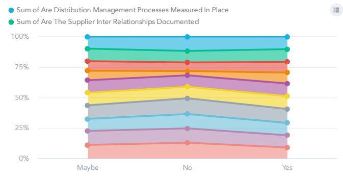
Does using BI tools help with SCM productivity?