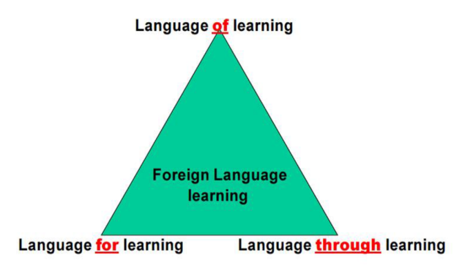
Figure 2. The language triptych. Adapted from Coyle et al. (2010, p. 69).

According to Pozo (2016), the language triptych (Figure 2) is a key concept of the CLIL approach, and its use is necessary for communication, which is one of the 4Cs. The language required in CLIL does not necessarily correspond to the grammatical progress that is usually observed in the context of language learning. The fact that a language can be learned as naturally as a native one is a great advantage. The language triptych allows linking content and language objectives. In this way, it is possible to integrate cognitively complex content with language learning and using, as well as give meaning to the relationship between the use of language and the construction of knowledge.