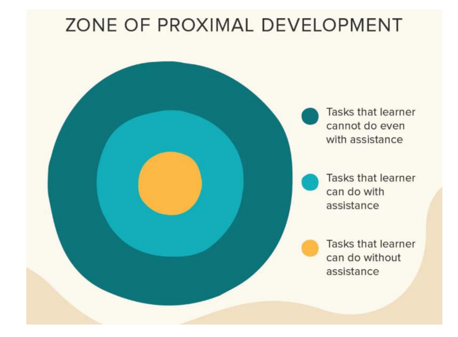
Figure 3. Zone of proximal development.

Vygotsky (1987) describes the zone of proximal development (ZPD) as the range of abilities a person can perform with help but cannot yet perform independently. Figure 3 demonstrates the tasks that the learner can and cannot do in greater detail. These skills are called "proximal" because a person is close to mastering them but needs practical guidance to be able to perform these actions without counselling.