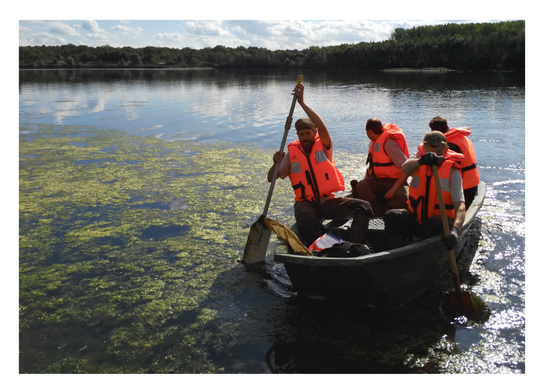
Figure 9: picture of the South basin during the summer

Every year during the summer, we can observe that algaes occupy approximately 50% of basins (Document d'objectif natura 2000, 2015) (Fig. 9).