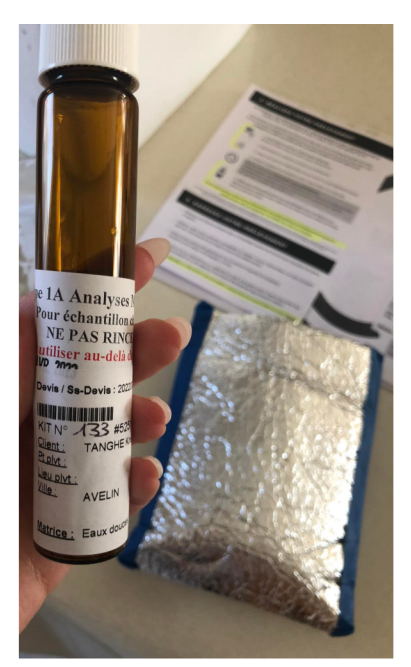
Figures 4 and 5 : sample material for pesticide analysis