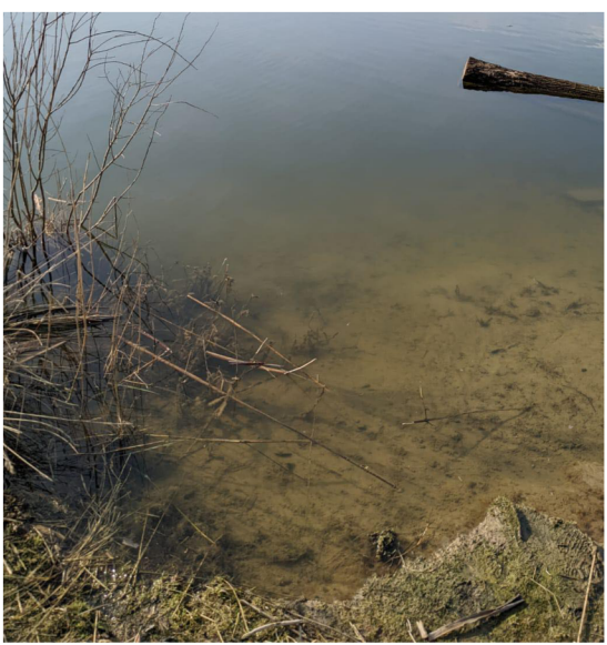
Figures 7 and 8: pictures of the East basin

Every year during the summer, we can observe that algaes occupy approximately 50% of basins (Document d'objectif natura 2000, 2015) (Fig. 9).