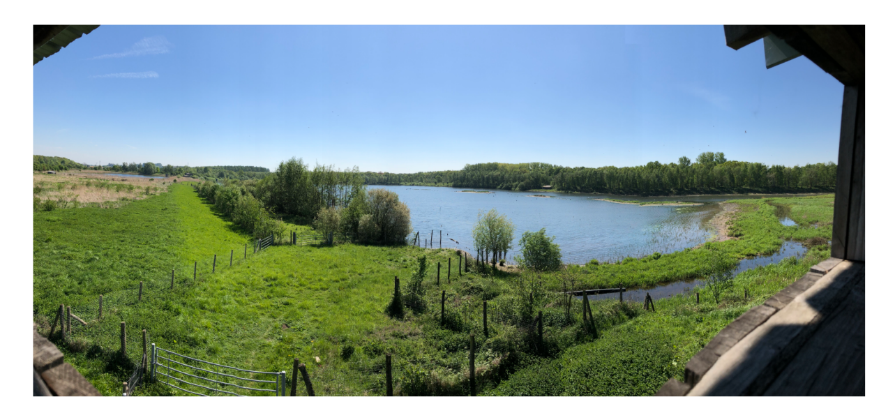
Figure 1: view of the South basin of the "Cinq Tailles" (taken in August during the Ornithological inventory), photo: author

Today, this area is composed of around 75 hectares of forest and 30 hectares of wetlands including ponds and reed beds.