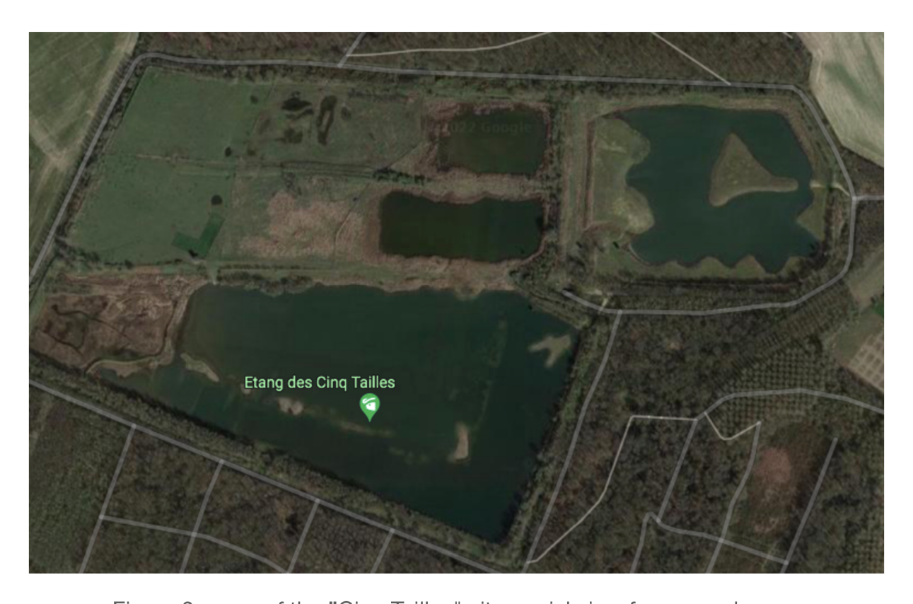
Figure 3: map of the "Cinq Tailles" site, aerial view from google map

The protected area of "Les Cinq Tailles" - FR3112002 belongs to the North Department of France. The biggest part of 105 ha has been acquired on 6 June 2001, then the two basins in the North-East were acquired in 2007. The total size of the site is 123 ha (Document d'objectif natura 2000, 2015).