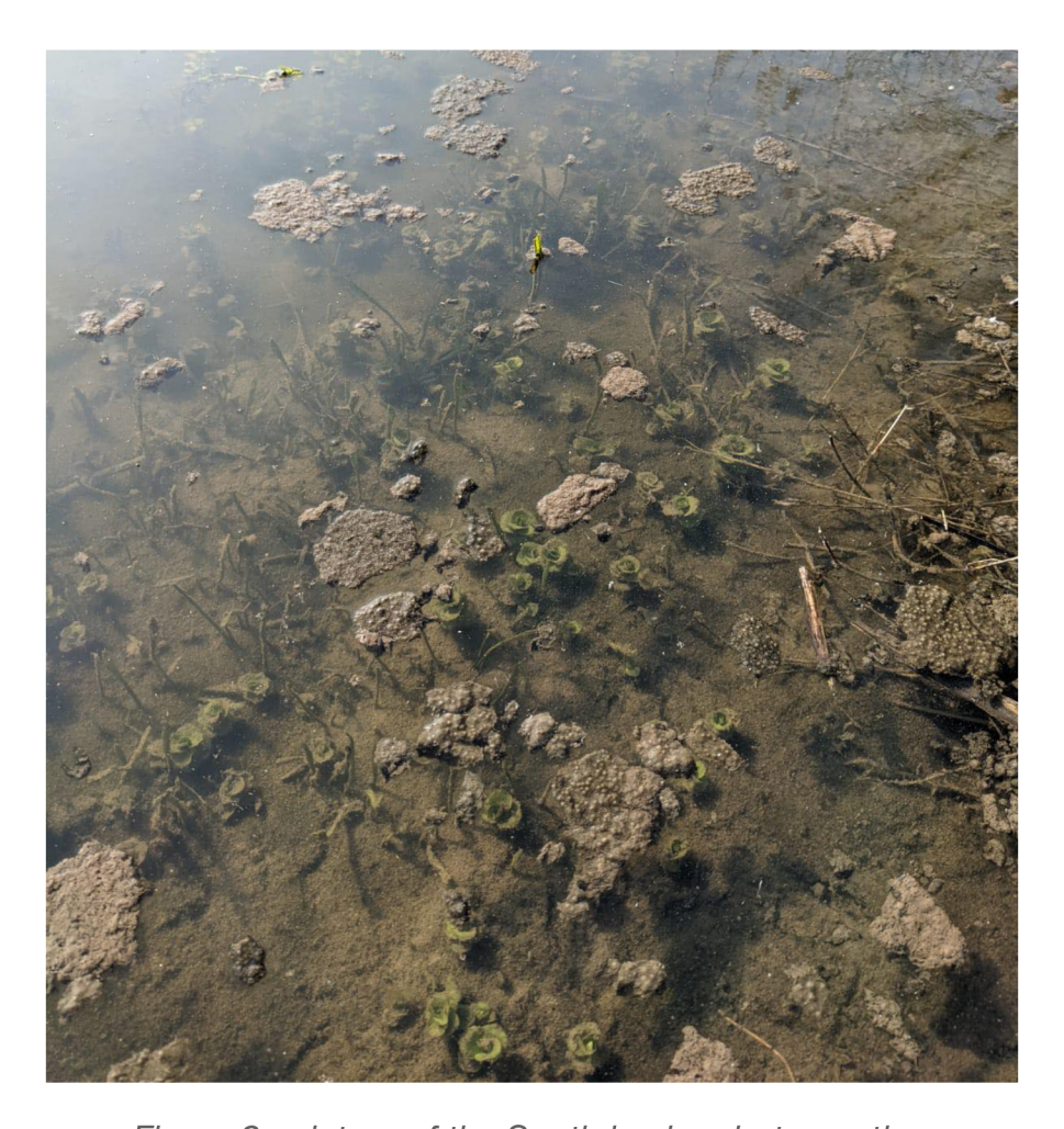
Figure 6: picture of the South basin, photo: author