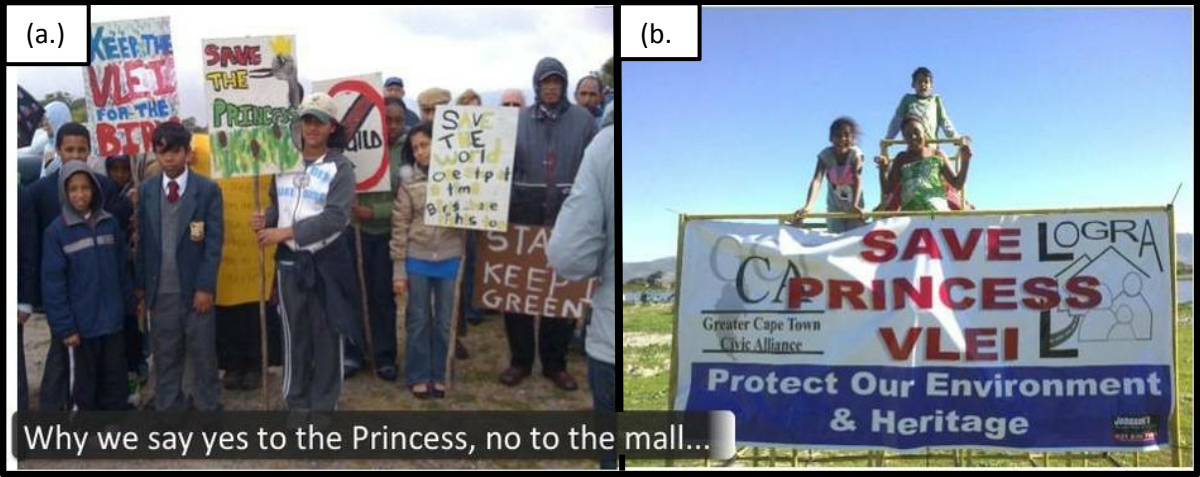
Figure 4.2: Examples of: (a.) public protest using posters to save Princess Vlei, (b.) the use of banners to promote protest by civil organization (<a href="http://princessylei.withtank.com">http://princessylei.withtank.com</a>)