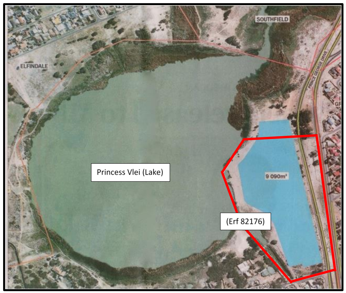
Figure 4.1: Visual image of Princess Vlei and the proposed mall development locale (Erf 82176) (www.princessvlei.org)