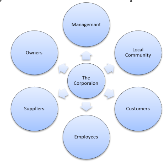
Figure 1 A Stakeholder Model of the Corporation

To consider the stakeholders of a decision, it is critical to be able to understand the interests of each party, to be able to evaluate empathetically what the potential impact on that stakeholder will be and what the stakeholder's perspective on the decision is likely to be. This is not as easy as it may first appear.