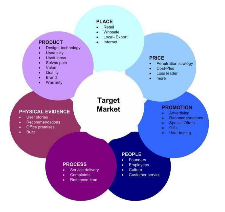
Figure 2 Three additional Ps by Bitner, J. and Booms, B.

As market of goods and services became more and more developed, there was a need to create new elements of the marketing mix. Marketing of services is based on the relationship between people. The client acquires an intangible service (sale's advice) and in the case of customers dissatisfaction there is no way to return it. In 1981 while Bitner, J. and Booms, B. have been developing the concept of marketing in the service sector, they proposed to complement the marketing mix with three additional "P": people, process and physical evidence of the fact of service.<sup>7</sup>