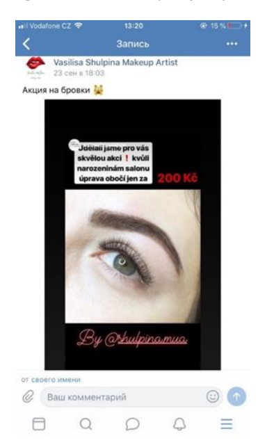
Figure 6 Promotional post for eyebrow correction published on Vkontakte (wall).

320 people have viewed the promotional post in a Story;10 actions (appointments) received from this Story.