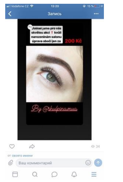
Figure 7 Statistical information provided by Vkontakte for the promotional post for eyebrow correction

Translation of the promotional message: We have prepared a special offer for you! Due to the Birth Day of the salon we offer eyebrow correction for the price of 200 czk only.