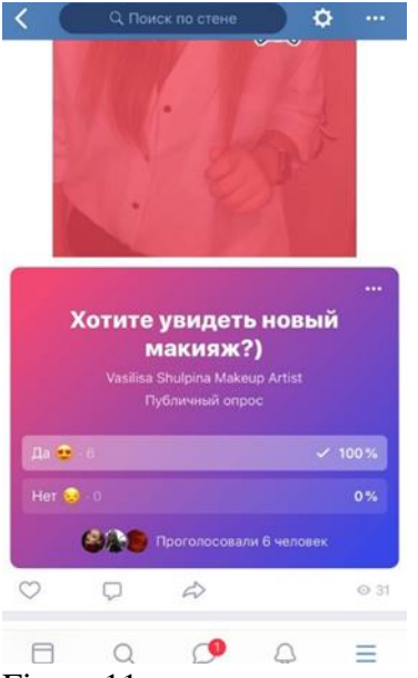
Figure 11 Statistical Information provided by Vkontakte for the engagement survey

Translation of the engagement survey: Do you want to see our new make-up? Votes options: yes, no.