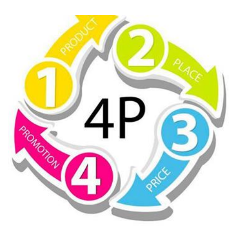
Figure 1 4Ps by E.Jerome McCarthy.

Later, E. Jerome McCarthy proposed a classification of marketing tools and a classification in four areas: product, price, location and promotion. 4 P^4 is used as an abbreviation for these four areas.