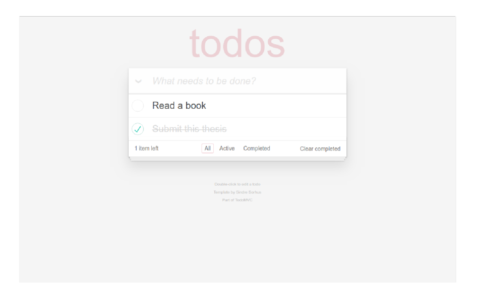
Figure 7.1: The TodoMVC application

The top-level interpreter of the monad is also included. As we can see, we unwrap the AppT from the outside, starting from the newtype wrapper, running the router, and running the storage last. The router is not interpreted with the default interpreter that uses the Location API as, according to the specification, we need to route using the hash fragment only (the part after # in e.g. the !/active in http://localhost/#!/active). The storage needs to be persisted from and to LocalStorage, so we do not use the simple in-memory interpreter, but runLocalStorageT instead.