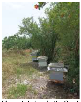
Figure 6 Apiary in the Oued Seybouse forest locality (Husarčík 2023)

Commune located closest to Guelma city, stands out as a highly favourable beekeeping location. This region, with its expansive meadows devoid of terrain