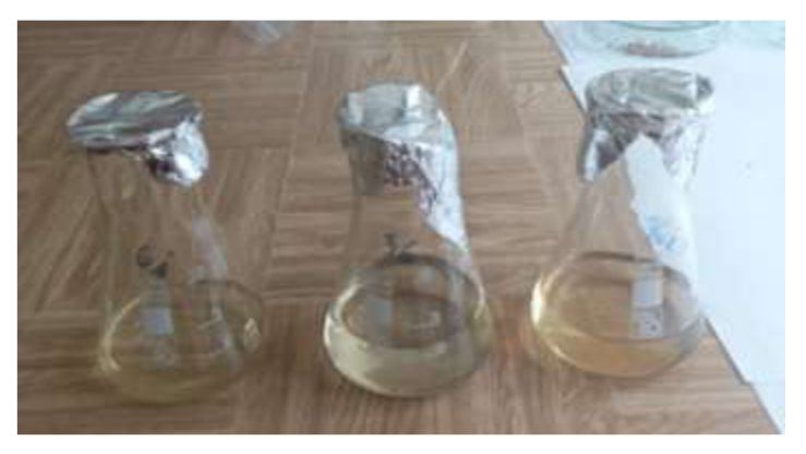
Figure 13 Preparation of the honey samples for analyses (Husarčík 2023)

Acidity pH and Free Acids Content: In a 250 cm<sup>3</sup> Erlenmeyer flask, 10 g of honey were dissolved in 75 cm<sup>3</sup> of distilled water to create a honey solution for the analysis. Using a pH meter, the solution's pH was calculated potentiometrically (HI 111). The samples' free acid content was determined through titration using a 0.1 mol/dm<sup>3</sup> sodium hydroxide (NaOH) solution. Then, three to four drops of an acid-base indicator (phenolphthalein) were added. The honey solutions were titrated with 0.1