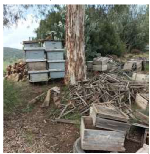
Figure 4 Apiary in the Ben Djeraah (Husarčík 2023)

Ben Djeraah is a municipality with a highly uneven and mostly hilly terrain, which has an impact on the bee colonies in the area. Numerous difficulties for beekeeping arise from the hilly terrain, including limited sources of forage (Holzschuh et al. 2007). The diverse terrain variations in this region have an impact on the