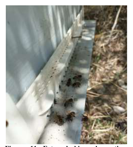
Figure 11 External hive observations (Husarčík 2023)

The sampling activity also contained external and internal hive observations. During external observations internal parts and components of the hive are not opened, disturbed or reorganised – the internal balance of a colony in the hive is undisruptive