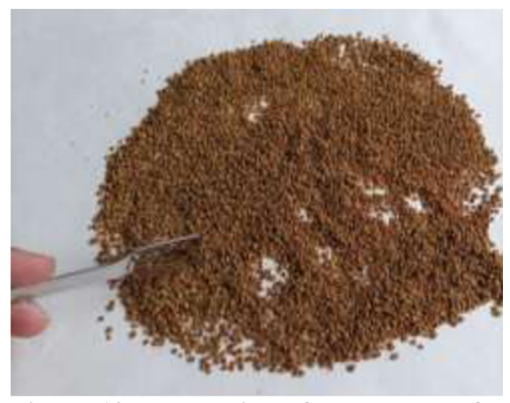
Figure 12 Preparation of the samples for palynological analyses (Husarčík 2023)

Palynological analysis was primarily conducted in the Bouchegouf district of the Guelma province, which proved to be the most beneficial area for sampling.