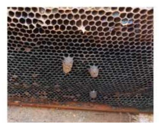
Figure 2 Capped queen cells (Husarčík 2023)

Queen cells are specialized structures within the hive that play an important role in the reproduction and maintenance of bee colonies (Mattiello et al. 2022). These cells, which are classified into three types: swarm cells, supersedure cells, and emergency cells, represent distinct stages in the colony's reproductive cycle and are influenced by a