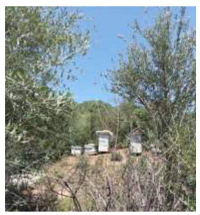
Figure 10 Apiary at the Chetaibi hills location (Husarčík 2023)

The last sampled district, Chetaibi, is situated in the coastal zone in the northern part of Algeria, characterized by a mild climate with relatively high humidity and rainfall ranging between 550 mm to 700 mm, showing a tendency to increase towards the east direction. A significant climatic influence in this region is the sirocco, a wind blowing from the south of the Sahara desert (Hallouz et al. 2023). The average temperature in the area is 18.5°C (Zeroual et al. 2017), with a warming trend of 0.2–0.4°C per decade reported