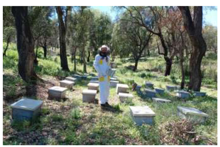
\begin{tabular}{lll} Figure 9 Apiary in the Bouchegouf - farm locality (Asma \\ Maklouf 2023) \end{tabular}