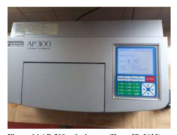
Figure 14 AP-300 polarimeter (Husarčík 2023)

Sucrose content and optical rotation: Two 50 cm<sup>3</sup> portions were taken from a 100 cm<sup>3</sup> 20% honey solution. One portion underwent sugar inversion, while both were treated with aluminum hydroxide to precipitate impurities. After overnight settling, the