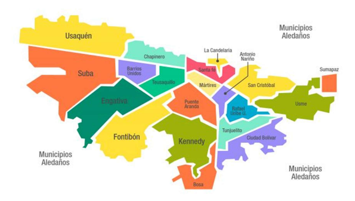
Figure 1: Map of localities of Bogota

Bogota has to face various consequences of the fast urbanization, from the socioeconomic ones to the environmental ones. Besides, as UNFPA (2007) says, poverty and violence in Colombia are two realities that accompany the urbanization process. According to UNHABITAT (2016) Latin American cities, such as Buenos Aires, São Paulo, Bogota, Lima, Rio de Janeiro and Mexico City experience major deficits in basic infrastructure. On the other hand, a different document named State Report of The Cities of Colombia (2015) concludes that the case of Colombia's capital clearly shows the cons and benefits of an agglomeration. Among the benefits are better income, a greater number of employment opportunities, as well as better supply and cultural and recreational diversity. On the other side, there are heavy traffic, pollution and safety problems. But basically, the document says that all the negative externalities are the same as of any large city like Bogota. It also highlighted the mayor's office creative initiative among the urbanization, especially how they have prioritized public spaces in recent years. For example, since 1998, they have launched an effort to increase public spaces by constructing 200 km of bicycle paths and 300 small parks (UNHABITAT, 2016).