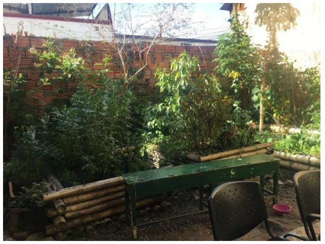
Figure 4: gardens