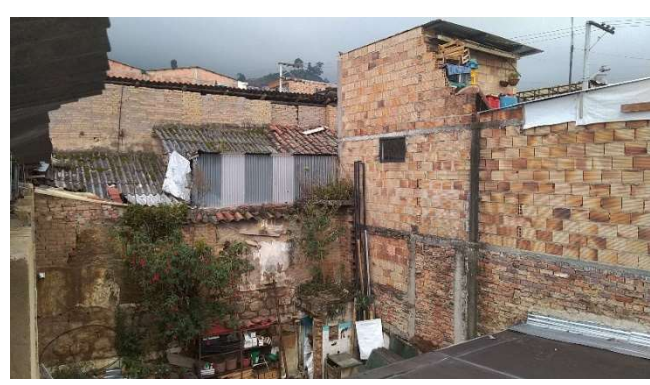
Figure 6: behind the garden