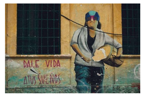
Figure 7: graffity on Casa B

On Saturdays are held so-called Cinehuertas, free cinema in the garden. So far, these are children or commercial movies, the aim is to attract residents of the neighbourhood and then play environmental documents, or films with social issues and bring together the inhabitants. Sometimes discussion is prepared to open up some important actual issues.