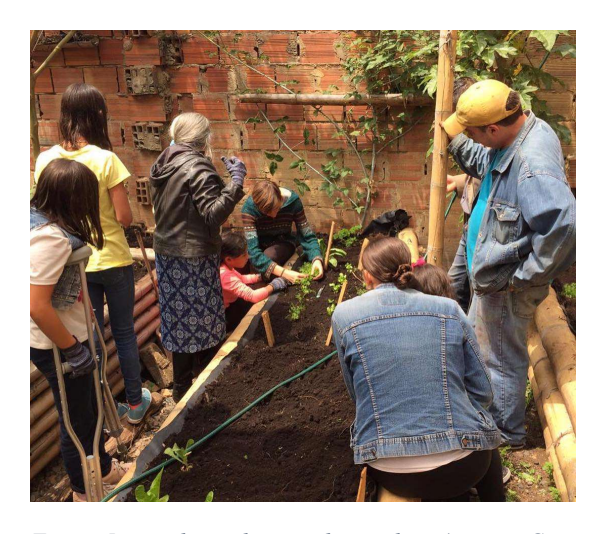
Figure 5: people working in the gardens