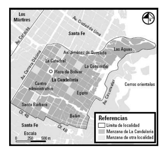
Figure 2: Map of sectors of La Candelaria (Gonzáles, 2011)

Even though it is the most attractive touristic location, it still has numerous urban problems, that are partly connected to the inequality between social groups. Considering that historically it was mainly inhabited by high-income groups which abandoned the area after El Bogotazo in 1948 and its violent consequences (Gonzáles, 2011). Several years later a trend of return of these classes has begun again. As Smith (2013) describes, the dynamic of the relocation of inhabitants, known as gentrification, develops from the implementation of a policy of functional revitalization of the centre of Bogota, headed by the State, with support from the private sector. Aimed at protecting the heritage and habitability of its historical buildings, the implementation of renovation works, the development of real estate projects and the transport systems. However, Dureau and Piron (2009) point out a certain complexity in the social composition, with a decrease of two lower classes, a concentration of low-income household in specific sectors, a permanence of the higher class and a slight growth of the intermediate classes.