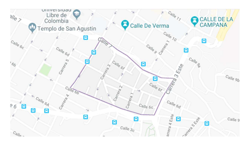
Figure 3: Map of neighbourhood of Belén (google maps, 2020)

at the same time as the historical centre it is not considered as a national monument. But the foundation further explains, in the last 40 years, due to its strategic position, Belén has been affected by the threat of different development and land use plans. Some parts of Belén had to be eliminated to give space to bigger projects. Including macro housing, institutional and commercial projects (Marca Comunidad, undated).