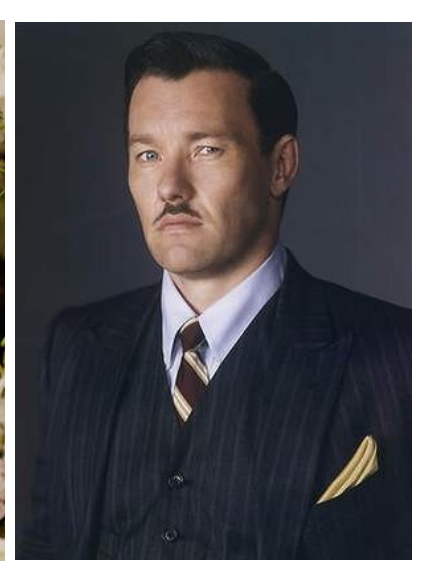
Figure 15: Tom Buchanan