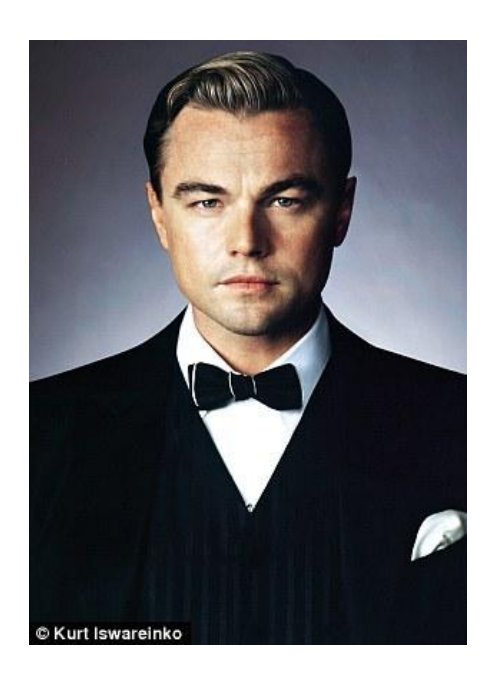
Figure 12: Jay Gatsby