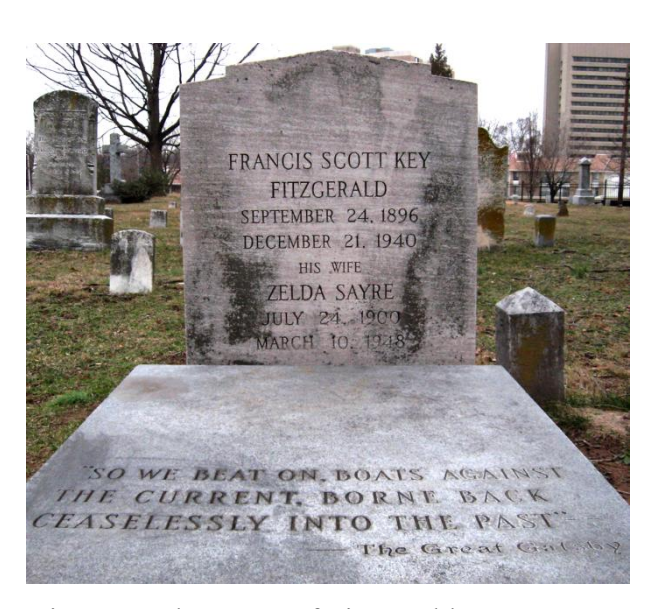
Figure 3: The grave of Fitzgerald's