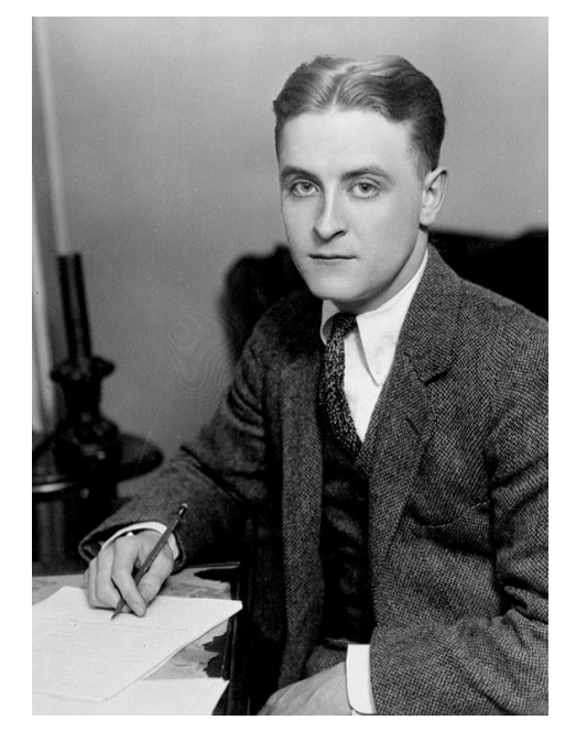
Figure 1: Francis Scott Fitzgerald