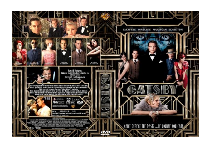
Figure 11: The DVD cover