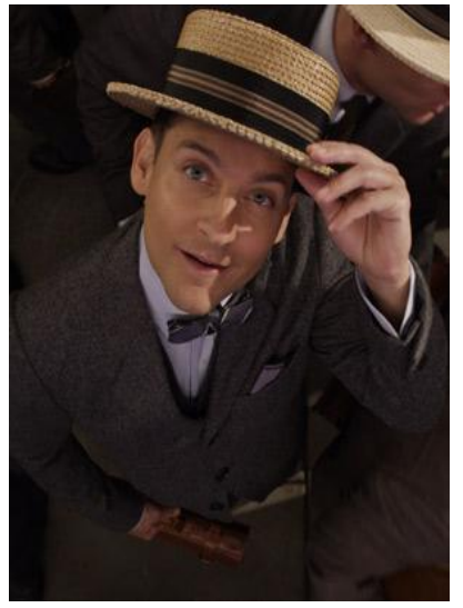
Figure 13: Nick Carraway