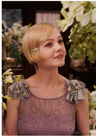
Figure 14: Daisy Buchanan