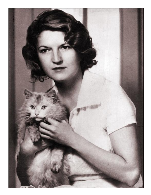
Figure 2: Zelda Fitzgerald