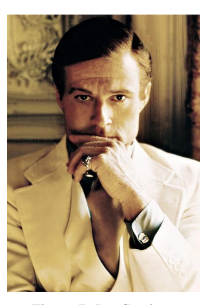
Figure 7: Jay Gatsby