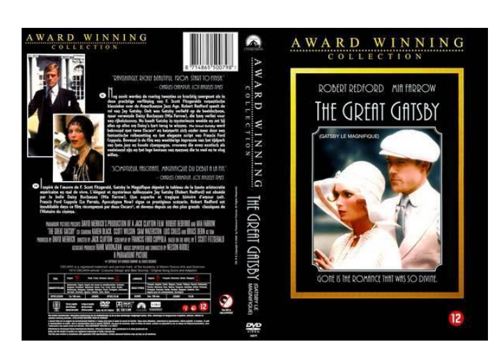
Figure 6: The DVD cover