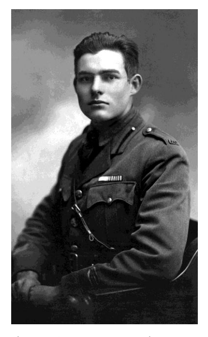
Figure 4: Ernest Hemingway

Figure 1: http://upload.wikimedia.org/wikipedia/commons/5/5c/F Scott Fitzgerald 1921.jpg