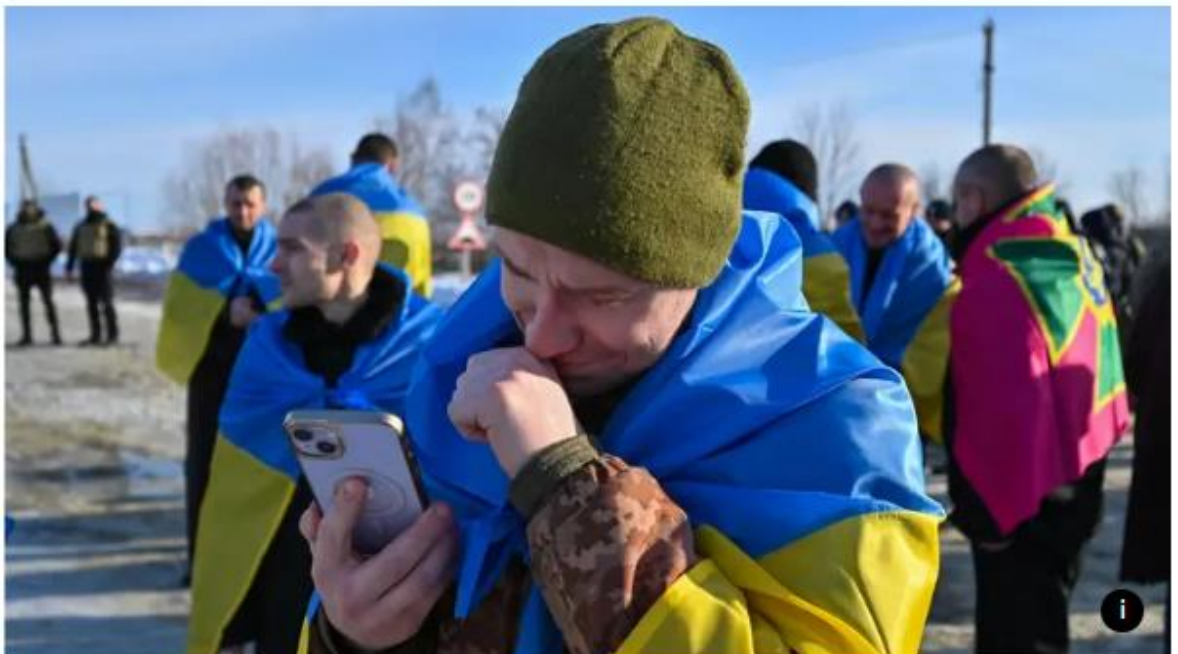
Captured Ukrainian soldiers shortly after their release

Russia and Ukraine exchanged more prisoners of war on Wednesday. While the Russian Ministry of Defense announced the exchange of 195 Russian prisoners for 195 Ukrainian ones, Ukrainian President Volodymyr Zelenskyi announced that 207 Ukrainian men and women had returned. According to earlier reports, the exchange of prisoners was supposed to take place a week ago, but on this day, a Russian Il-76 transport plane, which according to Moscow was transporting Ukrainian prisoners, crashed near Belgorod.