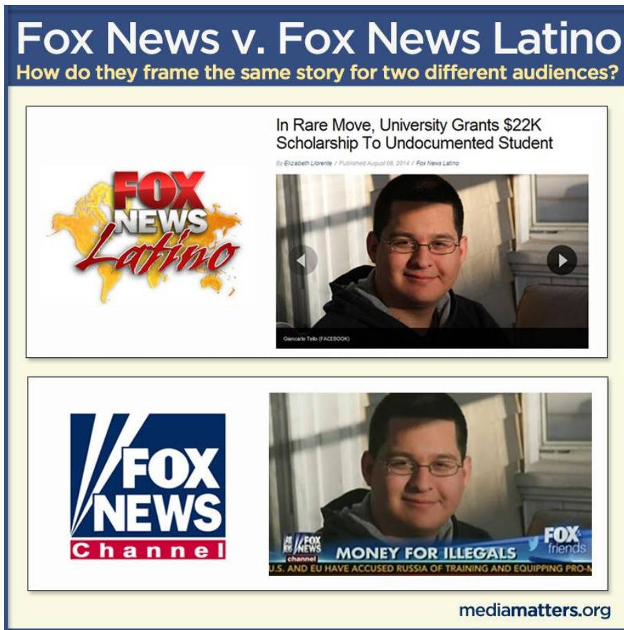
Figure 1: Framing theory, example for two different audiences.