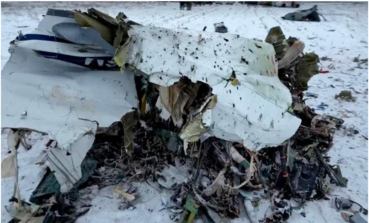
Figure 3: Picture used in Interview 2.

11) Can you please describe the picture? Name at least 4-5 criteria, what do you see?