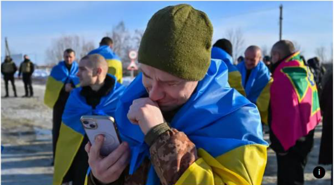
Captured Ukrainian soldiers shortly after their release

Russia and Ukraine exchanged more prisoners of war on Wednesday. While the Russian Ministry of Defense announced the exchange of 195 Russian prisoners for 195 Ukrainian ones, Ukrainian President Volodymyr Zelenskyi announced that 207 Ukrainian men and women had returned. According to earlier reports, the exchange of prisoners was supposed to take place a week ago, but on this day, a Russian Il-76 transport plane, which according to Moscow was transporting Ukrainian prisoners, crashed near Belgorod.