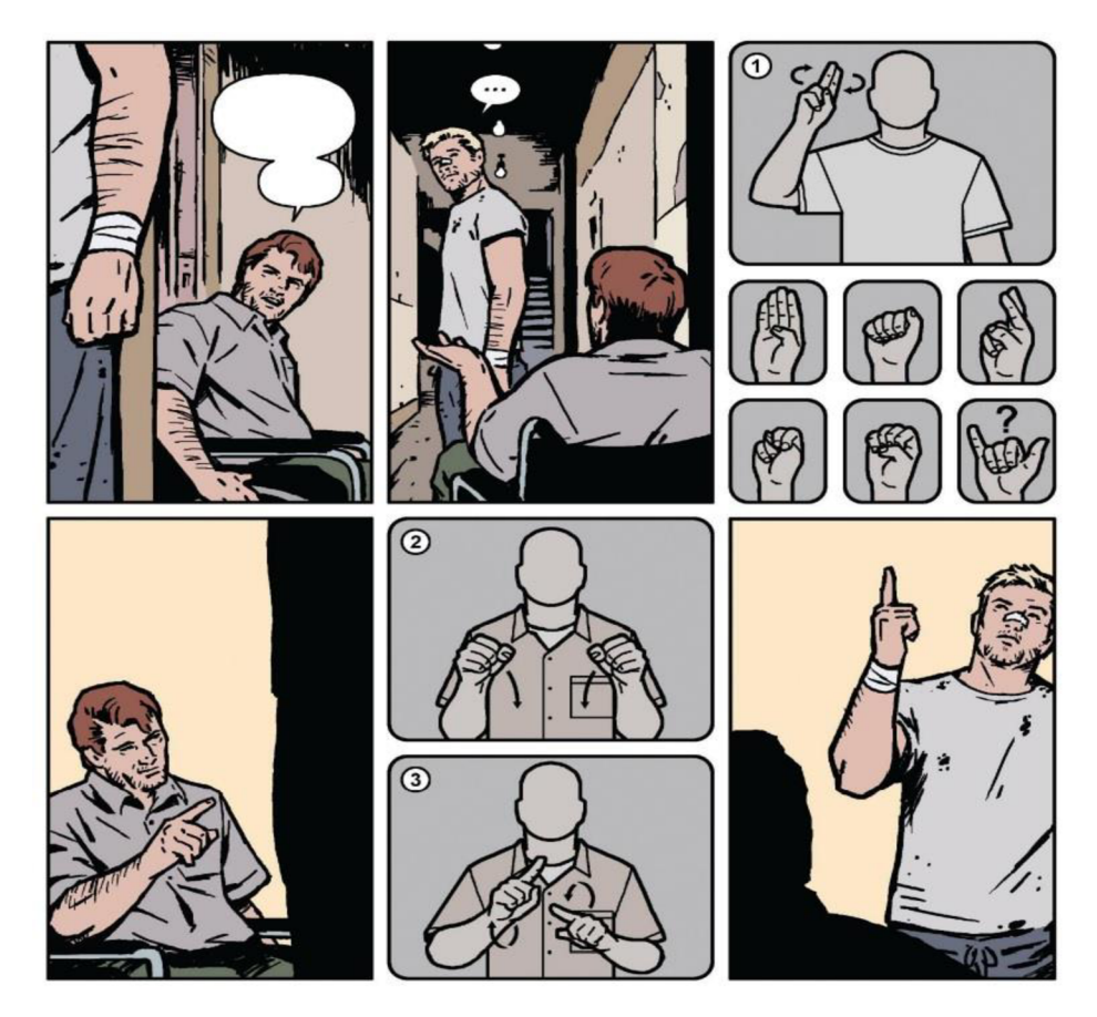
Fig. 4: Example of Hawkeye using sign language and empty speech bubbles in an excerpt from comics Hawkeye Vol. 4 #19 (2012). Photo: Matt Fraction and David Aja/Marvel.

authors deliberately make it difficult to read the story using sign language without providing translation. The hero's disability became part of the comics (Fig. 4).