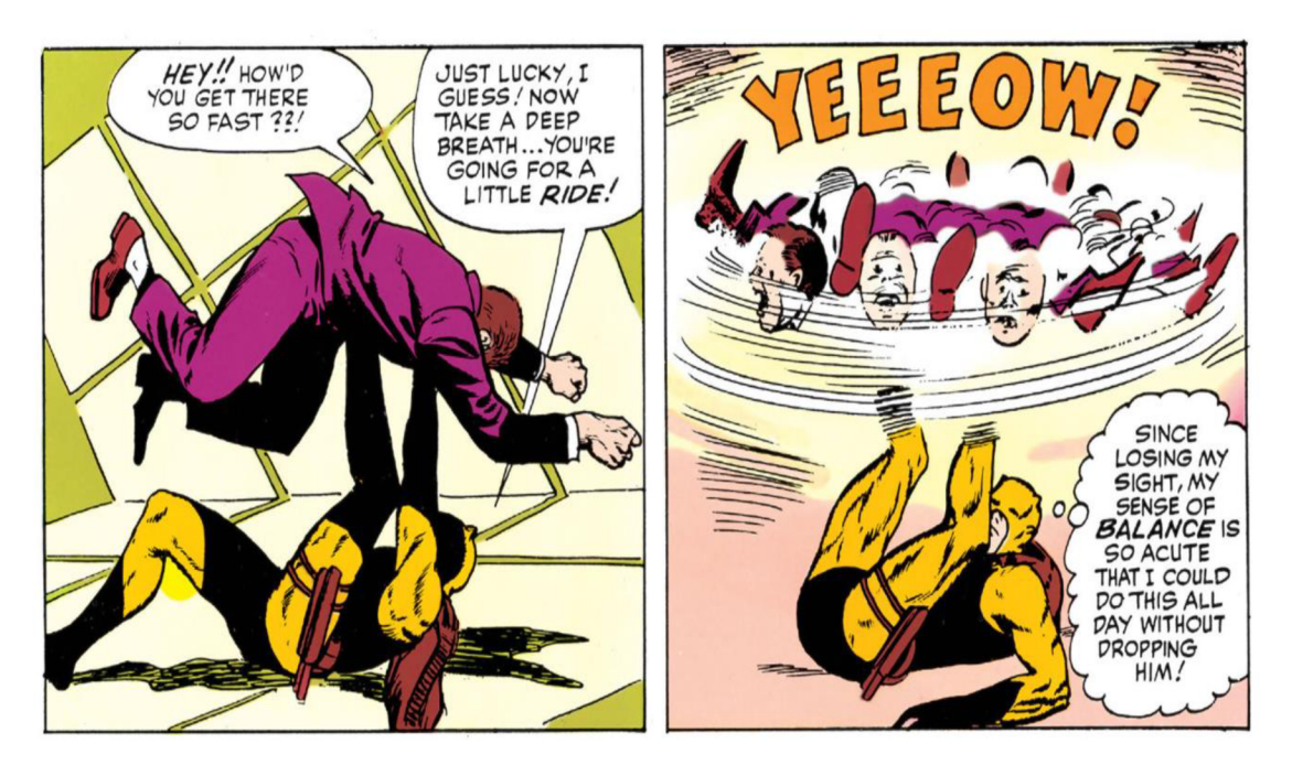
Fig. 8: An excerpt from the comic Daredevil Vol.1 # 3 (1964) depicts a fighting blind Daredevil. Photo: Joe Orlando/Marvel

As a child, Matthew Murdock was blinded by radioactive material in the accident, and his special abilities stem from the accident ( Daredevil Vol. 1 #1 (1964)). Although he does not see when exposed to radioactive material, his other senses improve and sharpen to a superhuman level. It can be said that it has a radar capability similar to echolocation, in other words blindsight ( Daredevil Vol.1 # 3 (1964)) (Fig. 8).<sup>37</sup> As a result, few characters know that daredevil doesn't actually see it.