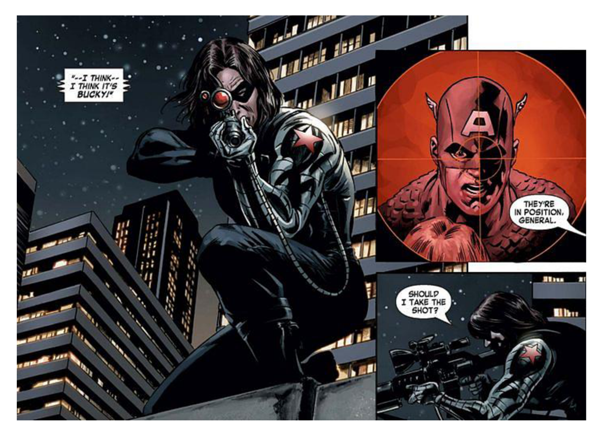
Fig. 1: A depiction of Bucky Burns with a bionic arm in an excerpt from Captain America Vol. 9 #6 (2018).

In a comics Captain America Vol. 9 #6 (2018), one of the Captain America's friends tells the captain, "I think — I think it's Bucky!"<sup>21</sup>, when he described a man with long brown hair and a bionic arm with a communist red star (Fig. 1). Bucky lost his hand when he survived a small plane explosion, suffered from amnesia after the accident and was rescued by a Russian officer, and the Russians used him as an assassin because of his amnesia and implanted bionic arm. However, Bucky began to remember over time, and the Russians placed him in a suspended animation (slowing down or stopping biological function to maintain physiological abilities).