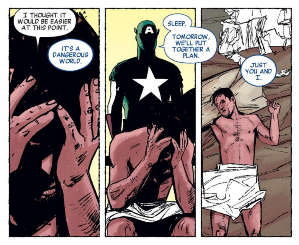
Fig. 7: An excerpt from the comic Moon Knight Vol. 6 #6 (2011) shows Moon Knight and his personality of Captain America.

This ability illustrates his disability as an advantage that makes him a better superhero and, in a way, reduces and alleviates the problems of people who suffer from this disease in real life.