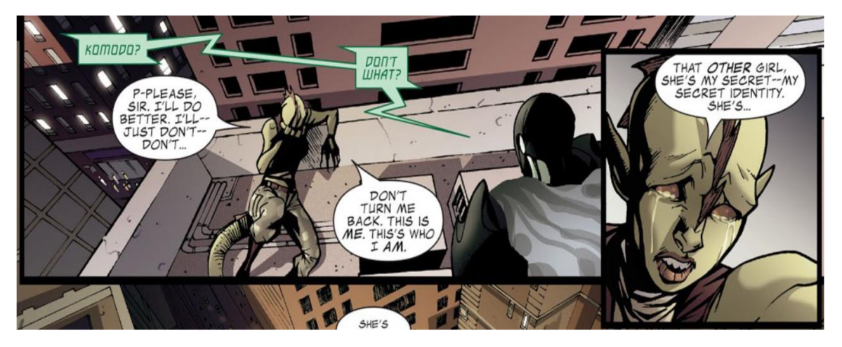
Fig. 9: Illustration of Komodo distressed after Spiderman threatens her in an excerpt from Avengers: The Initiative Vol 1. #3 (2007).

For example, in a comic Avengers: The Initiative Vol. 1 #3 (2007)^{38} , Melati is threatened with depriving her abilities. Melati collapses and claims that without her abilities and therefore without her legs (Fig. 9), she is no one, which would show that people with the same disabilities are in the same situation as her and they are also useless.