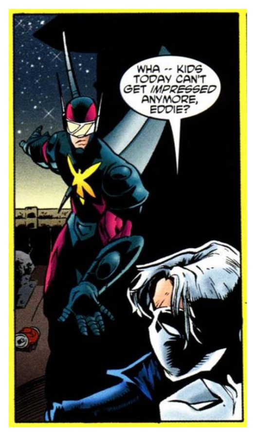
Fig. 5: Depiction of a Hornet in his suit in an excerpt from comics Slingers Vol. 1 #1 (1998).

Eddie was a scientist and inventor, given Spiderman's old Hornet costume (Fig. 5), which he modified to hide his handicap, added armament to the costume, and lightened it all so that it could be worn better ( Slingers Vol. 1 #0 (1998))<sup>31</sup>. By becoming the new Hornet, Eddie gained confidence. In addition, the suit increased his strength, and it was not easy to tell that he had one arm atrophied.