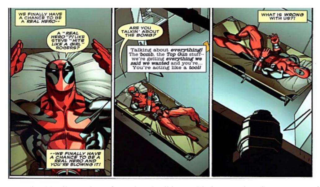
Fig. 11: Illustration of Deadpool talking to his inner voices in an excerpt from Deadpool #28 (2008). Photo: Dave Johnson/Marvel