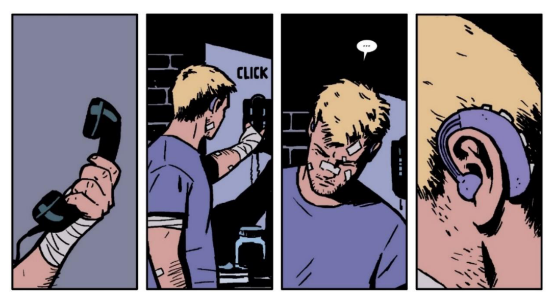
Fig. 3. Hawkeye's hearing aid in an excerpt from comics Hawkeye Vol. 4 #22 (2012).

written in detail in the comics, nor was his disability depicted, only that he wore hearing aids several times (Fig. 3). Hawkeye was not visibly impaired, and his hearing impairment did not interfere with his work with superheroes or his daily life.