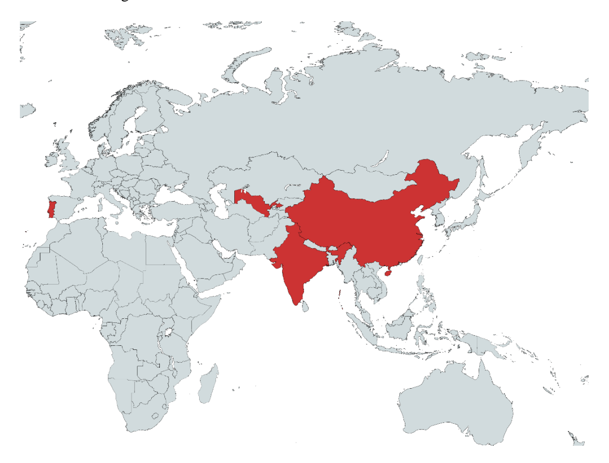
Figure 2: Fabrics suppliers

As mentioned above, LA LINEA first purchases relatively cheap but high-quality blank fabrics in countries with low production costs and then imports them to its production centre where it prints its own designs. The countries from which the company imports the fabrics are shown in Figure 1.