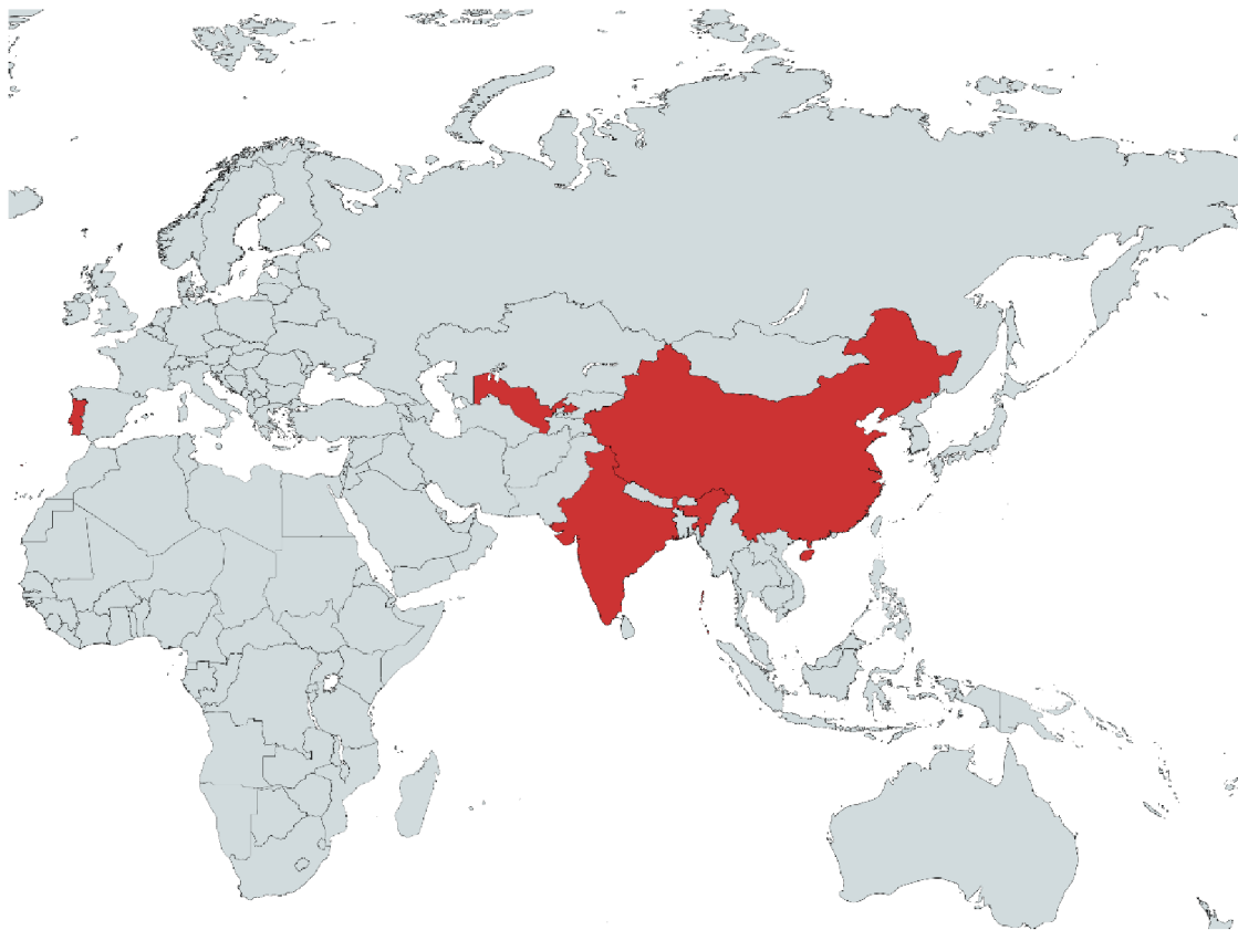
Figure 2: Fabrics suppliers

As mentioned above, LA LINEA first purchases relatively cheap but high-quality blank fabrics in countries with low production costs and then imports them to its production centre where it prints its own designs. The countries from which the company imports the fabrics are shown in Figure 1.