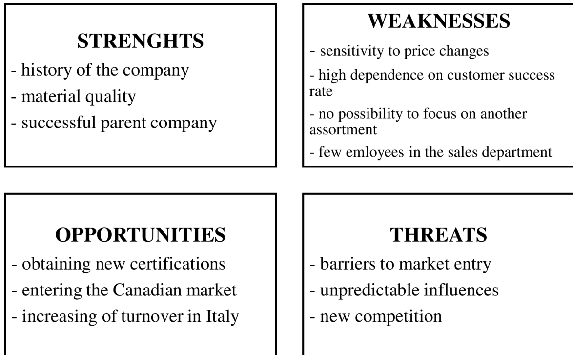
Figure 4: SWOT Analysis of LA LINEA

The information above describes the business situation of the company and indicates some strengths, weaknesses, opportunities, and threats. For a complete overview of these, a SWOT analysis will be used to help analyse the current situation of the company and based on this, steps for improvement will be proposed. Figure 4 depicts the strengths and weaknesses of the firm and its external opportunities and threats regarding to international trade strategy.