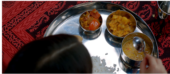
Image 3.1 - Bajrangi Bhaijaan (dir. Kabir Khan, 2015). Top shot of the contents of Munni's lunch served by Pawan's landlord's family.

cricketers, and Munni just shakes her head. He concludes that Munni doesn't understand anything about cricket and gives up and gets to his lunch. So does Munni. In a top-angle shot, the vegetarian contents of Munni's meal - Rice, Dal (lentil curry), and two types of Sabzi (vegetables cooked with spices) are served in small bowls on a plate.