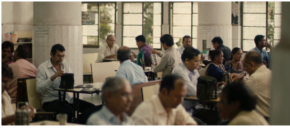
Image 2.3 - The Lunchbox (dir. Ritesh Batra, 2013) Saajan inspects the lunchbox, sitting alone in a crowded canteen.