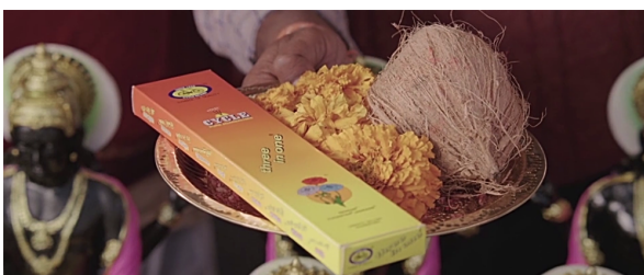
Image 4.10 - PK (dir. Rajkumar Hirani, 2014) Plate with Coconut, flower and incense sticks PK takes to the temple.

A shopkeeper selling coconuts, flowers and incense sticks outside a temple, with the intention of making a sale, convinces PK that he must offer it to the God inside if he wants his help. Coconut is very commonly offered during worship at temples or rituals and is broken at the altar for blessed beginnings and new endeavours. PK listens to the shopkeeper, pays for the coconut, flowers and incense sticks and goes inside the temple.