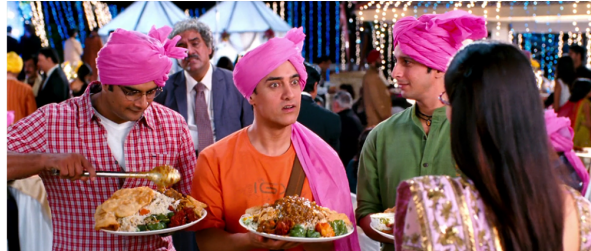
Image 4.9 - 3 Idiots (dir. Rajkumar Hirani, 2009) Farhan, Rancho and Raju eating at the wedding buffet

abandonment about being caught or judged, make the characters and scene humorous.