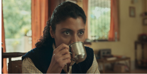
Image 1.14 - Geeli Puchchi (dir. Neeraj Ghaywan, 2021). Bharti drinks tea out of the steel cup

advising Priya and her family to make Priya quit the job with the motive of securing the accountant's job.