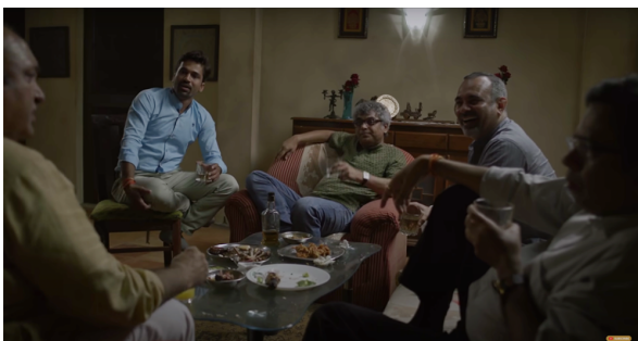
Image 1.8 - Juice (dir. Neeraj Ghaywan, 2017) Men eat, drink and talk in the living room.

The film opens with a scene in the living room. Four men are sitting on comfortable sofas in a well-lit living room, laughing over drinks and chicken. Manju is squatting on the floor near the coffee table, clearing bones and used tissue papers from the table. A fifth man enters the house with his pregnant wife, Rajni. He joins the men, and Manju leads Rajni through a dark narrow corridor to a kitchen. The kitchen is dimly lit, congested and barely ventilated. Five other women, including a house-help, are in the kitchen, all engaged in kitchen work. The kitchen is smoked up.