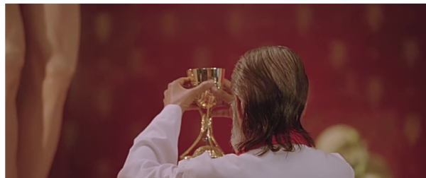
Image 4.14 - PK (dir. Rajkumar Hirani, 2014) Priest holding chalice with wine

PK is seen being pushed out of the Church by two men in suits. They abuse PK for behaving inappropriately. Before PK leaves, he notices the priest holding a chalice. He asks a man what is in the chalice and the man tells him that it is wine. PK concludes that God is bored of drinking coconut water and prefers to drink wine now.