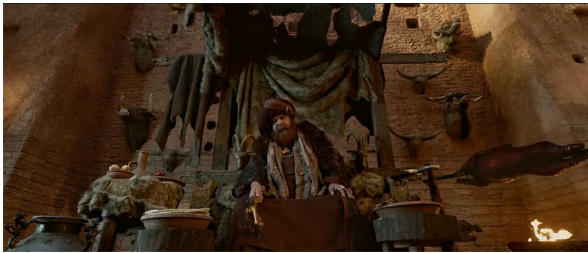
Image 3.6 - Padmavat (dir. Sanjay Leela Bhansali, 2018). Jalal-ud-Din Khilji is seen asleep at his seat with a piece of meat in his right hand. Meat being roasted can be seen next to him.

of him. He uses exaggerated gestures, tearing large pieces of the flatbread and holding it in both his hands instead of letting it rest on the plate. He picks up a large piece of meat and holds it in his palm (instead of with his fingers). He tears the meat of it with his mouth with exaggerated movements. His exaggerated actions and movements, plus the size of the meat portion, give him a beastly quality.