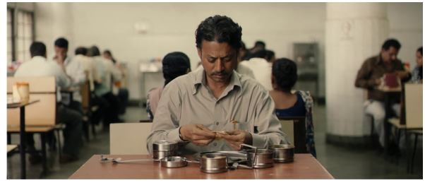
Image 2.4 - The Lunchbox (dir. Ritesh Batra, 2013). Saajan curiously feels the flatbread.