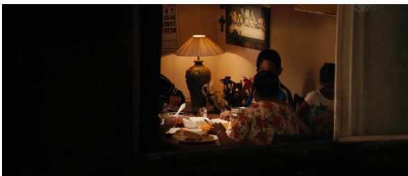
Image 2.6 - The Lunchbox (dir. Ritesh Batra, 2013) Saajan's neighbor's family dinner.

Saajan is standing on his balcony smoking a cigarette. The light is cold (fluorescent). He looks across the street to see a family eating dinner through their window. The lighting inside their house is warm. There are five people at the table, and there are many dishes - two types of curries, rice, bread and plenty of everything. They pass each other food and talk to each other. A little girl, who Saajan is seen yelling at in a previous scene, is at the table. She sees Saajan looking at her family. She gets up and shuts the window. Saajan is embarrassed and looks away.