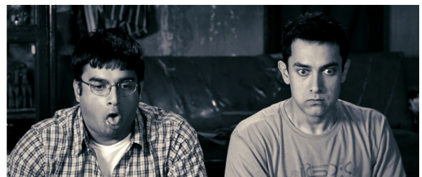
Image 4.5 - 3 Idiots (dir. Rajkumar Hirani, 2009) Farhan and Rancho feeling horrified and disgusted