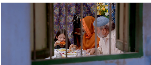
Image 3.2 - Bajrangi Bhaijaan (dir. Kabir Khan, 2015). Munni is seen eating chicken with a Muslim family.

On the other side of the window (Pawan's perspective), Munni is revealed in a medium-wide shot eating a leg piece of a chicken. There is an older couple next to her. The woman has pulled a ' dupatta ' (a scarf-like piece of fabric worn by women with several Indian outfits) over her head in a manner typical for Indian Muslim women. The man next to her is wearing a skullcap, thus conveying to the audience that Munni is eating with a Muslim family. The shot cuts to a reaction of Pawan and Rasika as they stand there shocked.