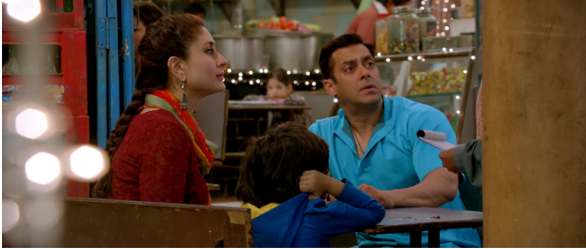
Image 3.4 - Bajrangi Bhaijaan (dir. Kabir Khan, 2015). Pawan, Rasika and her brother sit at one table at a non-vegetarian restaurant. Munni is seen in the background seated at a different table.

eat non-vegetarian food, he can't bear to sit at the same table, and he has taken her to a Hindu restaurant.