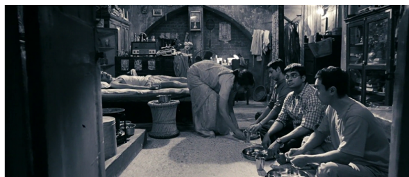
Image 4.1 - 3 Idiots (dir. Rajkumar Hirani, 2009) Home and dinner setup

Rancho are seated on the floor and Raju's mother keeps dinner plates in front of them (image 4.1). The kitchen setup is small and the state of the house reveals their poverty. Raju's mother serves them dinner on steel plates as they are seated on the floor. She then sits by the single stove where she is making fresh flatbread. She tells Raju that his sister has turned twenty-eight and the suitors are asking for a Maruti 800 (a small car) in dowry which Raju's family cannot afford. Raju's mother asks how they will get her married if Raju doesn't study.