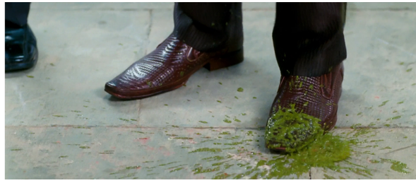
Image 4.7 - 3 Idiots (dir. Rajkumar Hirani, 2009) Chutney on Suhas' shoes

The green chutney here is used not as food but as a tool to demonstrate a point. It is used to damage something Suhas believes to be precious. When this damage is caused he starts blurting out the prices of his belongings that have been damaged. Rancho thus proves to Piya how Suhas values “things” more than people. It attempts to make fun of people who are obsessed with luxury items and can be hurt by something as simple as chutney .