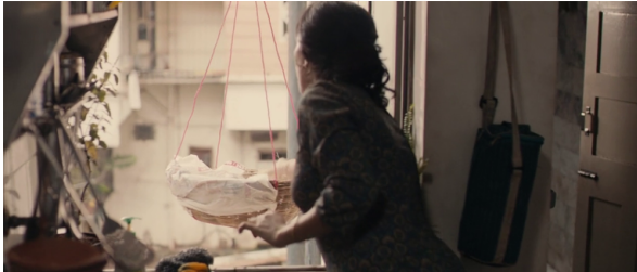
Image 2.1 - The Lunchbox (dir. Ritesh Batra, 2013). Ila is seen receiving spice powder from her neighbour through the window in her kitchen

call older people by their name and use equivalents of 'Aunty', 'Uncle', 'Sister' 'Brother' to refer to older people.)