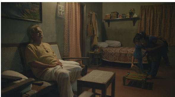
Image 1.1 - Masaan (dir. Neeraj Ghaywan, 2015). Devi sets a low stool and a higher tool for Gangadhar's dinner.

The scene begins with a wide shot of Gangadhar sitting on a bench-like sofa, pale-faced, expressionless, staring into the void. It cuts to another angle revealing Devi, placing a low stool next to a slightly higher one for Gangadhar to sit on (image 1.1). A low stool like that is commonly used by upper caste Brahmins (who are the “priest caste” and rank highest in the caste hierarchy) while performing holy rituals. It may be essential to note that these low stools are readily available in the market, and there are no strict rules about who can use them. Their common use, though, is during religious ceremonies and rituals. It gives the task being performed while seated on that stool an element of holiness and divinity. Therefore, it can be assumed that Gangadhar is a man who attaches a sacred value to food.