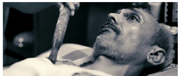
Image 4.3 - 3 Idiots (dir. Rajkumar Hirani, 2009) Raju's mother scratching her husband's chest with the rolling pin