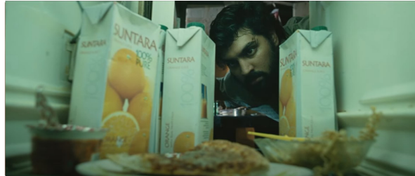
Image 4.22 - Delhi Belly (dir. Abhinay Deo, 2011) Nitin finds orange juice

stops. He looks at the packs of orange juice sitting in the fridge (image 4.22). Nitin has an idea.