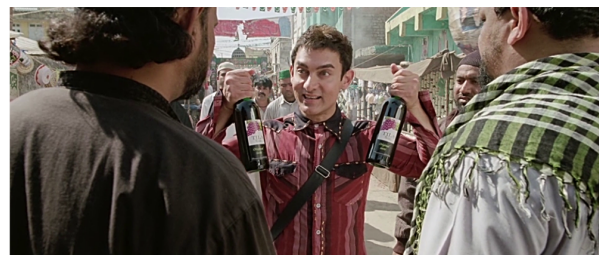
Image 4.17 - PK (dir. Rajkumar Hirani, 2014) PK proudly shows his wine bottles.

PK adds that it is for God as casually asks "Where is he?".