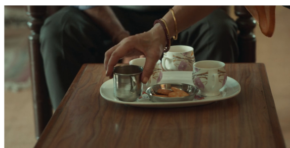
Image 1.13 - Geeli Puchchi (dir. Neeraj Ghaywan, 2021). Bharti is offered a steel cup.

We see Bharti's reaction in a medium-close-up as she is singly offered the steel cup. All societies probably witness class-based discrimination in terms of how people are served food and beverages. One may reserve the better serveware for guests and important people and offer serveware of less value for those they consider beneath them. In India, this attitude extends to caste-based identities too. I have on several occasions seen people adopt such discriminatory practices towards their house-helps and other workers. In India, most middle-class families eat out of steel plates and cups. Ceramic ones are reserved for guests and special occasions. However, most families usually drink tea out of ceramic cups. When some people at the table are served selectively in ceramic ware, which has a higher value and others are served in steel ware, it is a clear gesture of discrimination. This behaviour is normalised when there is a clear hierarchy in a relationship, for example- employer,