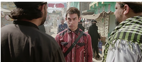
Image 4.16 - PK (dir. Rajkumar Hirani, 2014), PK being questioned outside the mosque.

Two men in skullcaps see this and stop PK outside the Mosque. They ask him what is in his hand. PK is seen in a medium shot framed between the two men (image 4.16). PK explains that it is wine. He lifts the two bottles up to his face, now framing himself between the two men and the two bottles of wine (image 4.17).