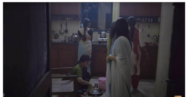
Image 1.9 - Juice (dir. Neeraj Ghaywan, 2017). Women cook in the kitchen.

Ghaywan establishes the difference in the experience of a party for men and women powerfully through the contrast in the spaces they occupy and the activities they indulge in. He uses character actions, dialogues, lighting and soundscape to depict this contrast. While the men sit in comfortable chairs in an air-cooled, brightly lit living