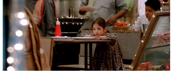
Image 3.5 - Bajrangi Bhaijaan (dir. Kabir Khan, 2015). Munni is sitting alone at a table at the non-vegetarian restaurant.

He discusses this situation with Rasika, convinced that she is not a Brahmin; Pawan then speculates that maybe she is a Kshatriya (Warrior caste - second in the caste hierarchy) by caste as they can be of light skin colour and are non-vegetarians. Pawan is relieved at this thought (which still maintains Munni high in the caste triangle and of the Hindu religion). He continues to look after her.