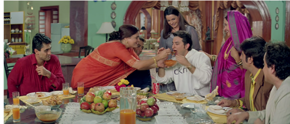
Image 2.11 - Hum Saath - Saath Hain (dir. Suraj Barjatiya, 1999) Mother feeds Vinod Gajar Ka Halwa (dessert).

of care and nourishment is traditionally that of women and a home where this duty is wholeheartedly fulfilled is a happy home.