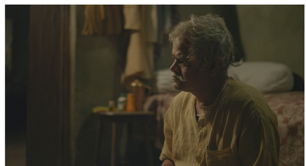
Image 1.4 - Masaan (dir. Neeraj Ghaywan, 2015). Gangadhar stares at Devi after refusing food.