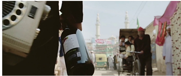
Image 4.15 - PK (dir. Rajkumar Hirani, 2014) PK carrying wine to the mosque