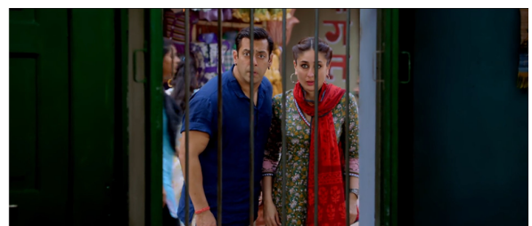
Image 3.3 - Bajrangi Bhaijaan (dir. Kabir Khan, 2015). Pawan and Rasika are shocked to see Munni eating chicken.