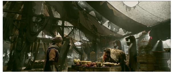
Image 3.7 - Padmavat (dir. Sanjay Leela Bhansali, 2018). Alauddin Khilji is seen eating meat for lunch.