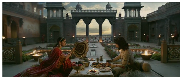
Image 3.8 - Padmavat (dir. Sanjay Leela Bhansali, 2018). King Ratan Singh has dinner with his wife Queen Padmavati.