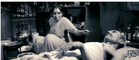
Image 4.2 - 3 Idiots (dir. Rajkumar Hirani, 2009) Raju's mother scratching her husband's chest with the rolling pin

Raju's father who is lying in a bed right next to the kitchen set up starts making a noise. Raju's mother takes the rolling pin she uses to roll the flatbread, puts it inside his vest and scratches his chest with it (image 4.2 & 4.3). Farhan and Rancho are seen in a two-shot as they stare in horror. Raju's mother tells them how her husband's eczema cream now costs Rupees 55. She then removes the rolling pin and starts rolling the flatbread.