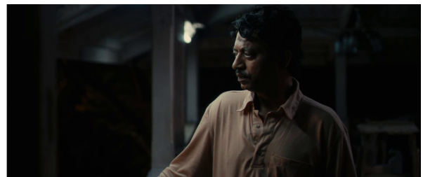
Image 2.7 - The Lunchbox (dir. Ritesh Batra, 2013) Saajan stands alone in the balcony as he watches his neighbors having dinner.