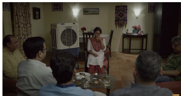
Image 1.11 - Juice (dir. Neeraj Ghaywan, 2017). Manju sits in the living room, sipping juice, leaving the men uncomfortable.