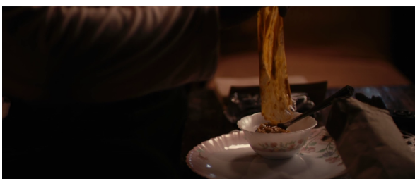
Image 2.8 - The Lunchbox (dir. Ritesh Batra, 2013) Saajan pours curry out of a thin polythene bag into a bowl.