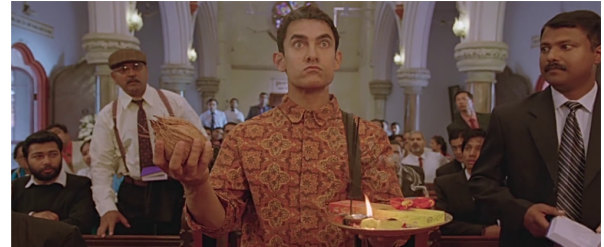
Image 4.13 - PK (dir. Rajkumar Hirani, 2014) PK about to break the coconut. People in the Church are horrified.

PK is seen being pushed out of the Church by two men in suits. They abuse PK for behaving inappropriately. Before PK leaves, he notices the priest holding a chalice. He asks a man what is in the chalice and the man tells him that it is wine. PK concludes that God is bored of drinking coconut water and prefers to drink wine now.