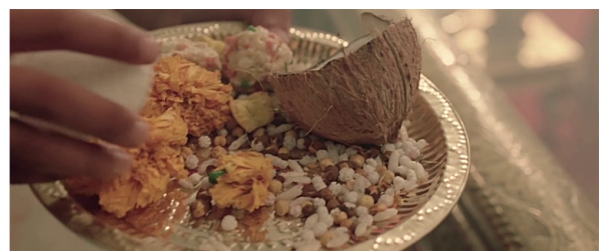
Image 4.11 - PK (dir. Rajkumar Hirani, 2014) Plate with blessed flowers and blessed broken coconut he is returned