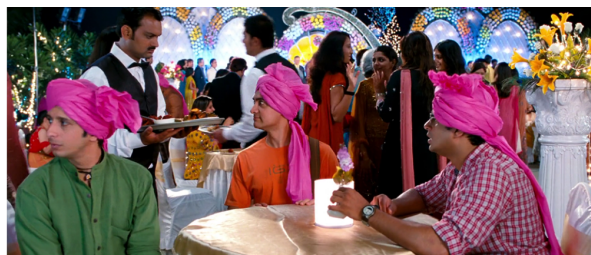
Image 4.6 - 3 Idiots (dir. Rajkumar Hirani, 2009) Raju, Rancho and Farhan ordering starters

Rancho, Raju and Farhan sit down at a table (image 4.6). One of the servers is passing with a tray of snacks. Rancho stops him and asks him what they are serving as starters. Before the server answers, Rancho asks him to bring them two plates of everything. Rancho takes the plate of snacks the server is holding from him as Farhan asks him to bring some Vodka. The server awkwardly hands him the plate and goes away. Raju looks around, scared about getting caught.