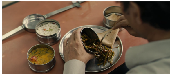
Image 2.5 - The Lunchbox (dir. Ritesh Batra, 2013). Saajan serves himself the meal cooked by Ila.

Saajan's body language and expressions convey his surprise and overwhelm at receiving such an aromatic and delicious meal. The way he gears himself up after taking a small bite of the vegetable to eat the meal suggests that such a delicious meal is not an everyday thing for him. He feels the flatbread, implying that he doesn't commonly eat them this soft. Being a middle-aged, working man, traditionally, the job of cooking for him would be that of his wife. His surprise and overwhelm could be understood as the lack of having this caregiver. The audience could assume that his wife has divorced him, is a terrible cook, is dead, is unwell or doesn't love him or care for him.