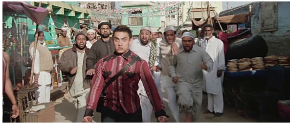
Image 4.18 - PK (dir. Rajkumar Hirani, 2014) PK runs away from the mob

In the next shot, PK is seen running away from a mob of angry Muslim men running behind him. PK's innocence, ingenuity and complete ignorance towards the gravity of the situation accompanied by light-hearted background music make the scene funny instead of stressful.