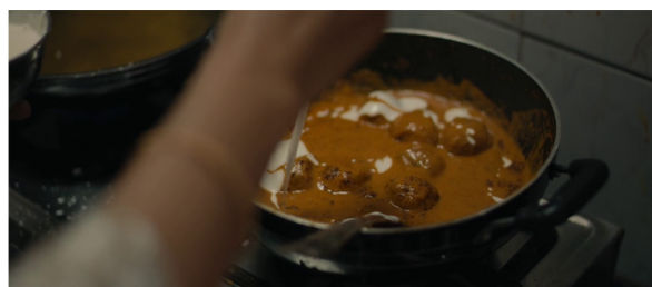
Image 2.10 - The Lunchbox (dir. Ritesh Batra, 2013) Ila makes Paneer curry.

The letter continues as we see images of Ila elaborately preparing a red curry with cottage cheese. It reads, "I thought for a few hours that maybe the way to man's heart is truly through his belly. In exchange for those hours [of hope], I am sending you today - ' Paneer ' [a curry with cottage cheese]. My husband's favourite dish".