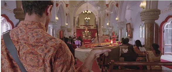
Image 4.12 - PK (dir. Rajkumar Hirani, 2014) PK entering a Church with a plate with coconut, incense stick, holy thread, lamp and other offerings

shot of the church and a loud noise (of coconut breaking) is heard and crows and birds sitting on the church building are seen flying away.