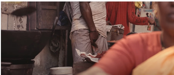
Image 4.20 - Delhi Belly (dir. Abhinay Deo, 2011) Man scratching his crotch with his hand.

Nitin is seen riding his scooter on a busy road in Delhi. In a top shot, the audience sees a large wok filled with boiling oil. A hand lowers a bright red, marinated piece of chicken thigh (image 4.19). In a wide shot, the audience sees a narrow crowded lane. In one corner of the frame, a man is seen frying chicken (same as in the previous shot) and Nitin is seen parking his scooter. Nitin asks the man for a piece of chicken. In a medium close-up, the fried chicken vendor is seen scratching his crotch (image 4.20) and with the same hand reaching for a piece of chicken (image 4.21) and packing it in a newspaper.