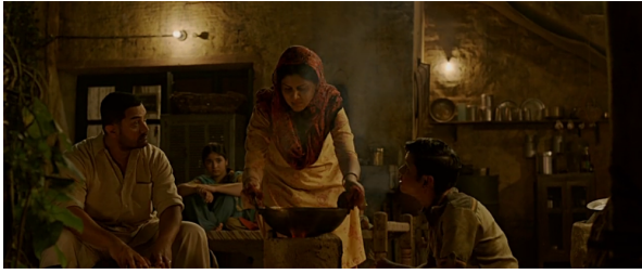
Image 3.9 - Dangal (dir. Nitesh Tiwari, 2016). Mahavir cooks chicken outside his house, in the front yard.