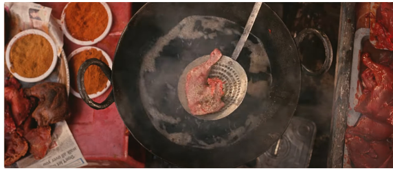
Image 4.19 - Delhi Belly (dir. Abhinay Deo, 2011) Chicken being fried

Nitin is seen riding his scooter on a busy road in Delhi. In a top shot, the audience sees a large wok filled with boiling oil. A hand lowers a bright red, marinated piece of chicken thigh (image 4.19). In a wide shot, the audience sees a narrow crowded lane. In one corner of the frame, a man is seen frying chicken (same as in the previous shot) and Nitin is seen parking his scooter. Nitin asks the man for a piece of chicken. In a medium close-up, the fried chicken vendor is seen scratching his crotch (image 4.20) and with the same hand reaching for a piece of chicken (image 4.21) and packing it in a newspaper.