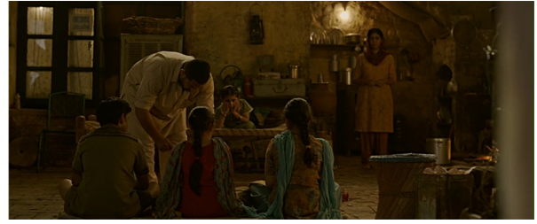
Image 3.10 - Dangal (dir. Nitesh Tiwari, 2016). Mahavir serves his daughters chicken. His wife watches with disgust from a distance.

Following his nephew's instructions, Mahavir cooks the chicken. He then serves the chicken to his daughters and his nephew and they eat it. His wife stands far away, watching her daughters in disgust, as they eat the chicken.