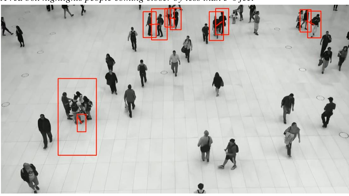
Figure 7.1 A red box highlights people coming closer by less than 5-6 feet

Note . Crowds can be tracked in real-time via CCTVs. People who come closer together than 5-6 have a red box drawn on them (Banerjee, 2020).