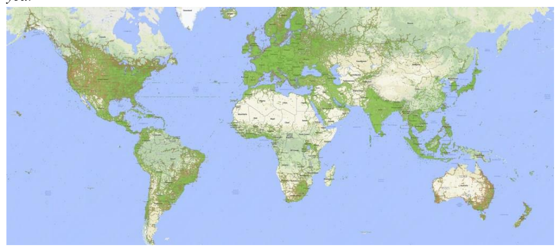
Figure 5.1 Cellular reception covers an increasing percentage of the world's landmass every vear

Note . The growing reach of networks provides increasing quality of data. Tracking hardware can be potentially monitored in more than 170 countries (Cellular Tracking Technologies).