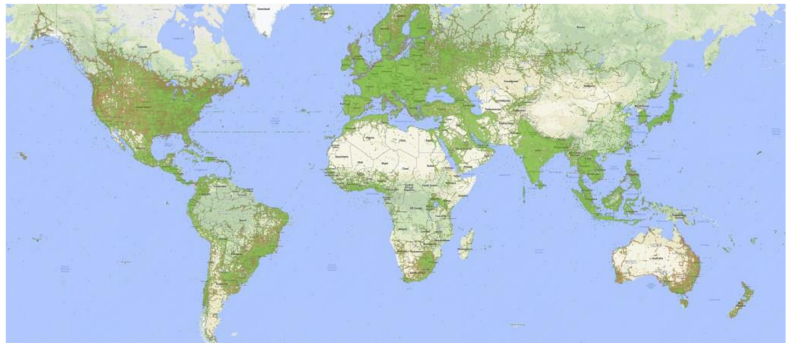
Cellular reception covers an increasing percentage of the world's landmass every year

Note. The growing reach of networks provides increasing quality of data. Tracking hardware can be potentially monitored in more than 170 countries (Cellular Tracking Technologies).