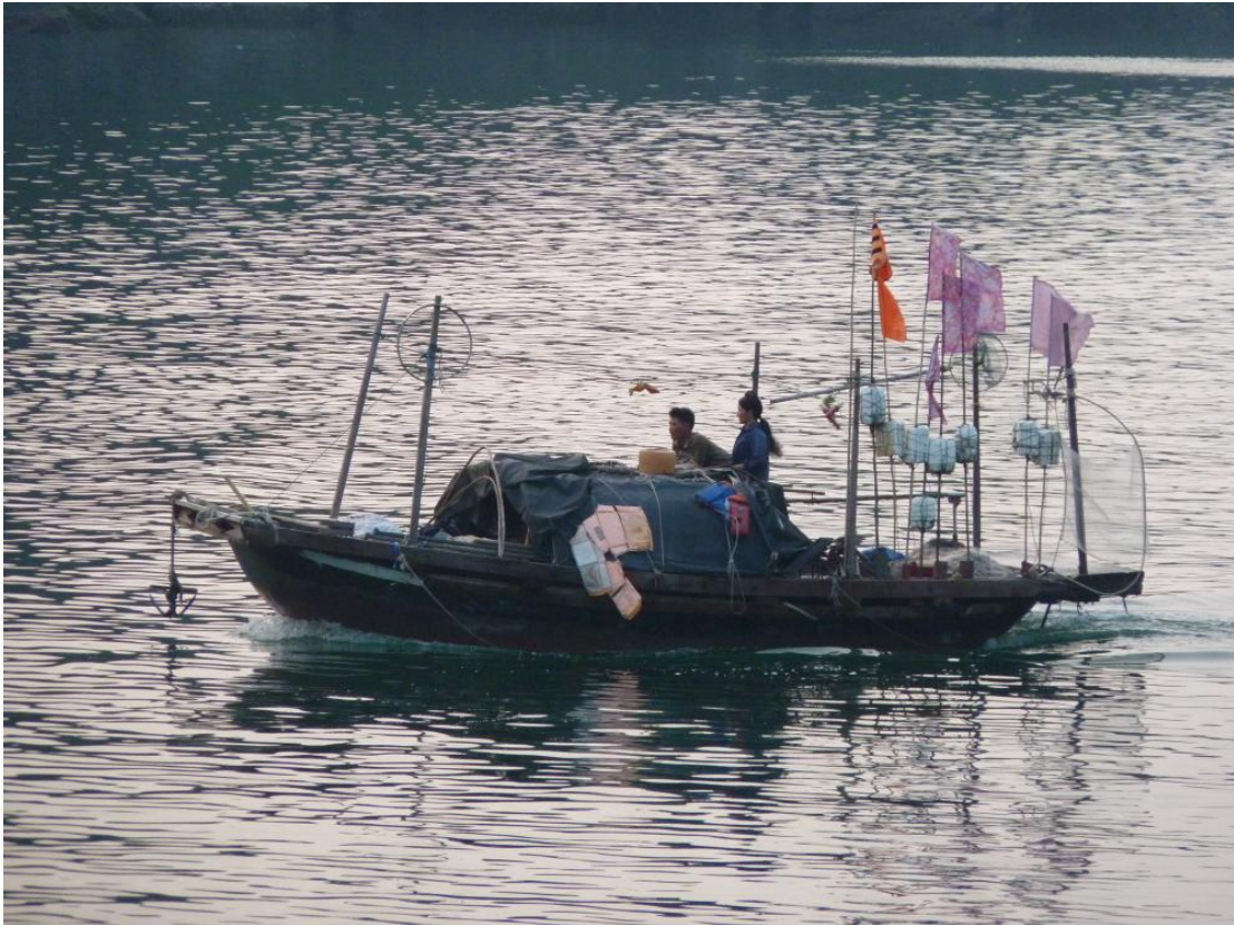
Figure 4 : Sampan dwellers in Halong Bay, Vietnam.