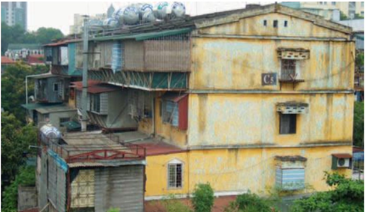
Figure 3: Informal housing extensions to public housing in Hanoi, Vietnam.

rubbish dump. (Minnery et al., 2013). Support in housing from state in procuring housing and improving living standards predominantly receive those with a higher income or good business in the private sector. The subsidised prices for low-income and poor households in the private sector are well beyond their means. Especially difficult situation is for households with one income earner and several dependants (Han, 2008).