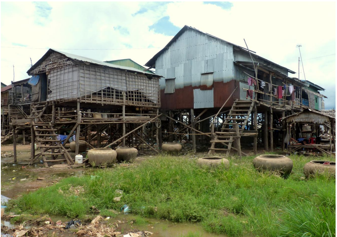
Figure 2: Squatter community in Kampong Chnang, Cambodia.

In some cases governments and private developers provide modern garbage and sewerage systems, enhance public sanitation and hygiene, and provide electricity and clean water. In the region, Malaysia, Indonesia and Singapore have provided different housing schemes to stop the housing problem for poorer informal settlers. In Indonesia, major private developers in Jakarta have built satellite towns for populations of 150,000 persons and more. Along with building these towns, the developers have provided that there are many flats within the estate for poorer people, who constantly are going to be employed by the wealthy residents as chefs, maids, gardeners and drivers. In the Malaysian example, the government has provided private developers a set amount of money for them to build houses for the poorer urban dwellers. Some developers have complained that the amounts per unit are too little and hence the flats that are built are sub-standard and of poor workmanship (Syed, 2000).