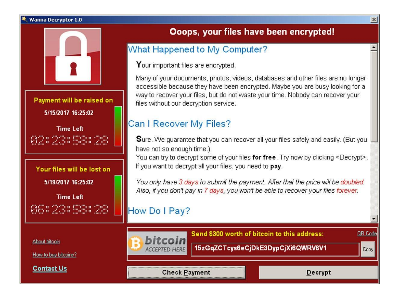
Figure 4.1 The example of Ransomware [36]

Computer threats and attacks continue to evolve as technology advances. Individuals and organizations must know these threats and implement robust security measures to mitigate their risks. Essential steps include updating software and operating systems regularly, creating strong and distinct passwords, implementing multi-factor authentication, and raising awareness among users regarding potential threats and the importance of adhering to best practices for maintaining a secure digital landscape.