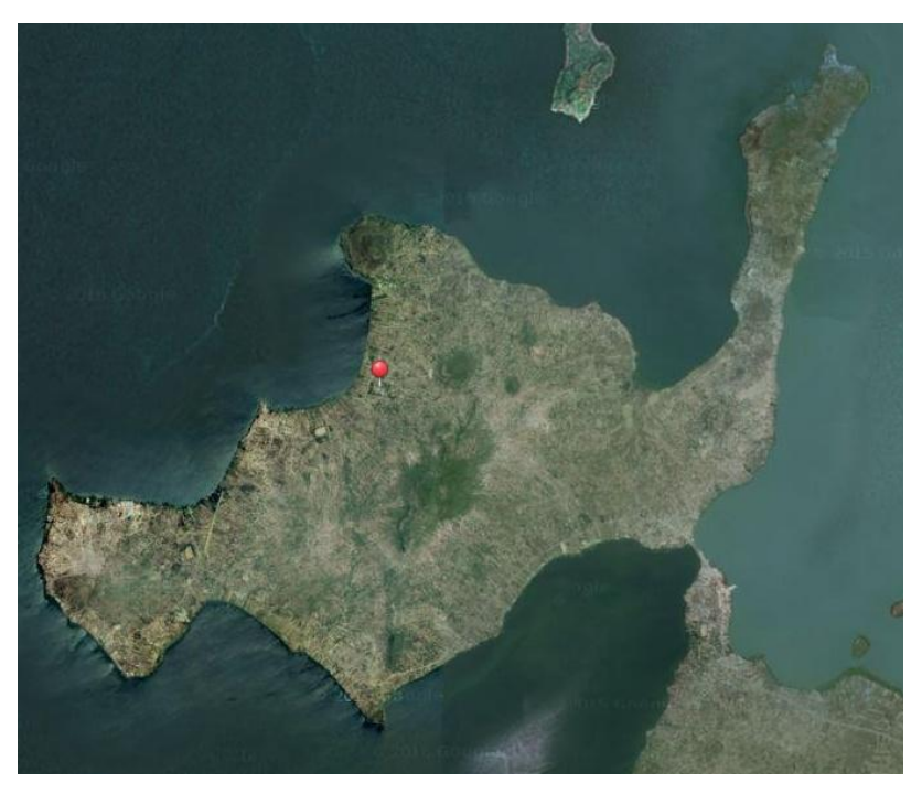
Appendices 1 Rusinga island map with community center market