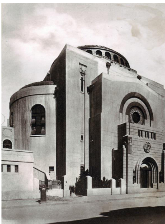
Figure 2: Beth Aharon Synagogue 87

Another Baghdadi Jewish praying hall, the Shearith Israel Synagogue, was established by D. E. J. Abraham in 1898. 85 The Shearith Israel was replaced by the Beth Aharon Synagogue (Figure 2) in 1927 funded by one of the important and affluent members of the community - Silas Aharon Hardoon supported the construction of the synagogue in the name of his father Aharon Hardoon. 86