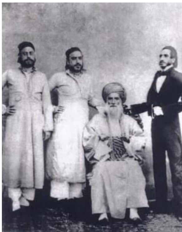
Figure 3: David Sassoon (seated) and his three sons, Bombay, India, mid-19th century 116

The self-perception of Baghdadi Jews changed with the time shifting from the Judeo-Arabic cultural identity to a more internationalized identity, as it may be seen on the example of David Sassoon wearing traditional Baghdadi attire and one of his sons already adopting Western clothing style, as seen in Figure 3. The life style was in general becoming anglicized; however, there were Baghdadi customs that were kept, e.g. the hookah. The perception of the Baghdadis depended also on the context of the interaction. 115