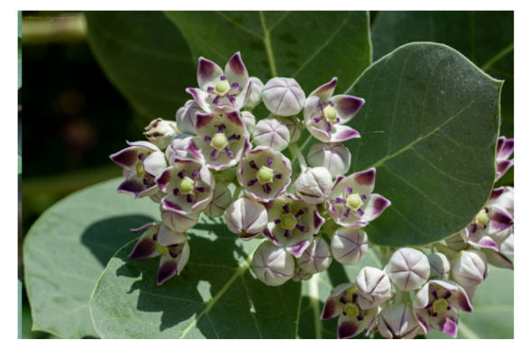
Fig. 1 . Abroma augusta (L.) L.f. (Khaytarova 2023)