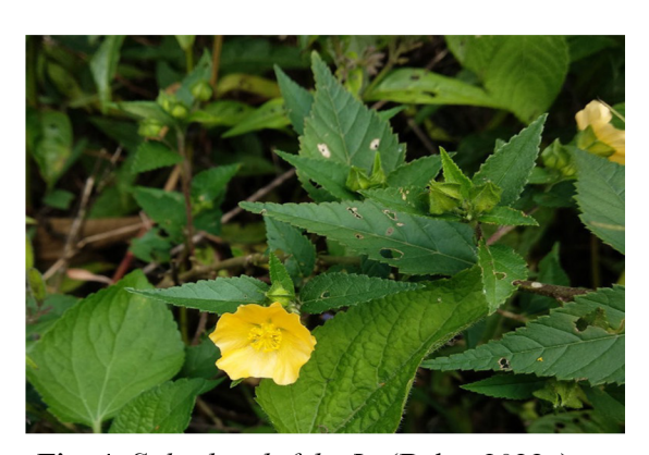
Fig. 4. Sida rhombifolia L. (Balan 2023a)