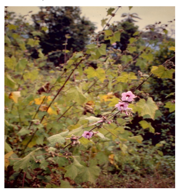
Fig. 9. Pavonia urens Cav. (Govaerts 2004)