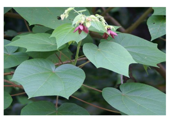
Fig. 2. Calotropis procera (Aiton) R.Br. (Schlomit 2023)