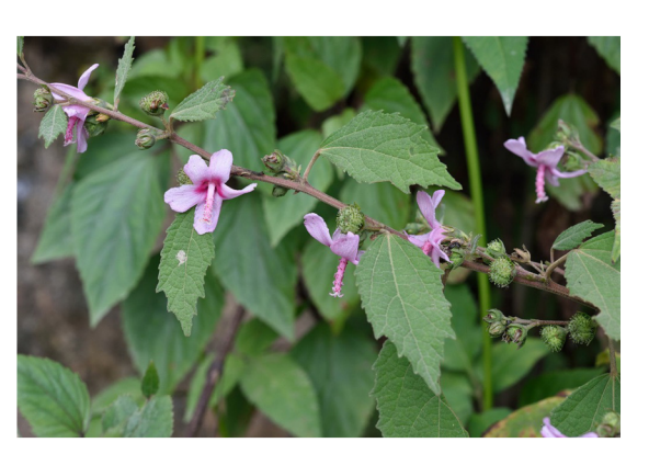
Fig. 6 . Urena lobata L. (Fragman-Sapir 2023)