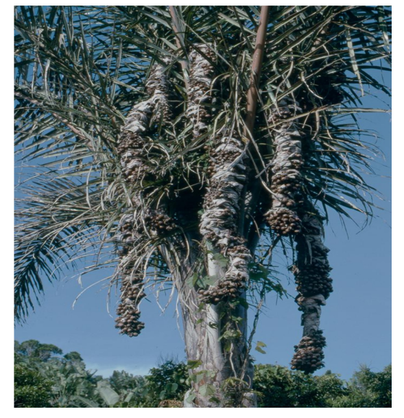
Fig. 10 . Raphia farinifera (Gaertn.) Hyl. (Dransfield 2023)