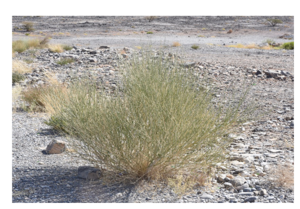
Fig. 5. Leptadenia pyrotechnica (Forssk.) Decne. (Moliné 2016)