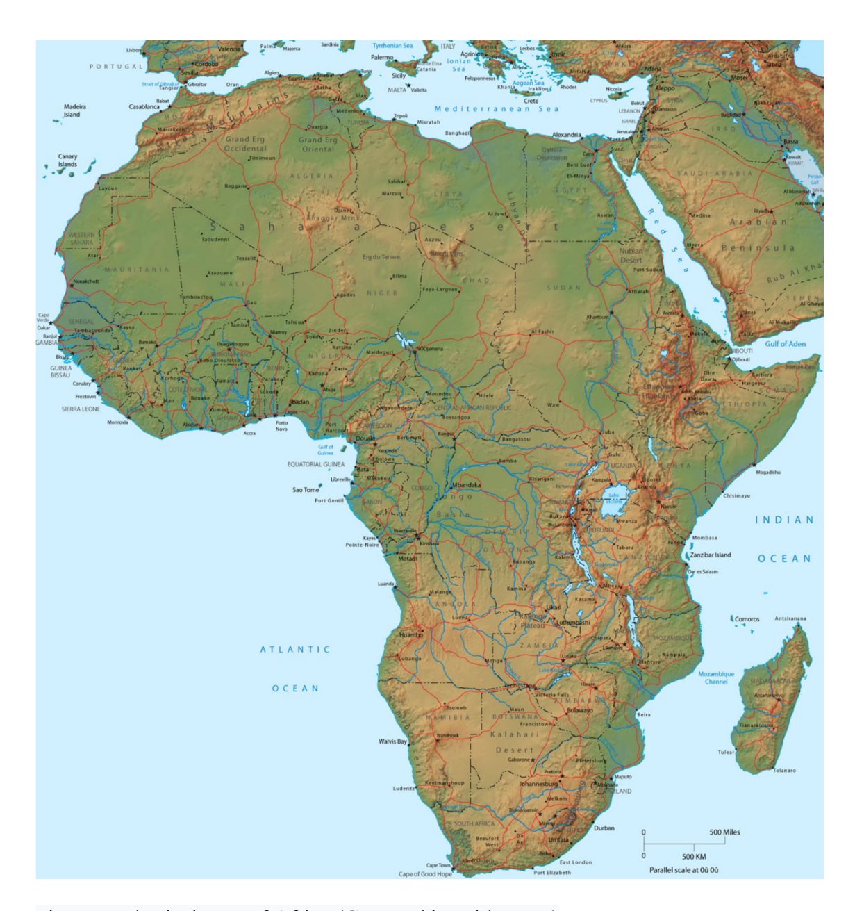
Figure 1: Physical Map of Africa (Geographic guide 2023)