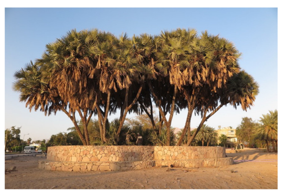
Fig. 3 . Hyphaene thebaica (L.) Mart. (Fragman-Sapir 2015)