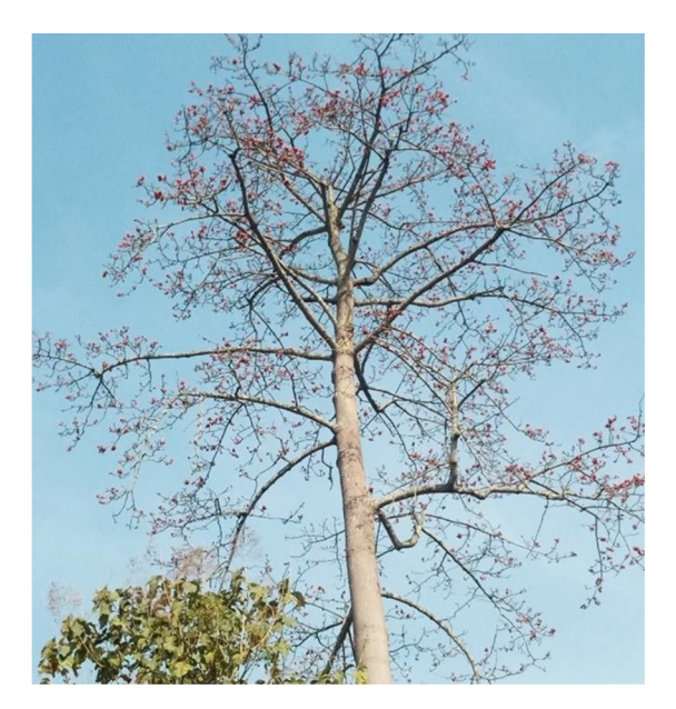
Fig. 7. Bombax buonopozense P.Beauv (Plant Net 2023)