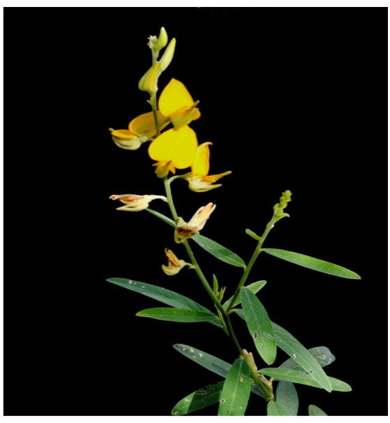
Fig. 8. Crotalaria juncea L. (Balan 2023b)