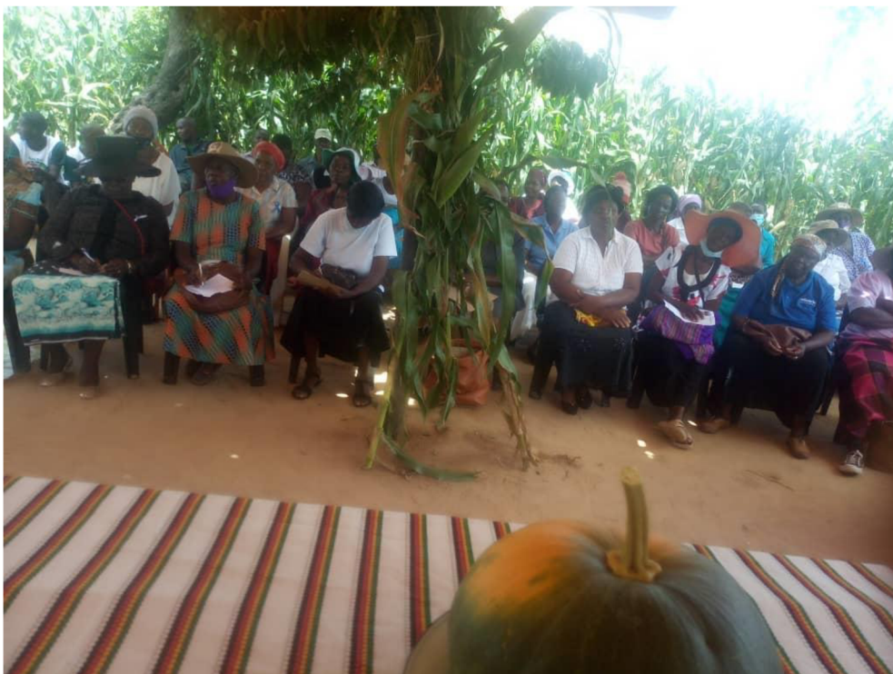
Figure 3: Picture of Cooperative members in a meeting