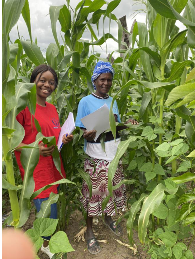
Figure 1: Author with female cooperative member