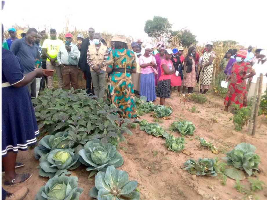
Figure 2: Cooperative members standing around their crops