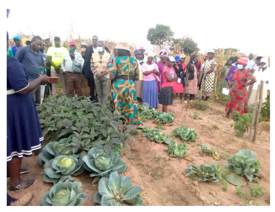
Figure 2: Cooperative members standing around their crops