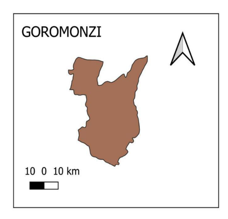
Figure 1: Map of Goromonzi.

The map was created by the author using QGIS 3.22.4 software.