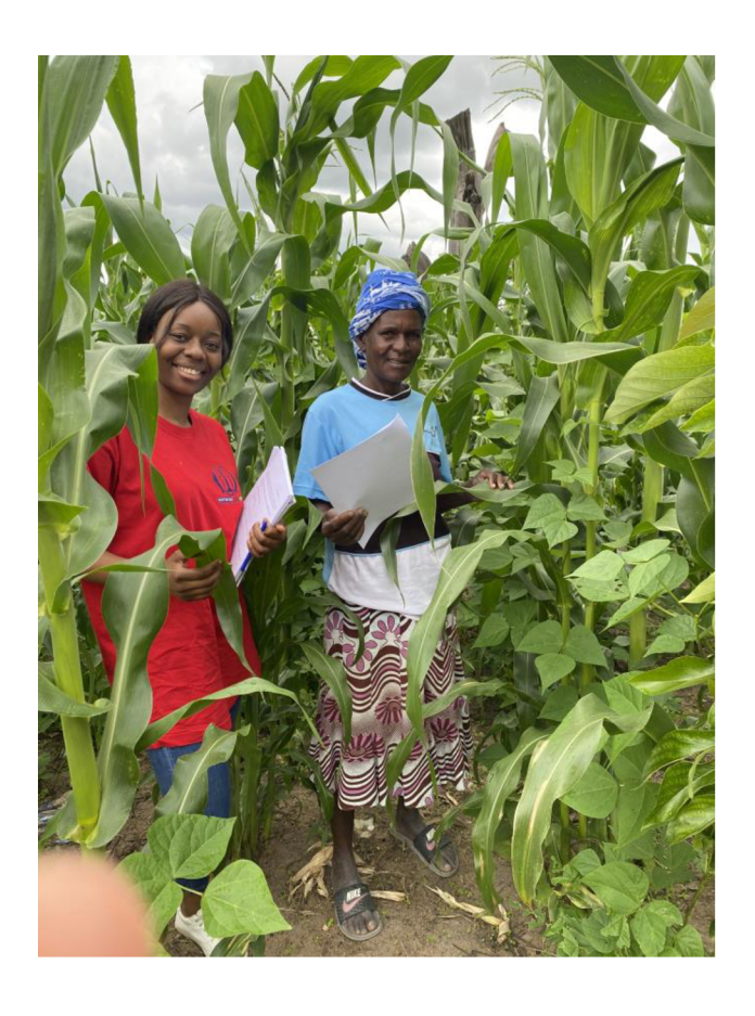
Figure 1: Author with female cooperative member