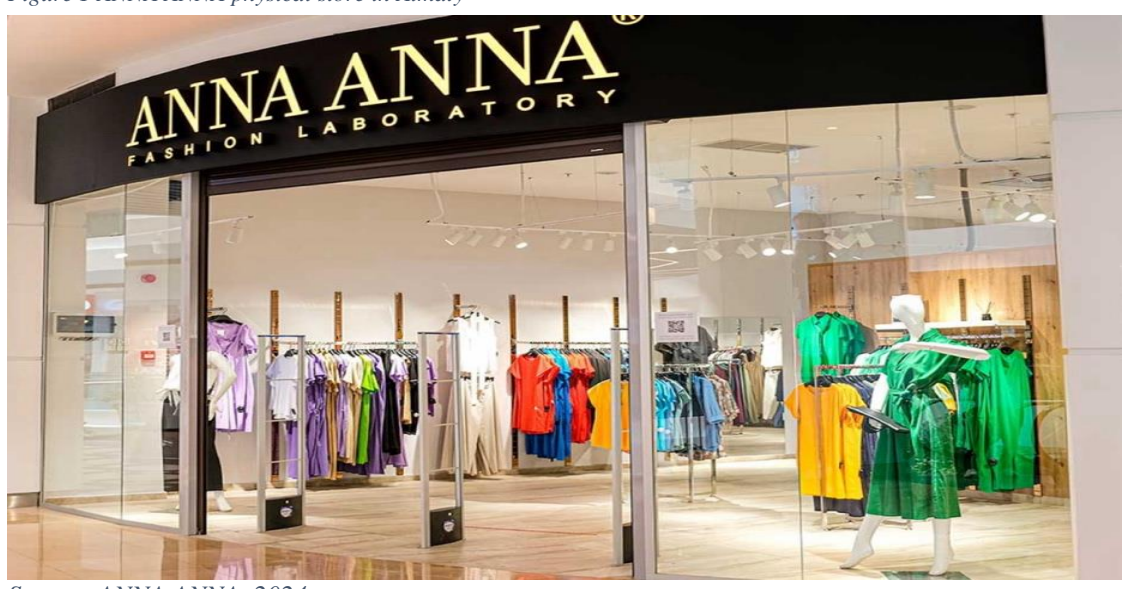
Figure 1 ANNA ANNA physical store in Almaty

Own production ensures multi-level quality control of the product from the beginning of creation to release for sale. The ANNA ANNA trademark is at the stage of active development. The brand currently has 13 stores and plans to open 5 more new locations. In addition, they offer a proven women's clothing franchise in Kazakhstan, which has already earned its image and trust among customers.