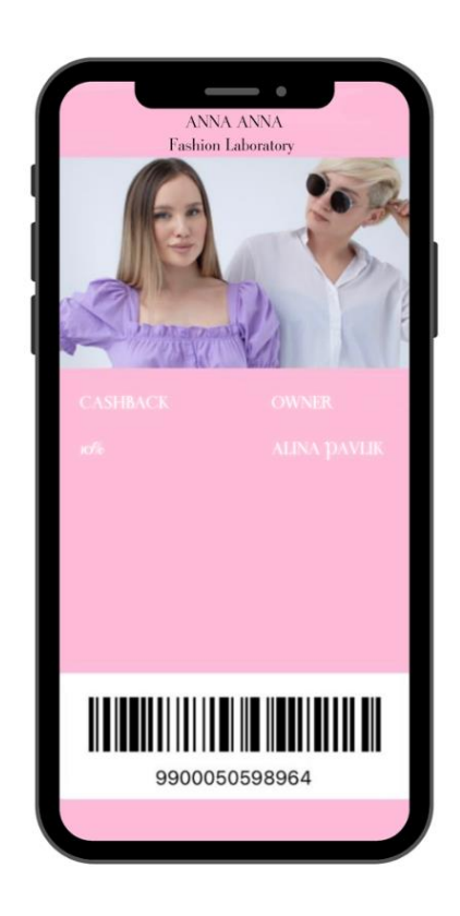
Figure 7 ANNA ANNA's cashback card

As part of its ongoing commitment to improve the customer experience and express gratitude for their loyalty to the brand, ANNA ANNA provides an exclusive loyalty program. This system is designed with ease of use in mind and provides the opportunity to accumulate and use cashback through the popular payment services Apple Pay and Google Pay. The program provides three levels of loyalty: Silver, Gold, and Platinum, each of which opens new advantages and opportunities for our clients.