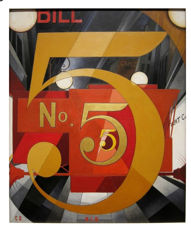
Painting 6 Charles Demuth - I Saw the Figure 5 in Gold