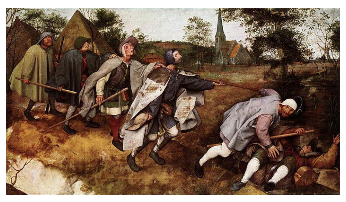
Painting 1 Pieter Brueghel the Elder - The Parable of the Blind Leading the Blind