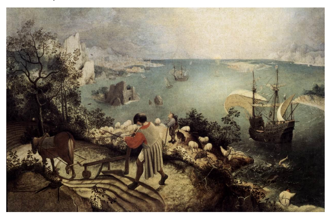
Painting 2 Pieter Brueghel the Elder - Landscape with the Fall of Icarus