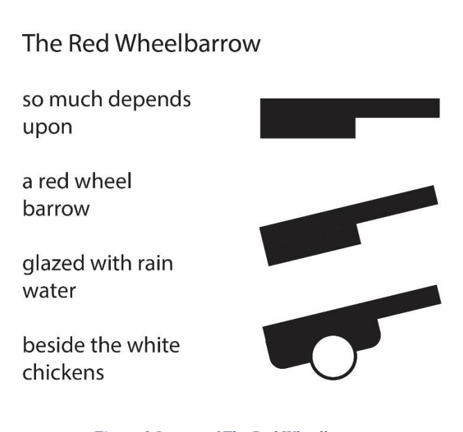
Figure 1 Layout of The Red Wheelbarrow

There are also other poems, both regular and irregular, which Williams deliberately shaped into some concrete design. An obvious example of such arrangement is to be found in "The Red Wheel Barrow", where, if one uses a bit of imagination, it is easy to see that each stanza looks as if formed into a shape of a wheelbarrow. The first and longer line consisting of three words represents the handles, and the second line, which is shorter and always consists only of one single word resembles the body/wheel. However, such "visual reading" is in Williams's poems usually impossible to do without the actual reading, which gives the layout its meaning. The poems are simply not shaped that explicitly to function as a clear image. Even though it is true that Williams is usually very expressive and direct with the titles of the poems, so that the reader can often approach the visual dimension simultaneously with the actual reading and grasping the meaning of the poem. In case of "The Red Wheelbarrow" then, the perception of the reader works as if on more levels – they are reading the words "wheelbarrow", which evokes the mental image of a wheelbarrow, and at the same time, they are invited to notice that the text, which speaks about a wheelbarrow, is itself also in a shape of a wheelbarrow.