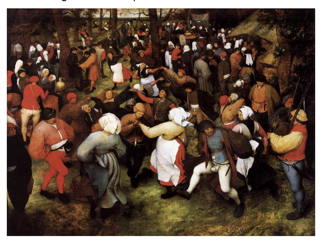
Painting 4 Pieter Brueghel the Elder - The Wedding Dance in the Open Air