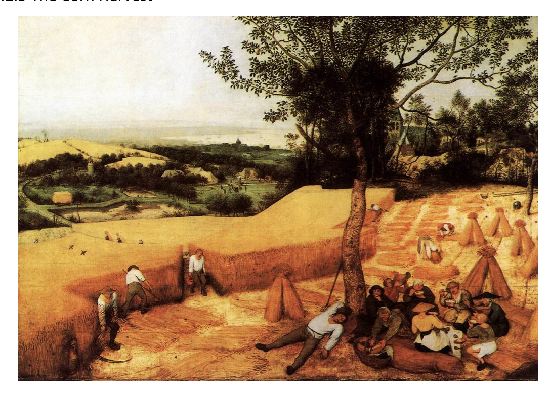
Painting 3 Pieter Brueghel the Elder - The Corn Harvest (August)