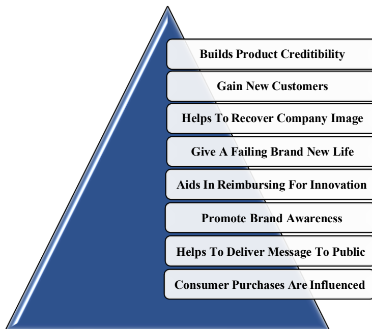
Figure 2 Advantages of Celebrity Endorsement