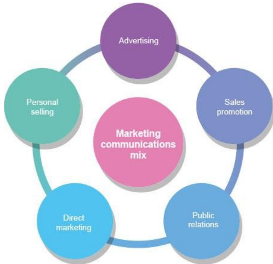
Figure 1 Marketing Communication Mix

interacting with an intended target group. Advertising, sales promotion, public relations, direct marketing, as well as personal selling constitute the five primary marketing communication strategies (Fill, 2009). Following are the different types of Marketing Communication.