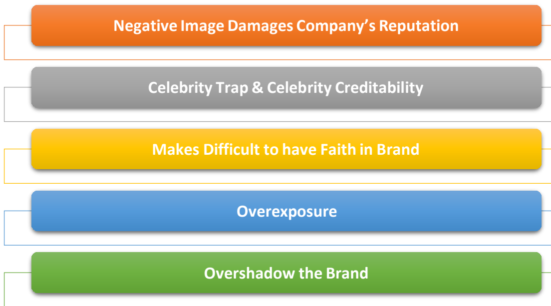
Figure 3 Dis-Advantages of Celebrity Endorsements