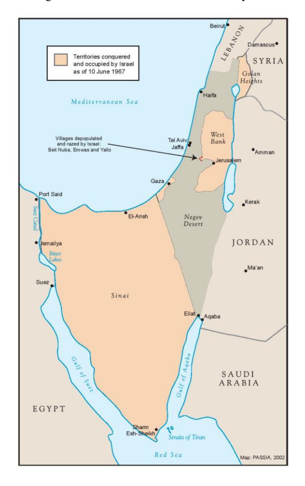
Figure 3 Israeli Territories after the Six-Day War

Jordanian air forces. Battles with Jordan in the West Bank ensued.<sup>58</sup> Israel captured the entire West Bank, including the Arab part of Jerusalem and major Arab cities including Ramallah and Bethlehem. It went on to defeat the Egyptian army, thus capturing the Gaza Strip and the entire Sinai Peninsula. In the north, it gained the Golan Heights from Syria. All territories that Israel acquired are shown in Figure 3.