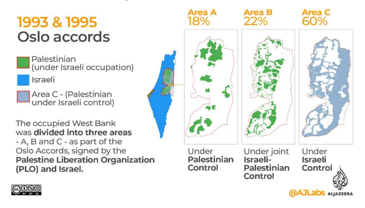
Figure 4 West Bank areas in the Oslo II Accord

Oslo II was signed in 1995. It contained provisions for the complete withdrawal of Israeli troops from six cities in the West Bank and about 450 towns. As you can see in the Figure 4, the West Bank was divided into three zones. Area A was to be exclusively administered by the Palestinian Authority. Area B was to be a jointly controlled area in which the Palestinians would exercise civil and police authority but Israel would retain authority over security issues. Area C was to remain under full Israeli civil and security administration. In this area were included the most controversial areas such as the Jewish settlements and military areas. In addition, the agreement set a timetable for elections to the Palestinian Legislative Council.<sup>79</sup>