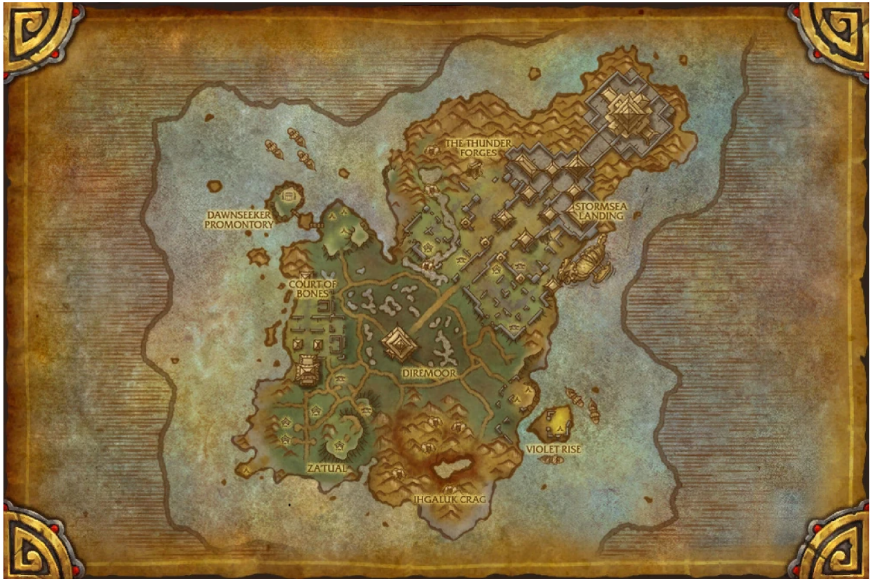
Figure 7: Isle of Thunder 128

Buildings on the Isle of Thunder are described through Khal'ak's perspective; "settlement that had been humbled by age," 129 with a brief mention of the harbor: "the ships rode the harbor's dark green surface." 130 The terrain of the island rises towards its tip, where the palace stands; "Khal'ak pointed back toward the palace hidden in the island's interior." 131 The palace also serves as a raid (battle scenario, larger scale than dungeon) location for players.