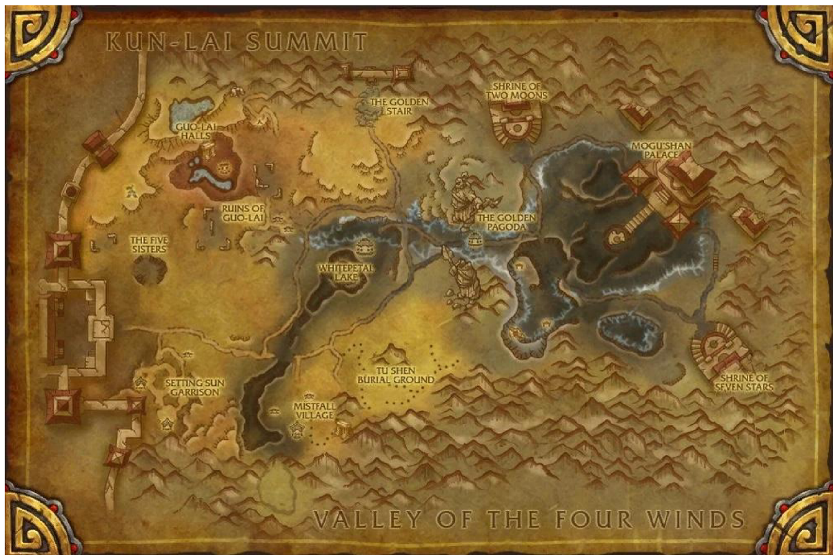
Figure 4: Vale of Eternal Blossoms 106

Those quotations describe one of the rooms in the Shado-pan Monastery and its details; “...fitted with a reed mat. At its heart sat a small table with a terra-cotta teapot, three cups, a whisk, a bamboo ladle, a tea caddy, and a tiny cast-iron pot.” 107 “The cast-iron pot’s lid had an ocean wave motif worked onto it. The terra-cotta teapot had been shaped like a ship. The handle had been formed out of an anchor.” 108 “band of symbols running round the middle represented each of Pandaria’s districts.” 109 The Shado-pan Monastery in the game cannot be accessed outside of the dungeon (in-game battle scenario). While in the dungeon, the interior of the monastery is not furnished to be inhabited, as the book describes. There are some reed mats, but also kegs (with most likely beer, considering its importance in the culture), drums, and weaponry. The interior is not divided into rooms or floors, it is massive in scale, incomparable to the size of the player or NPCs (non-playable characters), giving the impression of an exterior or uninhabitable space. However, dungeons are combat scenarios with the goal of carrying some of the lore (story-wise, they have several other functions for