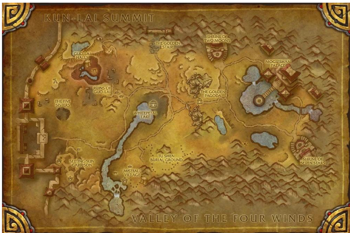
Figure 3: Vale of Eternal Blossoms 105

The first map displays Vale of Eternal Blossoms after patch 8.3.0 (expansions comprise of patches, released in chronological order, which provide new parts of the game and build on one another), when the damage inflicted by Garrosh Hellscream (leader of the Horde in that time period) and the Horde was reversed, and the vale was cleansed by the August Celestials (four Wild Gods of Pandaria, one of which is Xuen—the White Tiger) 103 and efforts of the Golden Lotus (guardians of the vale, picked by the August Celestials). 104 The map Vol’jin describes must be the map described above because the second map dates later to the storyline—from patch 5.4.0. to patch 8.3.0. (the patch chronology may seem illogical, however, the player can access the vale after the patch 8.3.0., and the novel storyline happens before patch 5.4.0.).