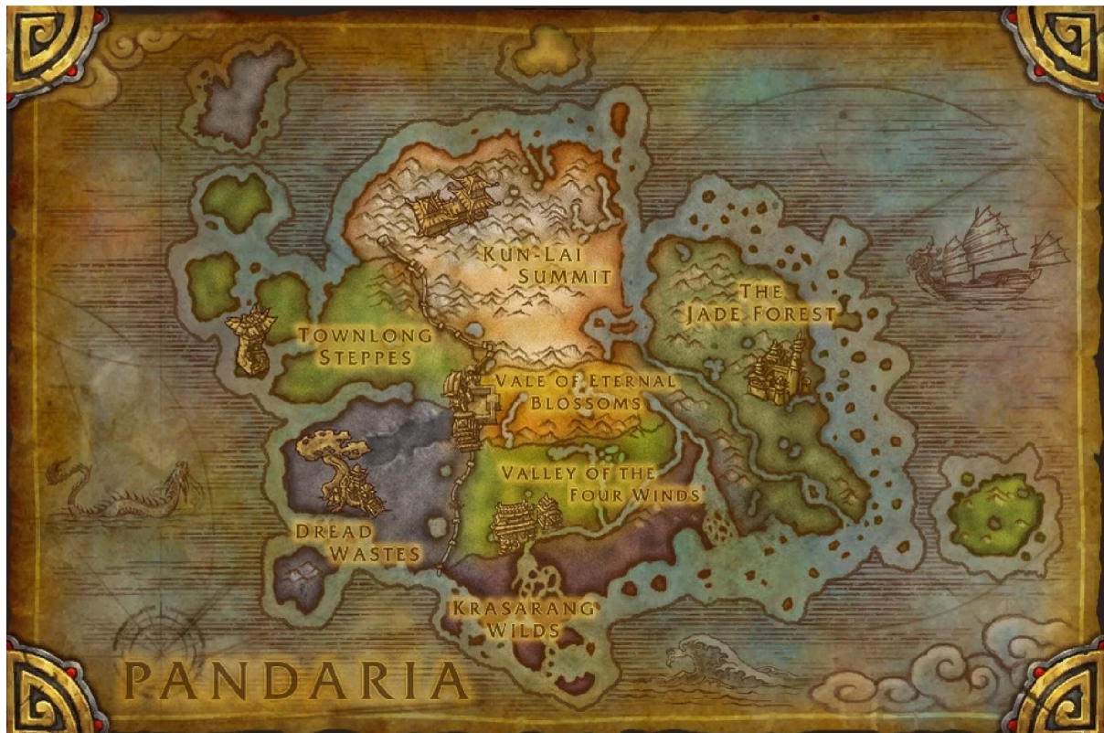
Figure 6: Pandaria 121

world-building in the novel, however is not transferable to the game, because the monastery is at the very north of Pandaria, which means it is not possible to see that far south. The novel conveys the overall look of Pandaria, which is dominated by green color, yet Kun-lai Summit is mostly deep brown and orange, and the Vale of Eternal Blossoms is mostly yellow and orange. There is one more similar scene which can be replicated in the game; “He opened his arms to take in the vista of the narrow valley with steep mountainsides. Below, a stream snaked along, blue where the sun could not touch it, silver where it did. Green, so much green and very deep, along with the rich brown of cultivated fields, screamed fertility. Even the way the buildings had been constructed into the landscape, adding to it without exploiting it, felt incredibly right.” 120 It also could not be applied to Kun-lai Summit and the Vale of Eternal Blossoms but to the Vale and Valley of the Four Winds. The description of the view is extremely accurate.