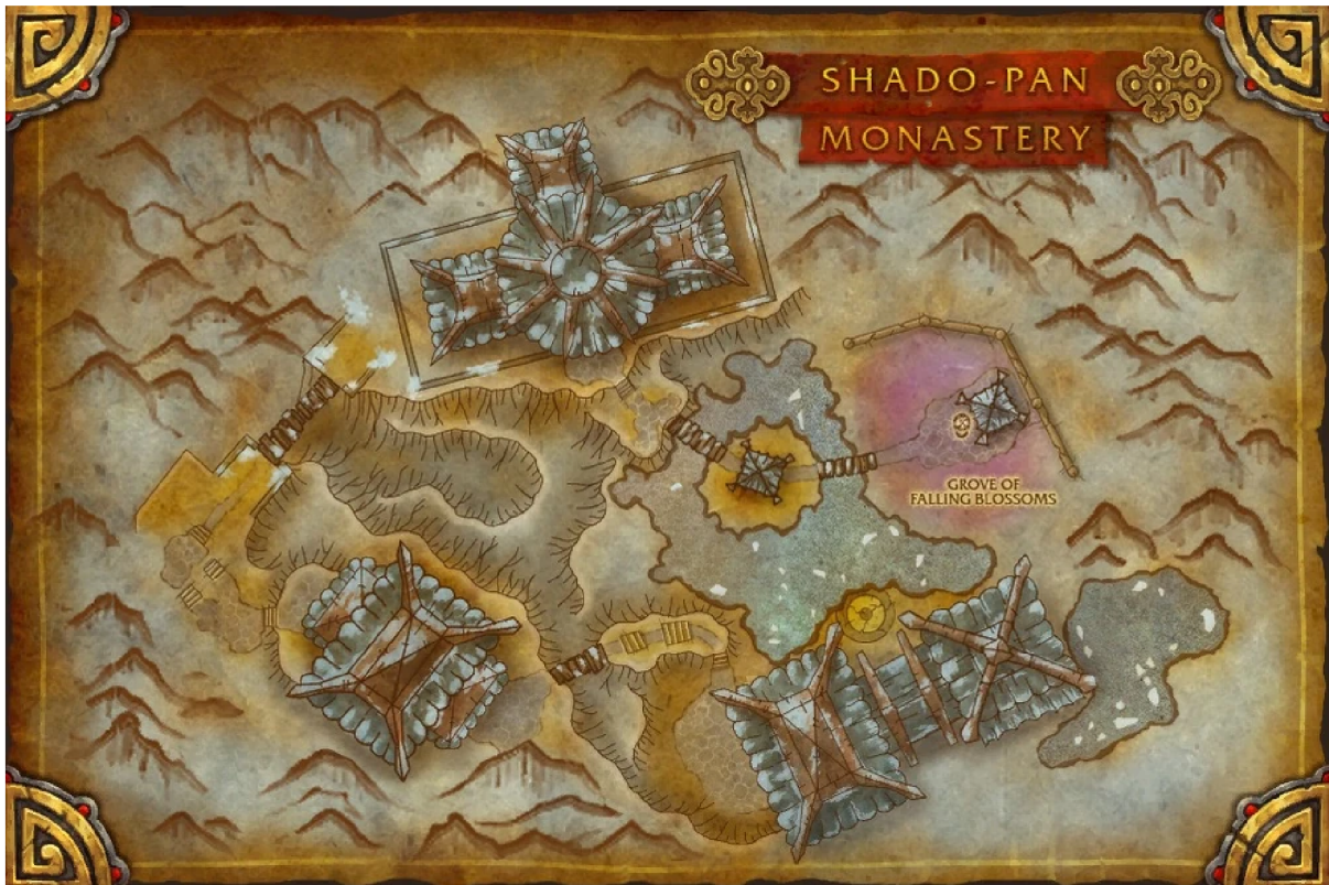
Figure 5: Shado-pan Monastery 116

It is mentioned that; “Vol’jin found it reminiscent of Durotar—though considerably colder.” 117 The likeness could not have been visual, it must have been his personal sentiment, because at the Shado-pan Monastery, snow covers everything, the only vegetation—trees, and grasses, are completely different from those in Durotar.