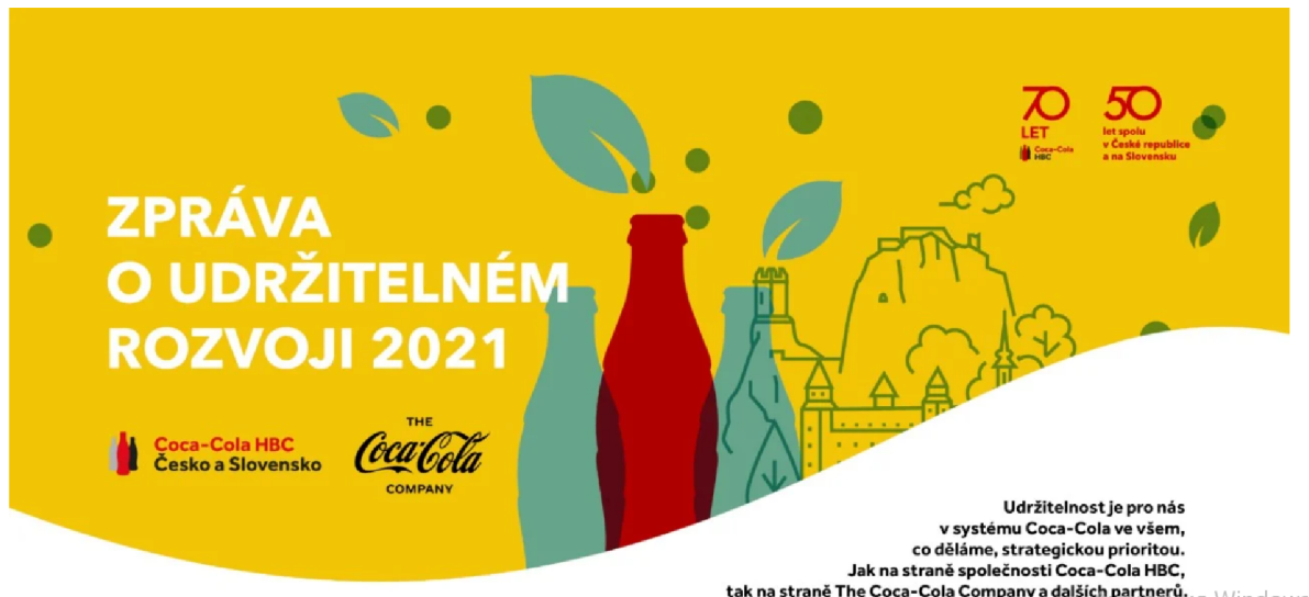
Image 22: An example of a “Corporate Social Responsibility” advertisement made by Coca-Cola in 2021, taken from the company’s official Instagram of Coca-Cola Czech Republic account..

Overall, Coca-Cola's advertising in the Czech Republic combines global brand consistency with localized content to create meaningful connections with Czech consumers. By incorporating Czech cultural elements, emphasizing emotional appeal, and efficient innovative marketing channels, Coca-Cola maintains a strong presence and resonates with audiences in the Czech market.