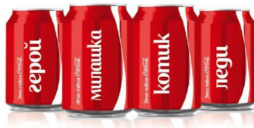
Image 8: The banner shows terms of endearment - "hero", "cutie", "cat", "lady" (quoted from left to right). An example of a “Open Feelings” advertisement made by Coca-Cola in 2021, taken from the company’s official Instagram account.