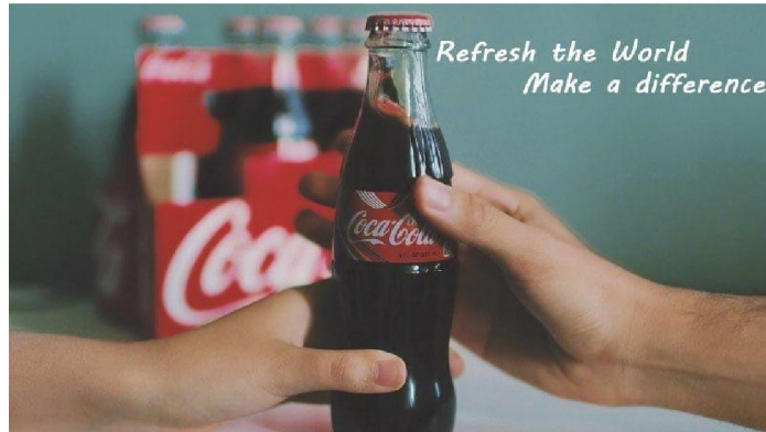
Image 5: An example of a “Well-being and Refreshment” advertisement made by Coca-Cola in 2021, taken from the company’s official Instagram account.

In summary, advertising plays a central role in shaping consumer perceptions, driving economic activity, and influencing societal values and behaviors. As a powerful communication tool, advertising bridges the gap between businesses and consumers, facilitating brand engagement, market transactions, and cultural discourse in the modern globalized world.