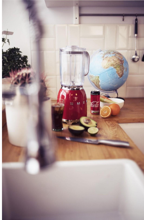
Image 21: An example of a “Engagement with Local Influencers” advertisement made by Coca-Cola in 2021, taken from the company’s official Instagram of Coca-Cola Czech Republic account..

Corporate Social Responsibility (CSR) Initiatives: Coca-Cola's advertising in the Czech Republic may also highlight its CSR initiatives and community involvement. This could include campaigns promoting environmental sustainability, health and wellness, or support for local charitable causes.