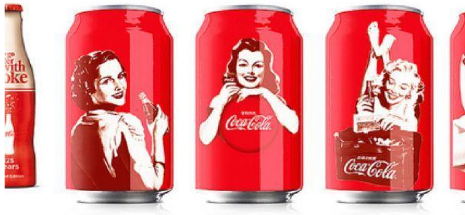
Image 3: An example of a “Tradition and Nostalgia” advertisement made by Coca-Cola in 2017, taken from the company’s official Instagram account.

nostalgia Coca Cola builds connections, with consumers reinforcing timeless values and memories associated with the brand.