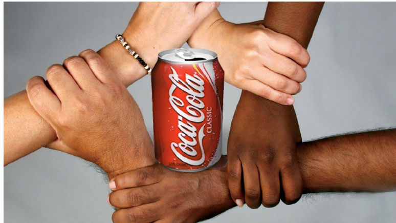
Image 15: An example of a “Diversity and Inclusion” advertisement made by Coca-Cola in 2022, taken from the company’s official Instagram account.

has established a wide range of monitoring and reporting metrics to ensure fairness in their employment-related decisions and to support their diversity and inclusion initiatives.