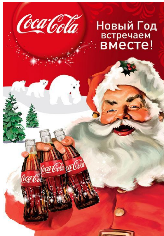
Image 9: The banner shows - "Let's celebrate the New Year together". An example of a "New Year with Coca-Cola" advertisement made by Coca-Cola in 2021.

Seasonal and Regional Preferences: Coca-Cola's advertising in Russia reflects seasonal and regional preferences, with campaigns tailored to Russian holidays and cultural events. For instance, the "Новый Год с Coca-Cola" ("New Year with Coca-Cola") campaign is a staple during the festive season, leveraging the importance of New Year celebrations in Russian culture.