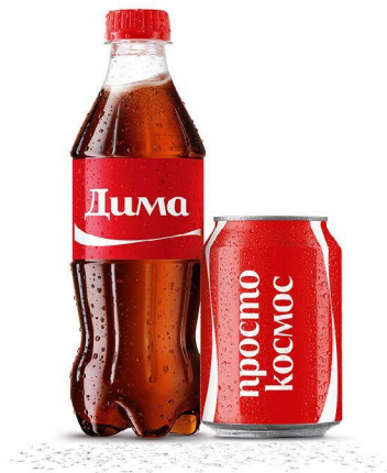
Image 7: The banner shows - on the left side a bottle with the inscription "Dima", on the right side of the bottle "You are just space". An example of a “Open Feelings” advertisement made by Coca-Cola in 2021, taken from the company’s official Instagram account.