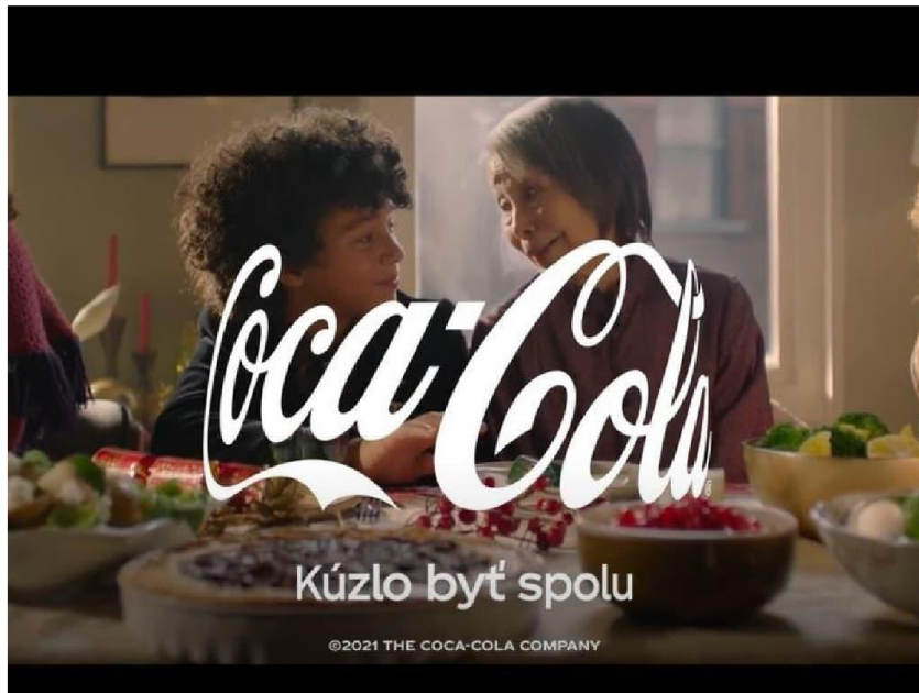
Image 18: An example of a “Emotional Appeal” advertisement made by Coca-Cola in 2021, taken from the company’s official YouTube of Coca-Cola Czech Republic account..

Innovative Marketing Channels: Coca-Cola utilizes a variety of marketing channels to reach Czech consumers, including television commercials, digital advertising, social media campaigns, and outdoor advertisements. These channels are tailored to match the media consumption habits of Czech audiences.