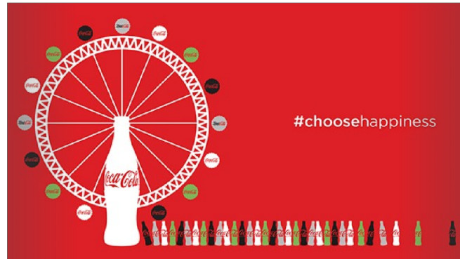
Image 1: An example of a “Happiness and Joy” advertisement made by Coca-Cola in 2015, taken from the company’s official Instagram account.

Happiness and Joy; Coca Cola's advertisements frequently highlight themes of happiness, joy and togetherness depicting moments of celebration, friendship and optimism. These campaigns convey the value of positivity and enjoyment resonating with consumers' desire, for uplifting experiences, in their lives.