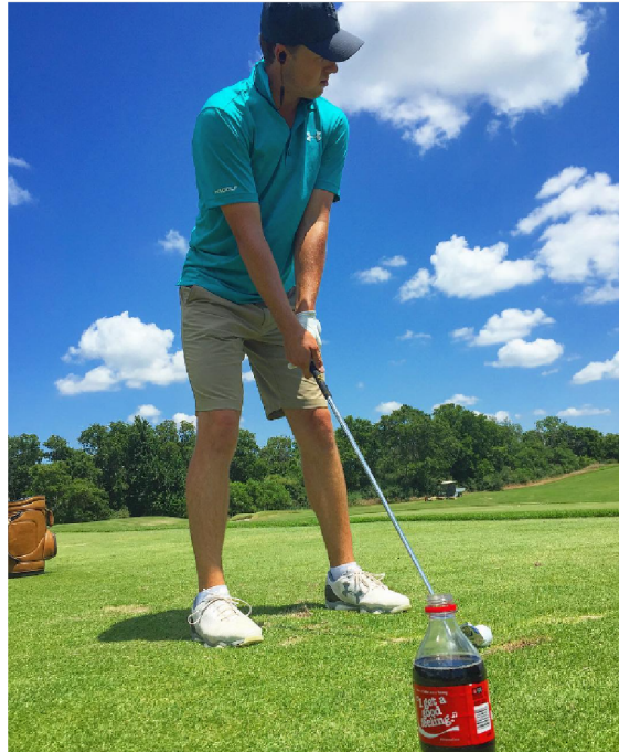
Image 14: An example of a “Celebrity Endorsements” advertisement made by Coca-Cola in 2023, taken from the official Instagram account of professional golfer - Jordan Spieth (Instagram nickname - jordanspieth)

brand visibility, appeal to target demographics, and generate buzz around Coca-Cola products.