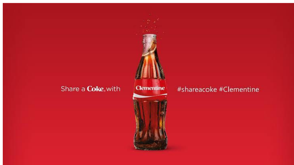
Image 2: An example of a “Unity and Togetherness” advertisement made by Coca-Cola in 2016, taken from the company’s official Instagram account.

Unity and Togetherness; Coca Cola's famous "Share a Coke " initiative promotes the importance of coming and embracing diversity by encouraging individuals to share personalized Coca Cola bottles with their friends, family and loved ones. This initiative celebrates differences and relationships nurturing a feeling of unity and belonging within the community of consumers.