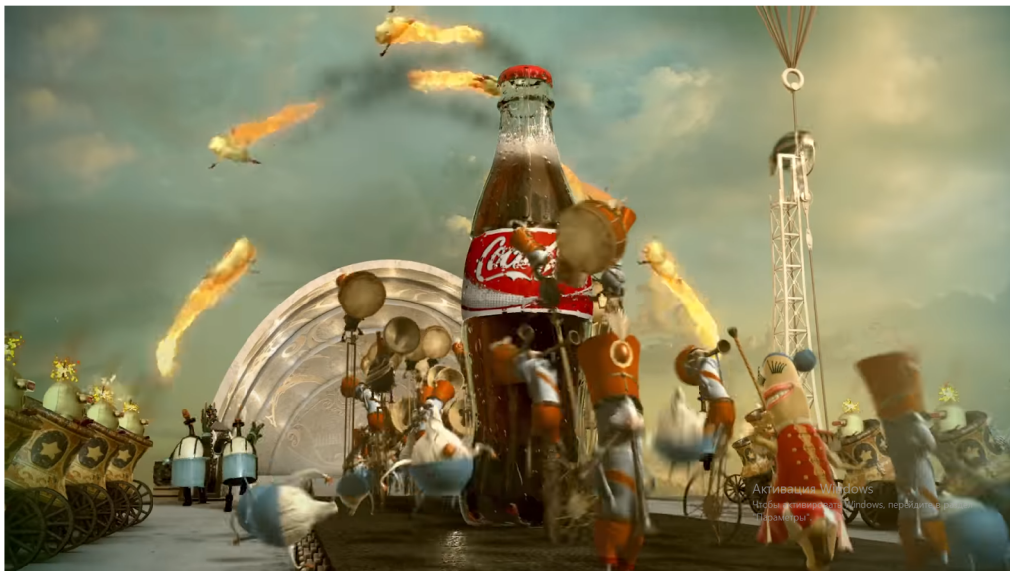
Image 13: An example of an “Iconic Campaign” ad made by Coca-Cola in 2006, taken from the company’s official YouTube account ( https://www.youtube.com/watch?v=gx-zPheFnHo&t=68s ).

Happiness Factory (2006) We take a leap in time with our next high-production pick. This longer-than-usual animation video saw the Coca-Cola brand venturing into a new space and a new style of advertising. With creativity and imagination in this one liked that of a Doctor Seuss book. Pulling viewers from the sidewalk into a vending machine and taking them on a journey through the mythical process of making a bottle of Coke. If this is what Coca-Cola can do for the creative mind, then fill up my refrigerator, please.