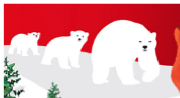
Image 10: Part of the banner from image 9, which provides detailing and customization for the Russian market from the Coca-Cola brand.

The choice of depicting polar bears from the Soviet cartoon "Umka" in the advertising banner created for the Russian segment of the market holds several strategic implications: