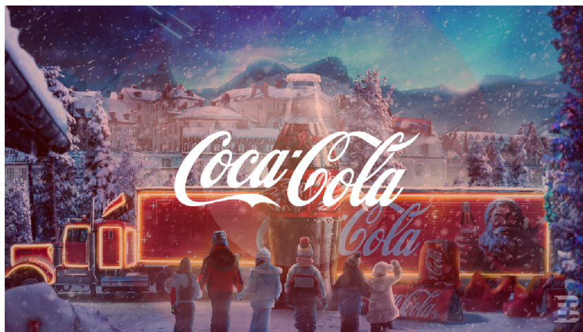
Image 17: An example of a “Holidays Are Coming” advertisement made by Coca-Cola in 2024, taken from the company’s official Instagram account.

Seasonal Campaigns: Coca-Cola's advertising in the USA includes seasonal campaigns tailored to specific occasions, such as the Super Bowl, Fourth of July, and Christmas. These campaigns capitalize on the festive spirit and cultural significance of these events to engage consumers and drive sales.