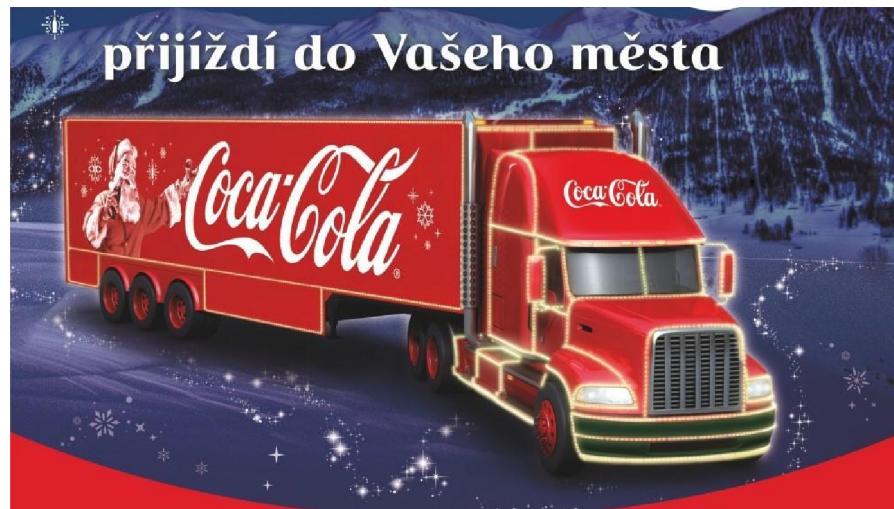
Image 19: An example of a “Seasonal Campaigns” advertisement made by Coca-Cola in 2022, taken from the company’s official YouTube of Coca-Cola Czech Republic account..

days. Coca-Cola may sponsor popular summer events and offer branded merchandise or experiences to enhance consumer engagement and brand visibility.