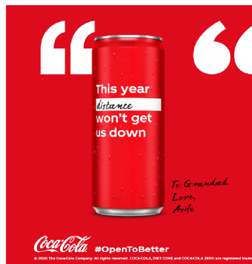
Image 4: An example of a “Optimism and Hope” advertisement made by Coca-Cola in 2020, taken from the company’s official Instagram account.

Coca Cola's advertisements frequently convey messages of positivity, hope and potential motivating people to embrace a future and chase after their aspirations. These campaigns represent the importance of optimism urging individuals to move with assurance and inner strength when faced with obstacles.