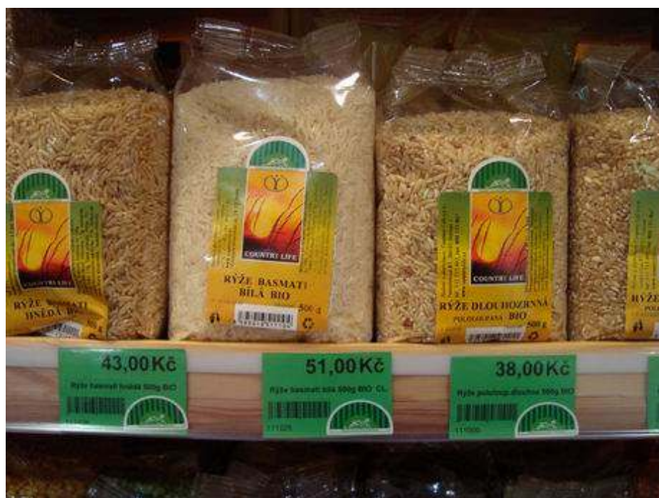
Figure 12: Country Life products

Empirical research – observation: the range of products very wide, for some of the products there was a possibility to choose between several types, special products range – Country Life, some products imported from other countries, products placed and labeled well, service and advice very good, staff is keen to help and inform, they do not have any meat product – focusing mainly on products for vegetarian and vegans.