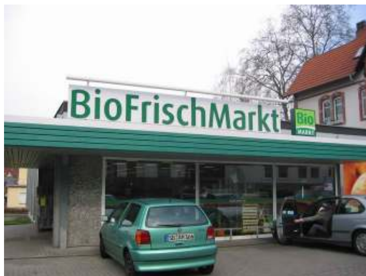
Figure 2 : Biosupermarket in Germany

In Europe there is the largest and the most developed market with organic products, the turnover for the year 2006 was approximately 15 EUR. Till the year 2005 the largest market with the highest profits in organic farming was in the Northern America. Actually, in Europe the majority of sales of organic products is centralised to Western Europe, dominated by Germany, France, Italy and the United Kingdom. These countries comprise 75% of overall European turnover. Countries with the fastest development of the market with organic products are Germany and the United Kingdom. The fast growth of the German market with organic products is caused partly by main retailers entering this market. Organic foodstuff is becoming common and available in supermarkets, in smaller shops, drugstores and pharmacies. There is a permanent demand in biosupermarkets and bioshops.