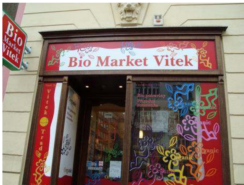
Figure 10: my own photo

Empirical research – observation: the range of products very wide, for some of the products there was a possibility to choose, no special products range, some products imported from other countries, products placed and labeled well, service and advice good.