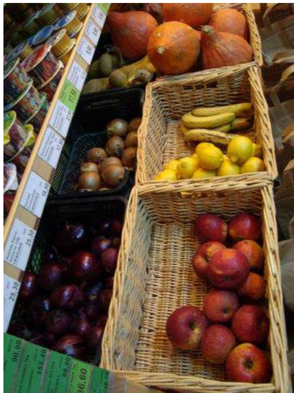
Figure 6: Specialized shop with bio

For some of the shops it is very hard to compare the range of products because they have simply different products or sometimes they miss the specific commodity. However, it is also interesting to analyze the range of products, how it is divided from conventional products or even the service and the advice they offer in the shop.