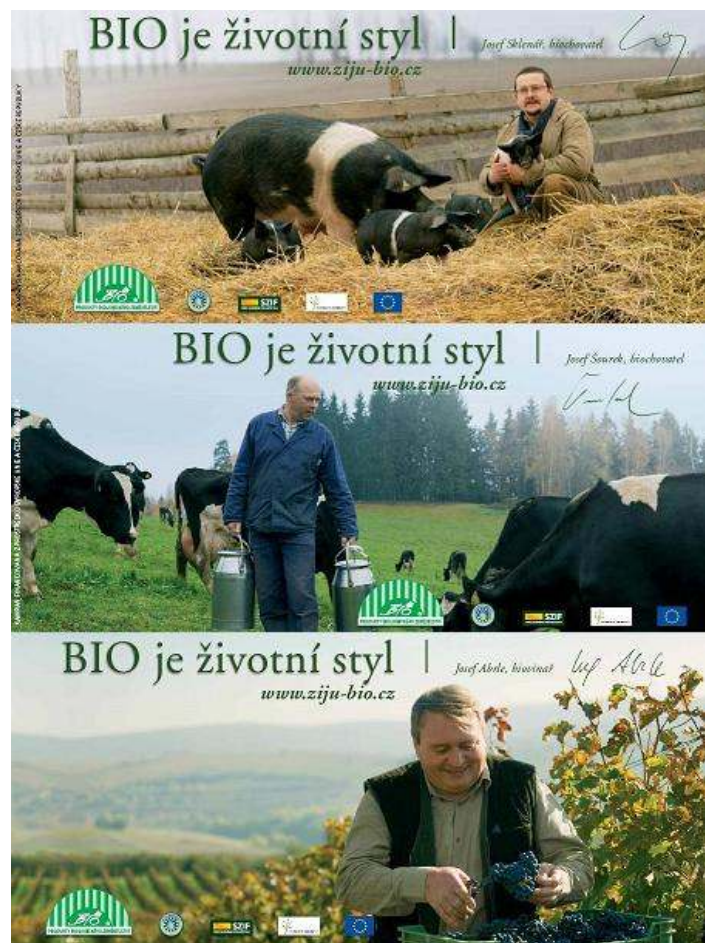
Figure 5: Bio is a life style, source: picture from Bio – zpráva z výzkumu, Ogilvy [online] http://www.mze.cz/Index.aspx?ch=73&typ=2&ids=3346&val=3346

From the research survey of the company leading this project Ogilvy (November 2008) is obvious that the first phase of the campaign actually has some positive impact. Advertising reached some increase of awareness of the targeted group and the campaign is valued positively in the eyes of public. However, it is the goal for the long run.