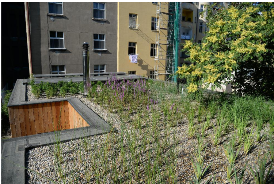
Picture 7: a closer look on the wetland roof showing different types of plants and a permeable ground (Centrum Pasivního Domu, 2022).