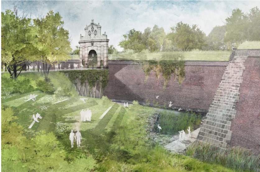
Picture 8: Vyšehrad park with rainwater management features such as a pond and different types of plant species. Nonetheless, it comprises a space for leisure activities and nature protection (CAMP, 2020).