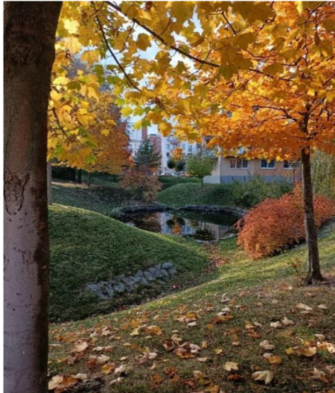
Picture 4: showing a water reservoir for rainwater retention surrounded by trees and other vegetation.

In the case of extreme down pours, water can spill from the reservoir into the basin and percolate into the ground or, if needed, into the recipient. Another function of the body of water is to cool the air in hot summer days as do the trees.