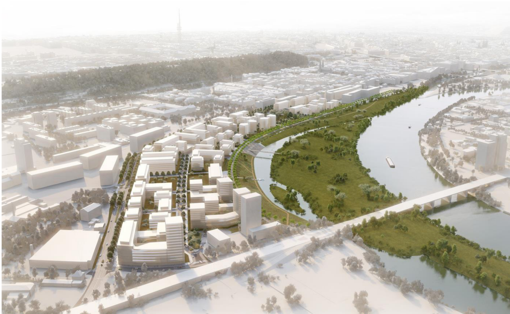
Picture 10: Rohan park situated as a flood protection area (CAMP, 2020).

The ecosystem services supplied are water runoff and microclimate regulation, air and water quality, noise reduction, recreation and aesthetic function (INCONEX, a.s., 2021).