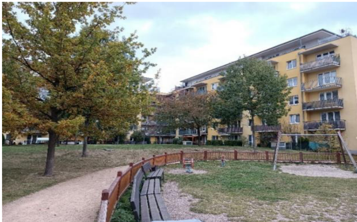
Picture 3: showing several GI elements – green underground parking lot roof, large-crowned trees, permeable surfaces, which combine ecological function with social function.

Trees with large crowns aid with shading and cooling the space as well as with air circulation. The ground of the playground in Picture 3 has a permeable surface, which again, allows for water infiltration if needed. Also, the area with trees covers an underground parking lot, which has a green roof and is effectively used as a public green space.