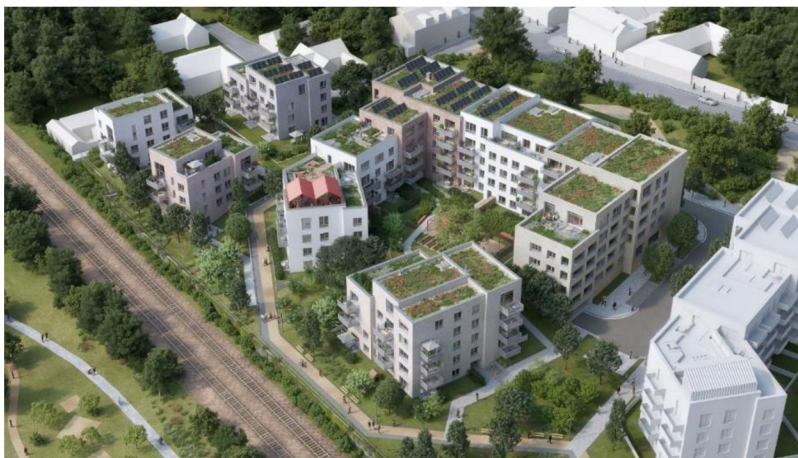
Picture 11: Visualization of the residential area showing green roofs, solar panels, green infiltration surfaces and many public green areas (Skanska, 2021).

The buildings will have a PENB B certification (Energy Performance Certificate) – classifying them as energy efficient (Skanska, 2021). Water management is a large issue and thus it will be solved by several different practises. Firstly, green roofs will be used for rainwater retention. 1 m 2 of a green roof can retain up to 35 litres of rainwater at one moment. Retained rainwater will be stored in accumulation tanks, that will have capacity of 190 000 litres. When needed, this water will be used for watering the gardens and green elements in the complex. Also, the gardens will be constructed so that rainwater can be absorbed effectively during rainfalls. That means uneven gardens with little hills and sags. Another example of water management is the usage of low flow bathroom fittings such as a bathroom faucet or a shower. These will save up to 14% of drinking water. What's more, water from the bathroom will be cleaned and recycled using an in-built wastewater treatment. This water will be used for flushing as well as for washing machines to wash clothes. The usage of recycled water will save up to 31% of drinking water. Nature protection and the support of biodiversity are an integral part of the project. Thus, elements such as trees, birdhouses, lizard walls or bee willows will be included. To support insects, there will be over 7000 m 2 of flower fields instead of classical grass fields (Skanska, 2021).