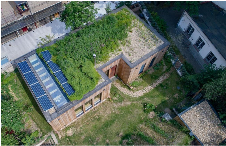
Picture 6: a bird's view on the roof of the house. Visible are solar panels as well as the wetland roof (Nadace Partnerství d, 2022).

Other benefits are regulation of surface runoff and biotope support for insects, butterflies, bees and other organisms. Part of the roof is also covered by solar panels. These are used for heating the water for the house. Furthermore, the house has a ground heat exchanger that is 40 metres long. In summer, it cools down the air while in winter, it warms it up. The air is then transferred to the house where it creates more humid microclimate. Oppositely, warm, dry air is used for example for drying clothes. It has been analysed that the return rate of the investment is about 20 years, while the longevity is twice as long. Yearly, the house saves 15000 Czech crowns due to all the green technologies (Nadace Partnerství d, 2022).