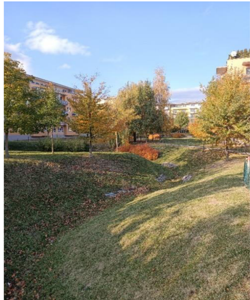
Picture 2: showing a land sag which allows for water infiltration and retention as well as slower water outfall into the recipient.

Trees with large crowns aid with shading and cooling the space as well as with air circulation. The ground of the playground in Picture 3 has a permeable surface, which again, allows for water infiltration if needed. Also, the area with trees covers an underground parking lot, which has a green roof and is effectively used as a public green space.