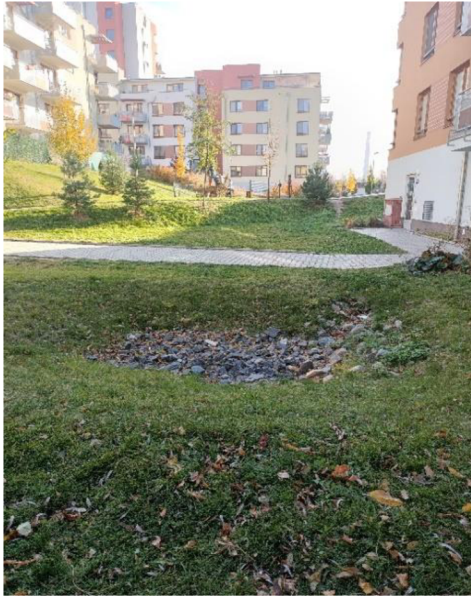
Picture 1: showing a land sag which allows for water infiltration and retention as well as slower water outfall into the recipient.