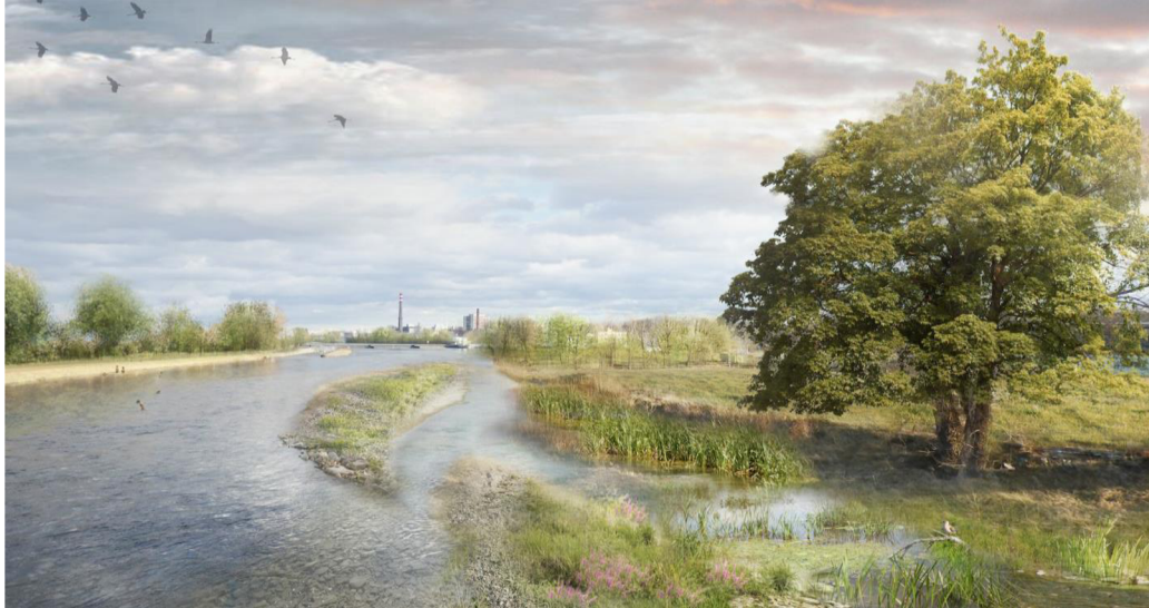
Picture 9: Troja basin with infrastructure-related projects as well as nature and landscape protection features (CAMP, 2020).

Furthermore, new connections and better conditions for pedestrians and cyclists should be constructed (IPR Praha). The ecosystem services provided by this project are water and air quality, microclimate regulation, biotope formation, noise reduction, recreation and education (INCONEX, a.s.,2021).