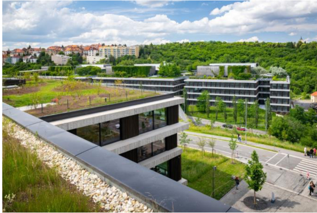
Picture 5: showing part of the ČSOB headquarters in Prague – Radlice Visible is a green roof as well as green permeable surfaces around the building (Nadace Partnerství b, 2022).

Fourth example of existing green infrastructure projects situated in Prague is the so-called House in the strait. It was prepared and realized between the years 2009 and 2014 and in 2014 it was awarded by Building Efficiency Awards. That is because the house's energy efficiency falls into category A. That is one of the highest possible categories, the higher categories being A+ and A++ which are passive buildings (Škvor, 2014). The house is mainly made up of wood as materials with low CO 2 production were chosen. The roof is green and extensive and is used for filtering rainwater which is then stored in tanks and used for flushing without any other stabilization. Rainwater that is not accumulated in the water tank is infiltrated. The green roof, as mentioned in the other projects as well, helps to regulate the temperature inside the building and regulates the microclimate. It also supports biodiversity. Furthermore, there is a tree planted in the courtyard which helps to regulate the temperature inside the house as well. The ecosystem services supplied are microclimate regulation, air and water quality, recreation, aesthetics, biodiversity support, water runoff and management (Nadace Partnerství c, 2022).