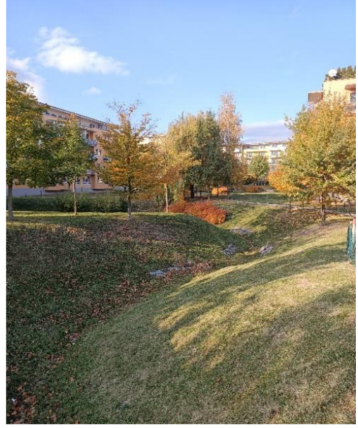
Picture 2: showing a land sag which allows for water infiltration and retention as well as slower water outfall into the recipient.

Trees with large crowns aid with shading