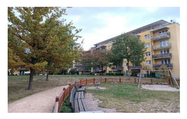
Picture 3 : showing several GI elements – green underground parking lot roof, large-crowned trees, permeable surfaces, which combine ecological function with social function.

and cooling the space as well as with air circulation. The ground of the playground in Picture 3 has a permeable surface, which again, allows for water infiltration if needed. Also, the area with trees covers an underground parking lot, which has a green roof and is effectively used as a public green space.