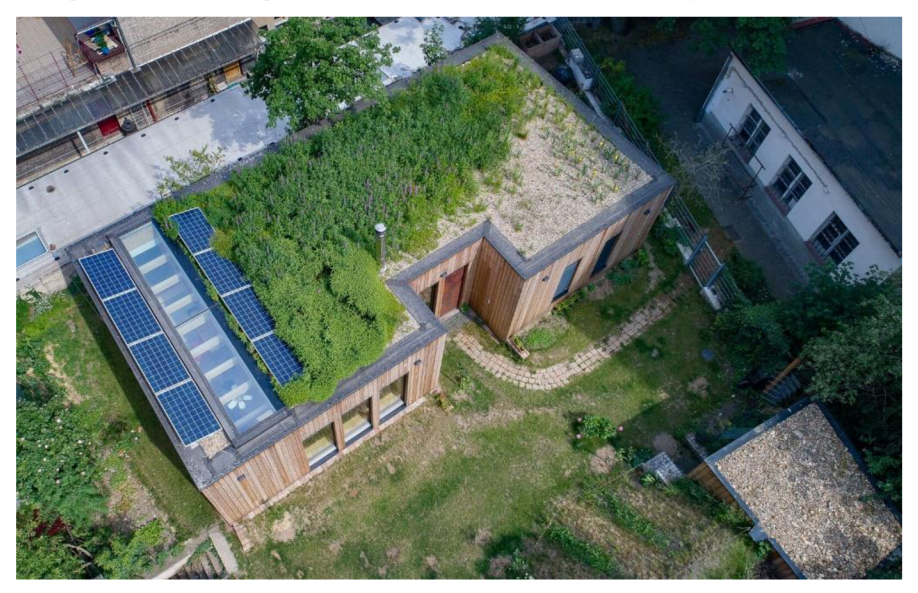
Picture 6: a bird's view on the roof of the house. Visible are solar panels as well as the wetland roof (Nadace Partnerství d, 2022).

Other benefits are regulation of surface runoff and biotope support for insects, butterflies, bees and other organisms. Part of the roof is also covered by solar panels. These are used for heating the water for the house. Furthermore, the house has a ground heat exchanger that is 40 metres long. In summer, it cools down the air while in winter, it warms it up. The air is then transferred to the house where it creates more humid microclimate. Oppositely, warm, dry air is used for example for drying clothes. It has been analysed that the return rate of the investment is about 20 years, while the longevity is twice as long. Yearly, the house saves 15000 Czech crowns due to all the green technologies (Nadace Partnerství d, 2022).