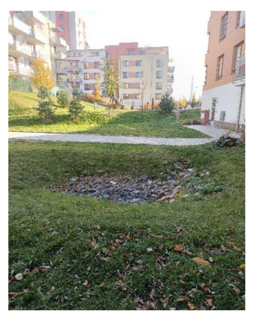
Picture 1: showing a land sag which allows for water infiltration and retention as well as slower water outfall into the recipient.

Trees with large crowns aid with shading