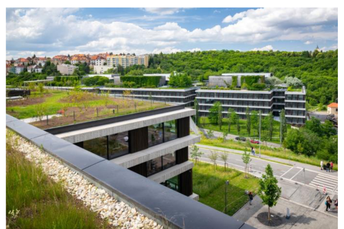
Picture 5: showing part of the ČSOB headquarters in Prague – Radlice Visible is a green roof as well as green permeable surfaces around the building (Nadace Partnerství b, 2022).

Fourth example of existing green infrastructure projects situated in Prague is the socalled House in the strait. It was prepared and realized between the years 2009 and 2014 and in 2014 it was awarded by Building Efficiency Awards. That is because the house's energy efficiency falls into category A. That is one of the highest possible categories, the higher categories being A+ and A++ which are passive buildings (Škvor, 2014). The house is mainly made up of wood as materials with low CO_2 production were chosen. The roof is green and extensive and is used for filtering rainwater which is then stored in tanks and used for flushing without any other stabilization. Rainwater that is not accumulated in the water tank is infiltrated. The green roof, as mentioned in the other projects as well, helps to regulate the temperature inside the building and regulates the microclimate. It also supports biodiversity. Furthermore, there is a tree planted in the courtyard which helps to regulate the temperature inside the house as well. The ecosystem services supplied are microclimate regulation, air and water quality, recreation, aesthetics, biodiversity support, water runoff and management (Nadace Partnerství c, 2022).