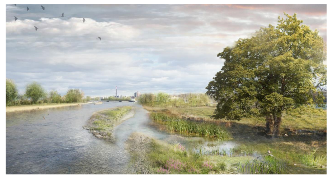
Picture 9: Troja basin with infrastructure-related projects as well as nature and landscape protection features (CAMP, 2020).

Furthermore, new connections and better conditions for pedestrians and cyclists should be constructed (IPR Praha). The ecosystem services provided by this project are water and air quality, microclimate regulation, biotope formation, noise reduction, recreation and education (INCONEX, a.s.,2021).