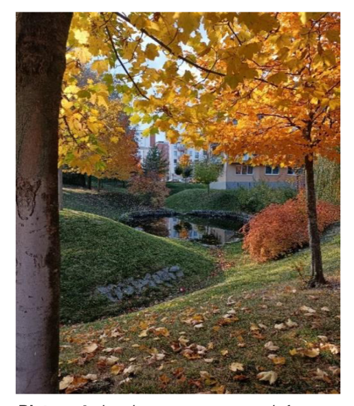
Picture 4: showing a water reservoir for rainwater retention surrounded by trees and other vegetation.

In the case of extreme down pours, water can spill from the reservoir into the basin and percolate into the ground or, if needed, into the recipient. Another function of the body of water is to cool the air in hot summer days as do the trees.