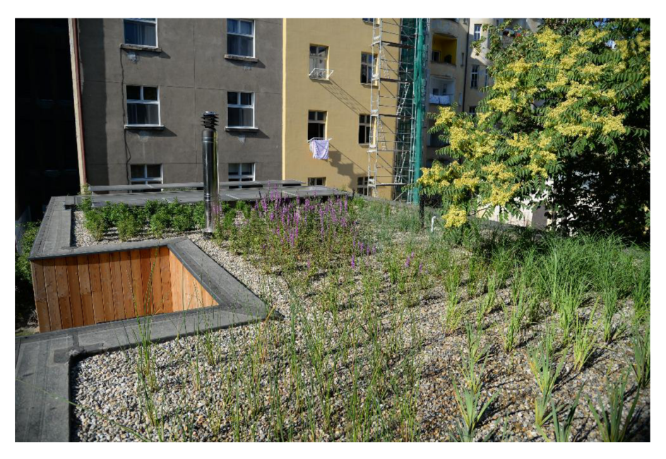
Picture 7: a closer look on the wetland roof showing different types of plants and a permeable ground (Centrum Pasivního Domu, 2022).