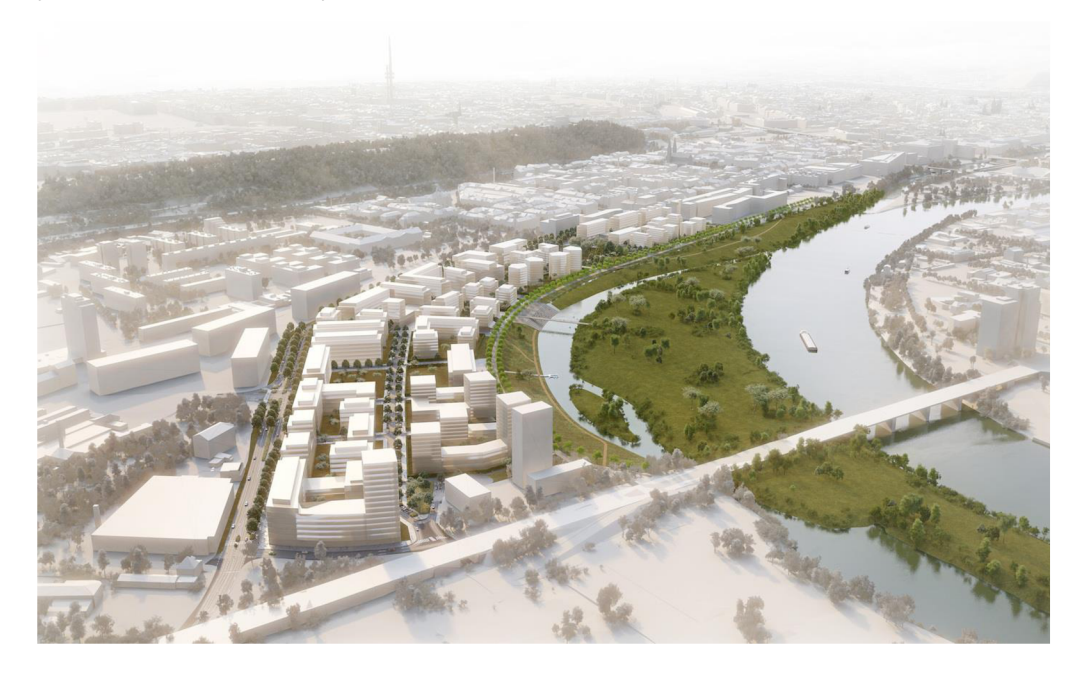
Picture 10: Rohan park situated as a flood protection area (CAMP, 2020).

The ecosystem services supplied are water runoff and microclimate regulation, air and water quality, noise reduction, recreation and aesthetic function (INCONEX, a.s., 2021).