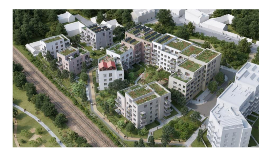
Picture 11 : Visualization of the residential area showing green roofs, solar panels, green infiltration surfaces and many public green areas (Skanska, 2021).

The buildings will have a PENB B certification (Energy Performance Certificate) classifying them as energy efficient (Skanska, 2021). Water management is a large issue and thus it will be solved by several different practises. Firstly, green roofs will be used for rainwater retention. 1 m<sup>2</sup> of a green roof can retain up to 35 litres of rainwater at one moment. Retained rainwater will be stored in accumulation tanks, that will have capacity of 190 000 litres. When needed, this water will be used for watering the gardens and green elements in the complex. Also, the gardens will be constructed so that rainwater can be absorbed effectively during rainfalls. That means uneven gardens with little hills and sags. Another example of water management is the usage of low flow bathroom fittings such as a bathroom faucet or a shower. These will save up to 14% of drinking water. What's more, water from the bathroom will be cleaned and recycled using an in-built wastewater treatment. This water will be used for flushing as well as for washing machines to wash clothes. The usage of recycled water will save up to 31% of drinking water. Nature protection and the support of biodiversity are an integral part of the project. Thus, elements such as trees, birdhouses, lizard walls or bee willows will be included. To support insects, there will be over 7000 m<sup>2</sup> of flower fields instead of classical grass fields (Skanska, 2021).