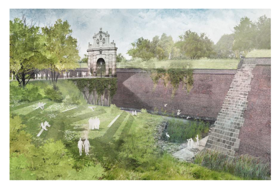
Picture 8: Vyšehrad park with rainwater management features such as a pond and different types of plant species. Nonetheless, it comprises a space for leisure activities and nature protection (CAMP, 2020).