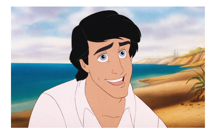
Picture 8. - The portrayal of Prince Eric ("The Little Mermaid", 1989)