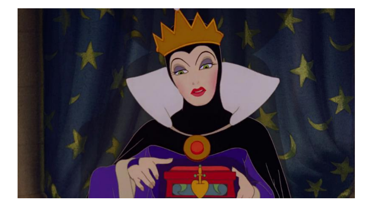
Picture 4. - The portrayal of an evil queen ("Snow White and the Seven Dwarfs", 1937)