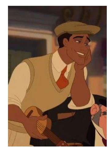
Picture 10. - The portrayal of Prince Naveen ("The Princess and the Frog", 2009)