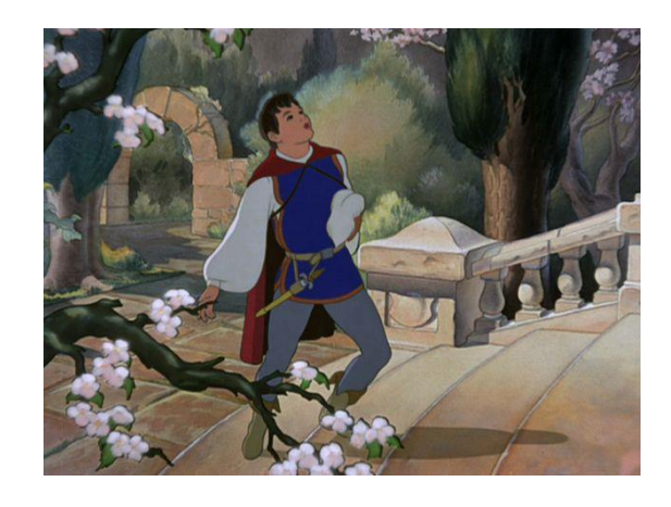
Picture 5 - The prince's portrayal in Snow White and the seven dwarfs ("Snow White and the Seven Dwarfs", 1937)