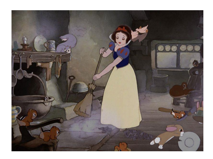
Picture 3. - The portrayal of Snow White ("Snow White and the Seven Dwarfs", 1937)