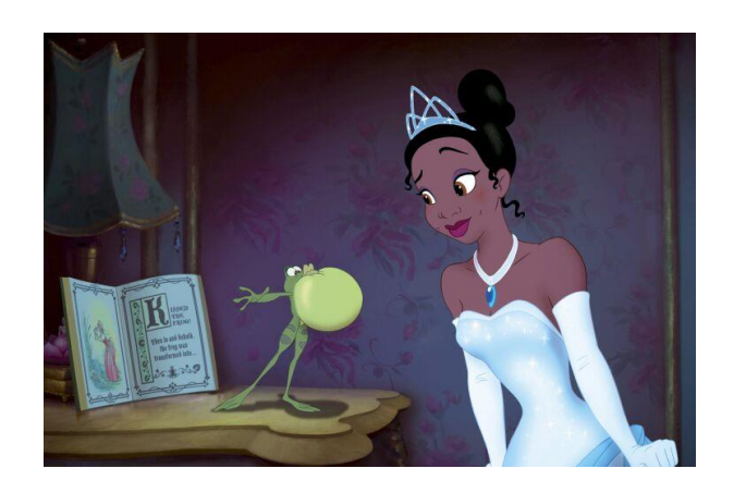
Picture 9. - The portrayal of Tiana ("The Princess and the Frog", 2009)