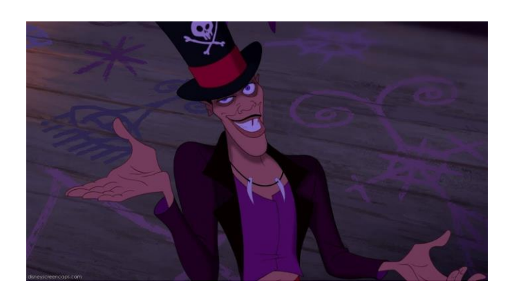
Picture 11. - The portrayal of Dr. Facilier ("The Princess and the Frog", 2009)